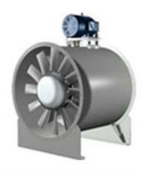
Axial inline fan