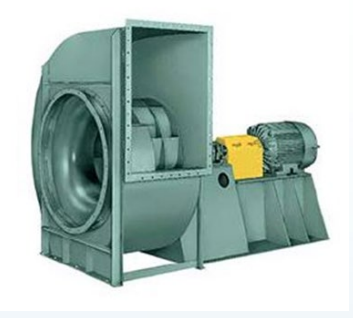
Centrifugal housed fan