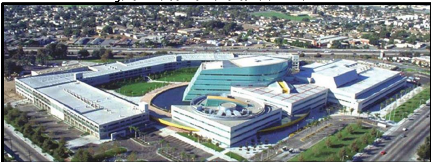
Figure 2: Kaiser Permanente Baldwin Park

Demonstration site for "A Systems-Efficient Approach to Hospital Decarbonization."