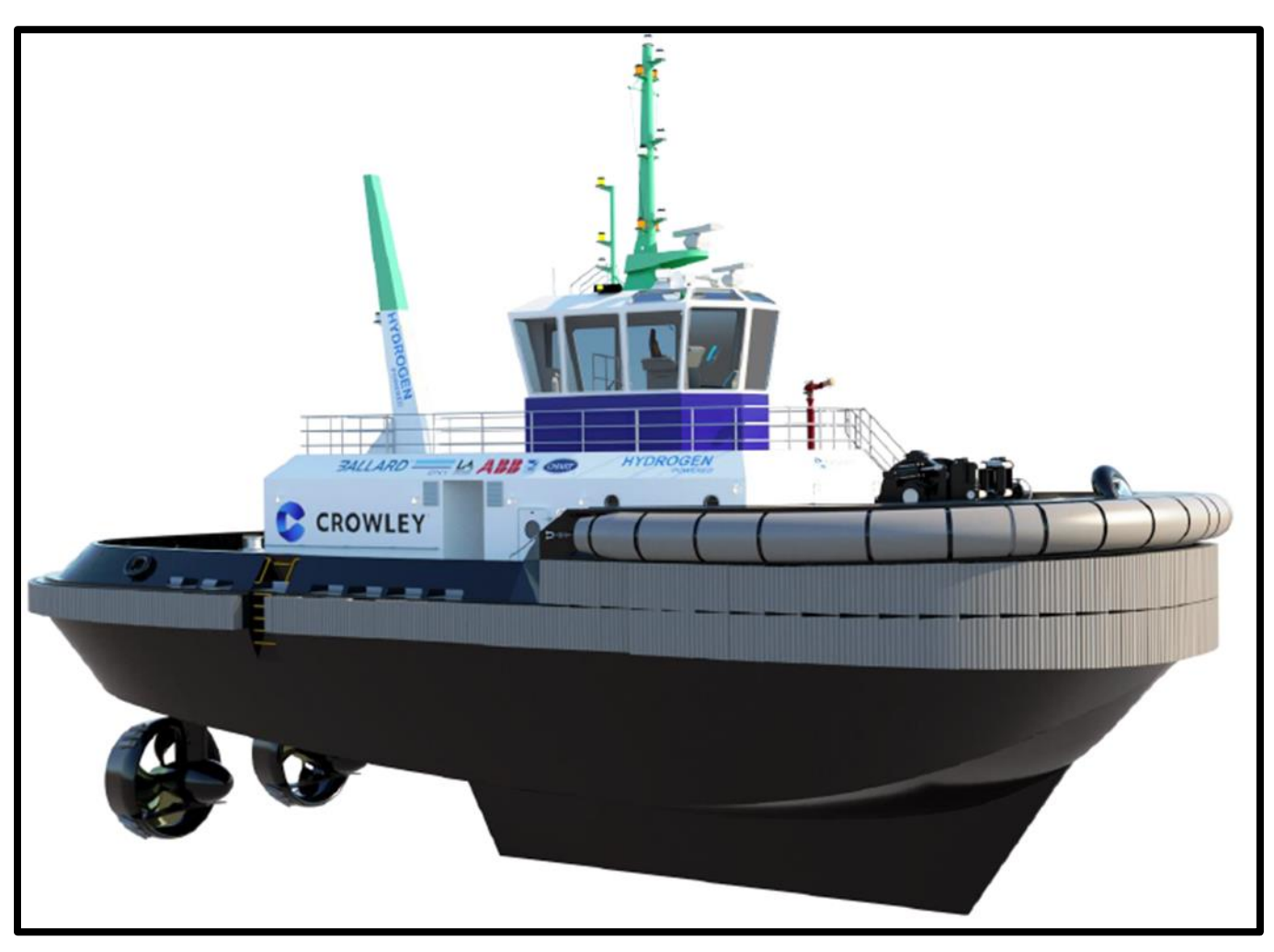
Figure 5: Hydrogen Fuel Cell Tugboat Rendering

2,400 kW of fuel cells, 1,740 megawatt-hours of batteries, and dual LH2 tanks with 1,875-kilogram (kg) capacities each. The team developed a regulatory map to identify potential roadblocks and pathways for meeting local and international safety requirements. The HyZET Consortium is seeking follow-on funding to build and deploy the vessel following completion of this project.