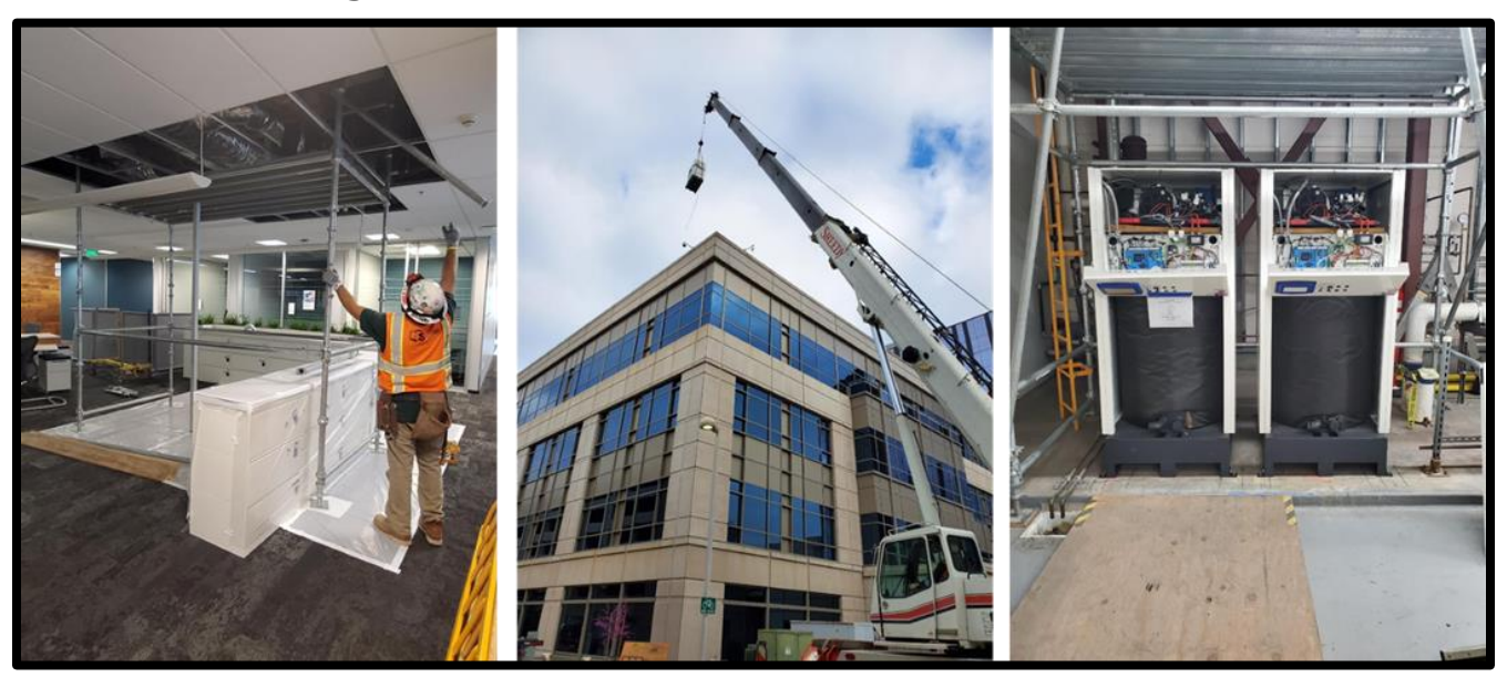
Figure 3: Boiler and Variable-Air-Volume Retrofits