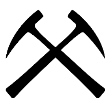
Reduced need for raw materials