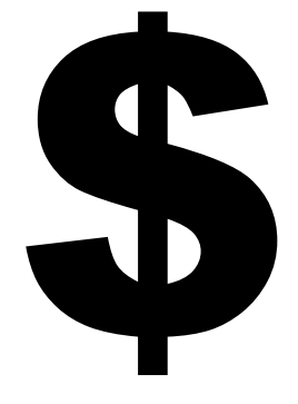
Potential for lowercost storage