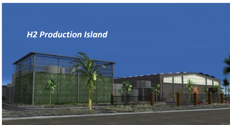
Figure 5. Design for Separated Biomass-to-Hydrogen Facility: 500-TPD feed, 30 TPD H 2 output

The City of Los Angeles adopted a 20-year (2005-2025) solid resources management plan called RENEW LA to achieve zero waste within the city by 2025. RENEW LA relies on the establishment of seven “conversion technology facilities,” with one facility located in each of the city's six waste-sheds, and a seventh facility located in the southern California region, to process post-source separated municipal organic wastes still being landfilled. The layout for a 500 ton/day biomass gasification plant making 30 tonne/day high-purity hydrogen can be architecturally appealing ( Figure-5 ).