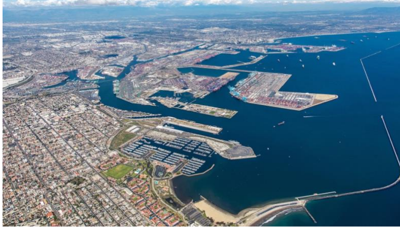
Figure 4. Biomass-to-Hydrogen Technology Planned for Los Angeles County

The City of Los Angeles adopted a 20-year (2005-2025) solid resources management plan called RENEW LA to achieve zero waste within the city by 2025. RENEW LA relies on the establishment of seven “conversion technology facilities,” with one facility located in each of the city's six waste-sheds, and a seventh facility located in the southern California region, to process post-source separated municipal organic wastes still being landfilled. The layout for a 500 ton/day biomass gasification plant making 30 tonne/day high-purity hydrogen can be architecturally appealing ( Figure-5 ).