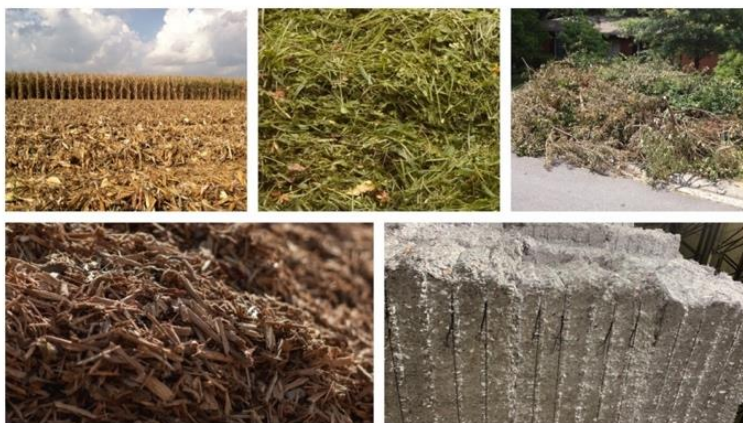
Figure 1. Separated Biomass, A Renewable Energy Feedstock

Biomass is an abundant domestic resource. “In the United States, there is more biomass available than is required for food and animal feed needs. A recent report projects that with anticipated improvements in agricultural practices and plant breeding, up to 1 billion dry tons of biomass could be available for energy use annually. For more information, see U.S. Billion-Ton Update: Biomass Supply for a Bioenergy and Bioproducts Industry .”