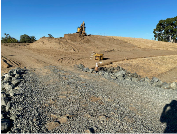
Figure 3. Progress construction photos from July 8, 2021 showing (a) condition of Excess Soils Pile, (b) fencing (posts and flagging tape) demarcating limits of disturbance in Excess Soils Pile area, and (c) buildup of pad for batteries.