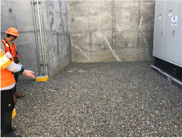
Figure 2. Pre-construction photographs of (a) “Electrical Building,” (b) “Electrical Conduit,” (c) “Batteries,” and (d) “Excess Soil Pile” areas indicated in Figure 1.