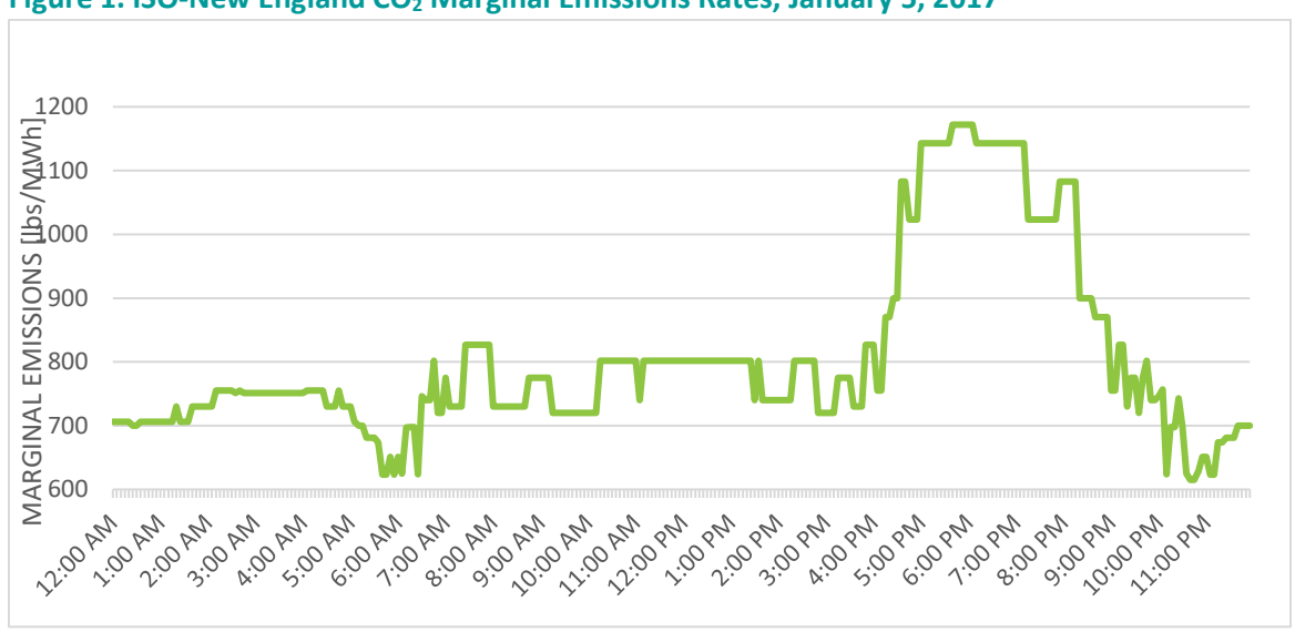
Figure 1. ISO-New England CO<sub>2</sub> Marginal Emissions Rates, January 5, 2017<sup>3</sup>

consumption usually in British thermal units (Btu) per square foot of building space. These metrics are very useful, but they do not reflect that a kilowatt-hour (kWh) of electricity consumed at one time may have a very different cost, emissions profile, and effect on grid operations than a kWh may have when used at another time.<sup>2</sup> For example, Figure 1 shows marginal carbon dioxide (CO<sub>2</sub>) emission rates over the course of a January day in the ISO-New England grid, with an almost two-fold difference in the marginal emission rate per megawatt-hour depending on time of day.