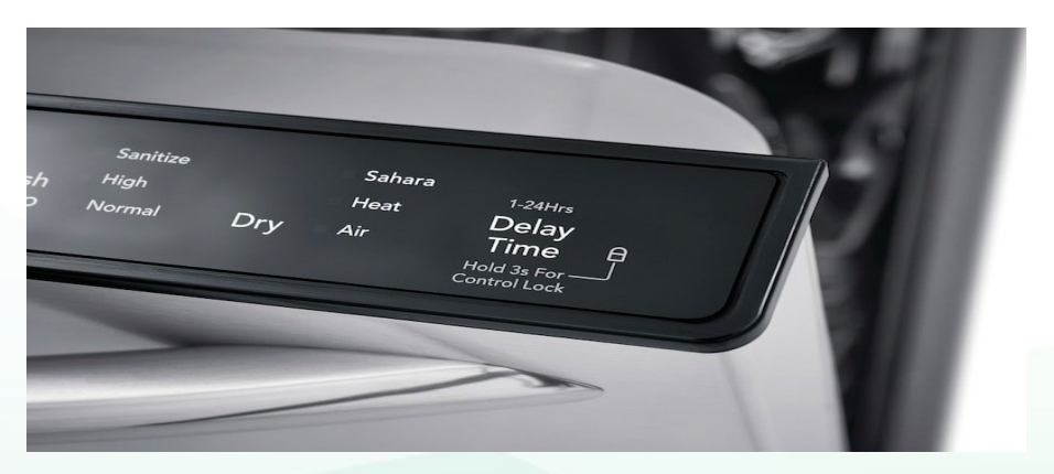
Frigidaire Dishwasher Delay Feature