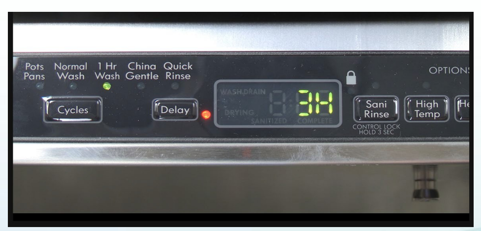
Whirlpool Electric Dishwasher Delay Feature