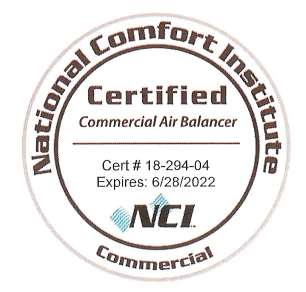
Derrick Manqueros Precision Air Balance