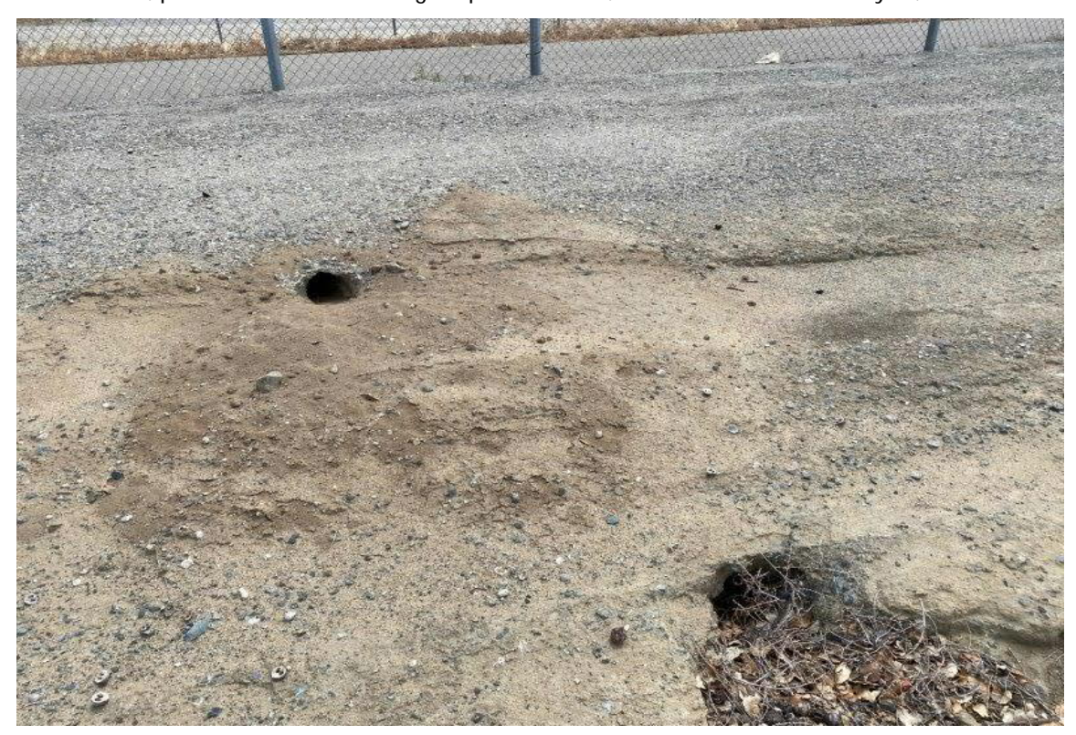
Photo 6, of potentially suitable burrowing owl burrow devoid of whitewash, pellets or other sign of active use, 5-15-20.