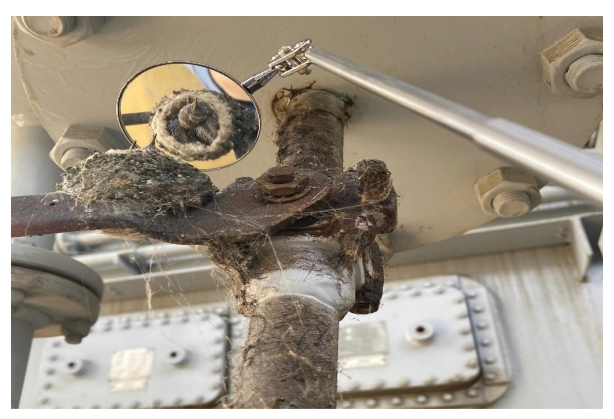
Photo 7, of deceased juvenile Anna's hummingbird in nest at Unit B, 6-10-20.