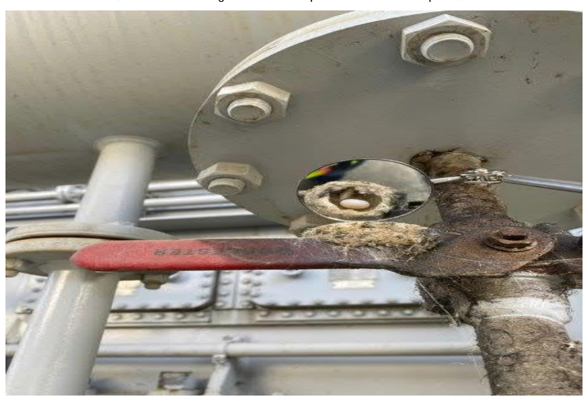
Photo 4, close-up of Anna's hummingbird nest with an egg at Unit B, 4-24-20.