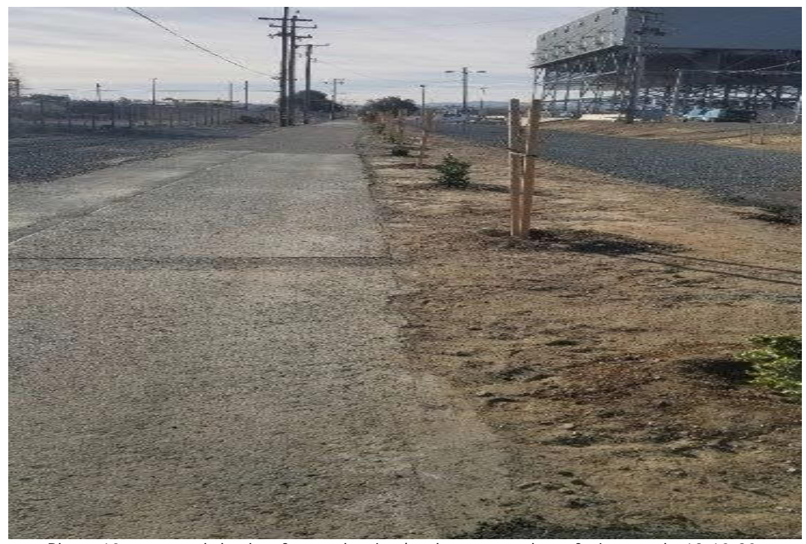
Photo 10, trees and shrubs after replanting/replacement, photo facing south. 12-10-20.