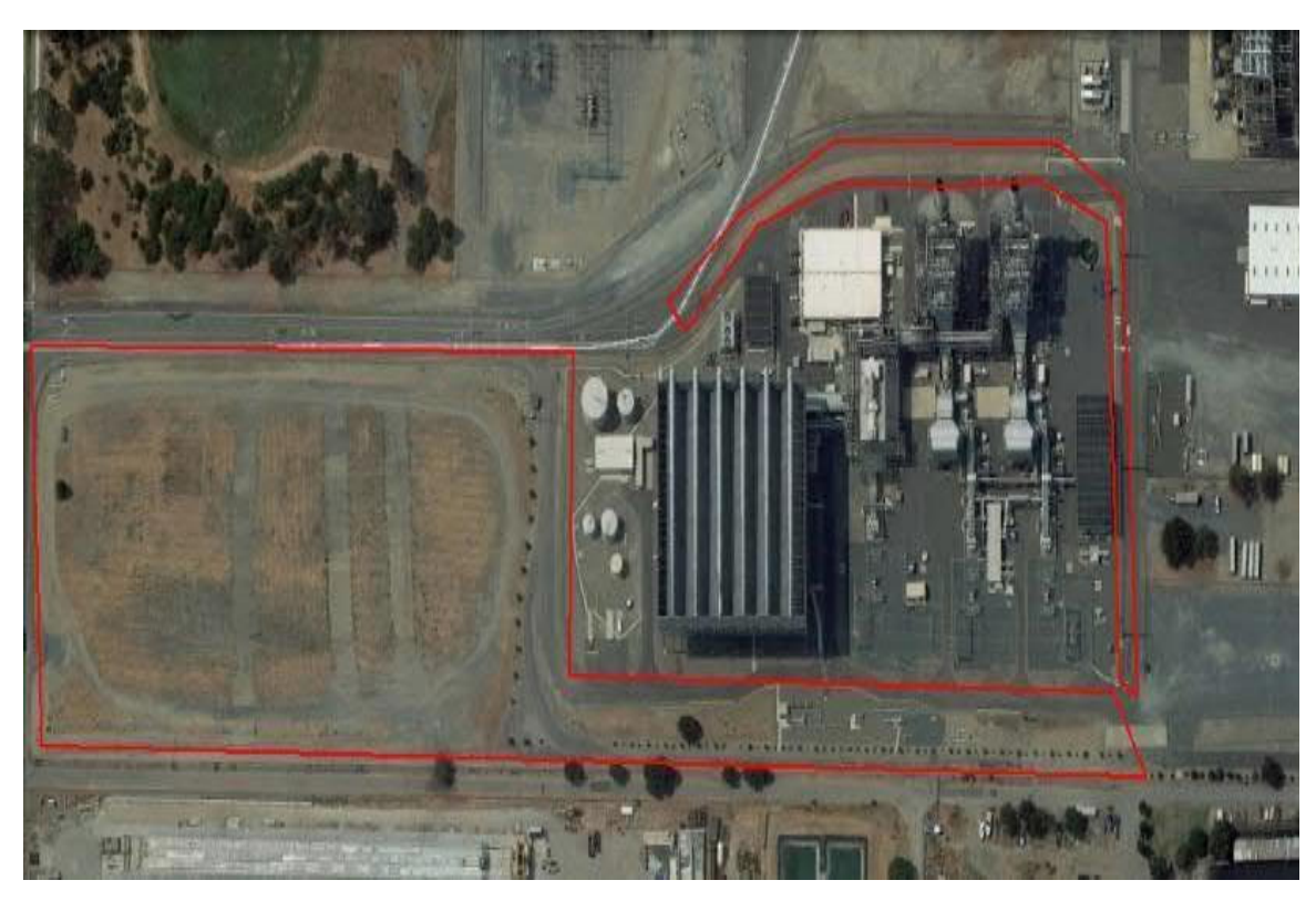
Photo 5, pre-disturbance mowing map of GGS site, areas in red were surveyed, 5-15-20.