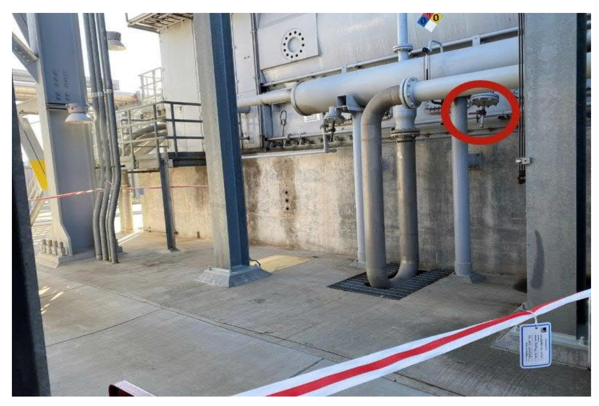
Photo 3, Anna's hummingbird nest with protective buffer in place, 2-26-20.