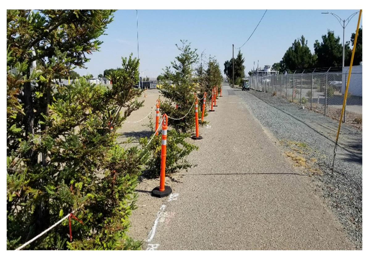
Photo 9, trees and shrubs scheduled for removal, photo facing north. 8-10-20.