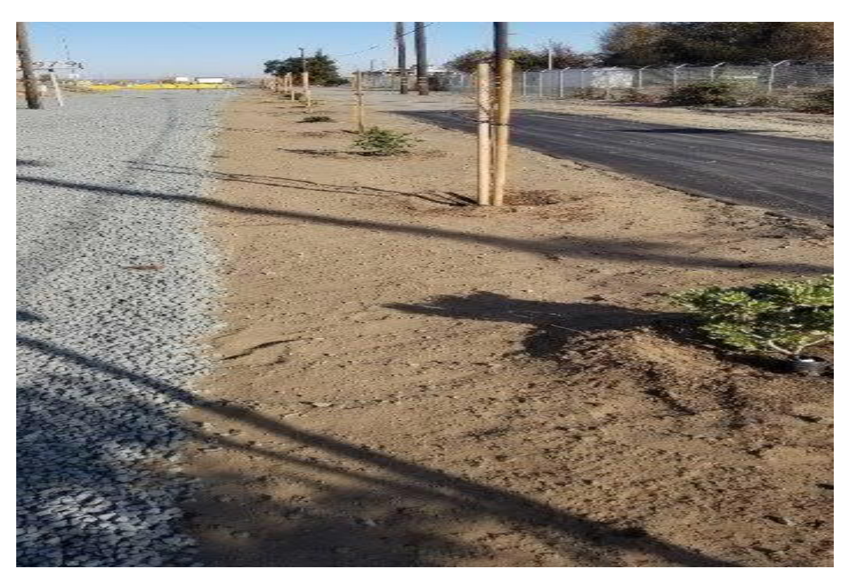
Photo 11, trees and shrubs after replanting/replacement, photo facing south. 12-10-20.