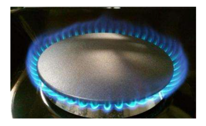
It's easy to adjust the temperature of gas cooktops. Knobs adjust the "size of the blue flame" and hence the amount of heat needed.

There are a number of reasons gas-fueled home cooking is preferred over induction cooktops.