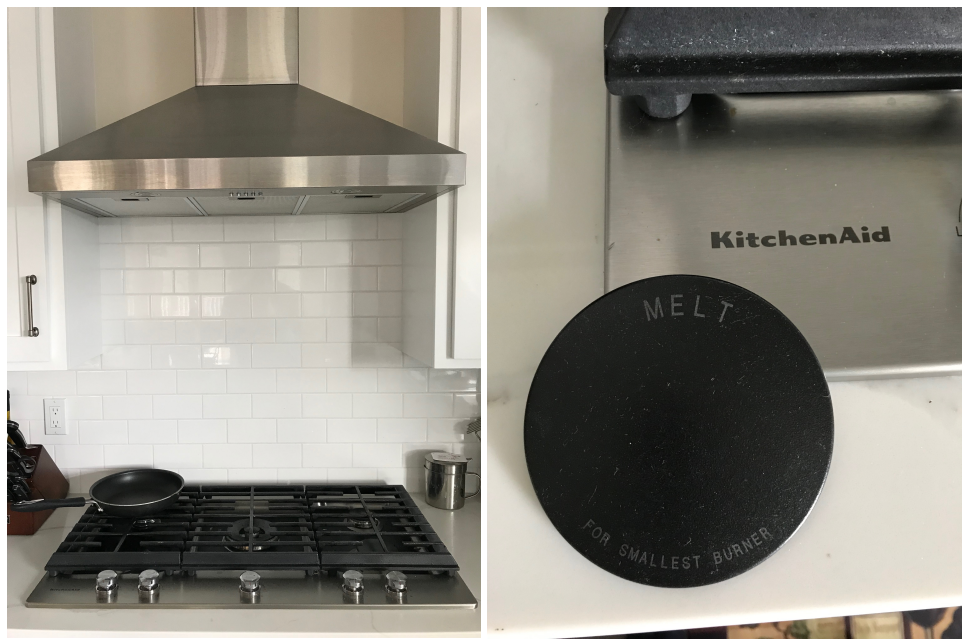
I love to cook with my gas cooktop. The exhaust hood filters and removes any harmful particulates. Gas cooking supports heat diffusion elements such as the "Melt" which allows for a consistent and even melts for fondues or chocolate sauces.

One of many questions remain, "Why are restaurants and other establishments exempt from the natural gas ban when they're food preparation areas run for hours at a time, while residential homeowners use gas cooktops for less than an hour each day?" Many new homeowners who've been victimized by actual or proposed natural gas bans, feel targeted. It won't be long before the government tries to enforce a wider natural gas ban and compels pre-2020 homeowners to spend up to $100,000 to retrofit their homes for all-electric.