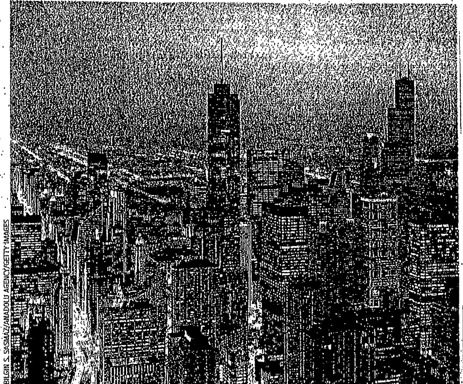
The project would help supply energy to Chicago, as well as to states like Ohio and Pennsylvania,

Investors have tried to build more than a half-dozen Please turn to page B4