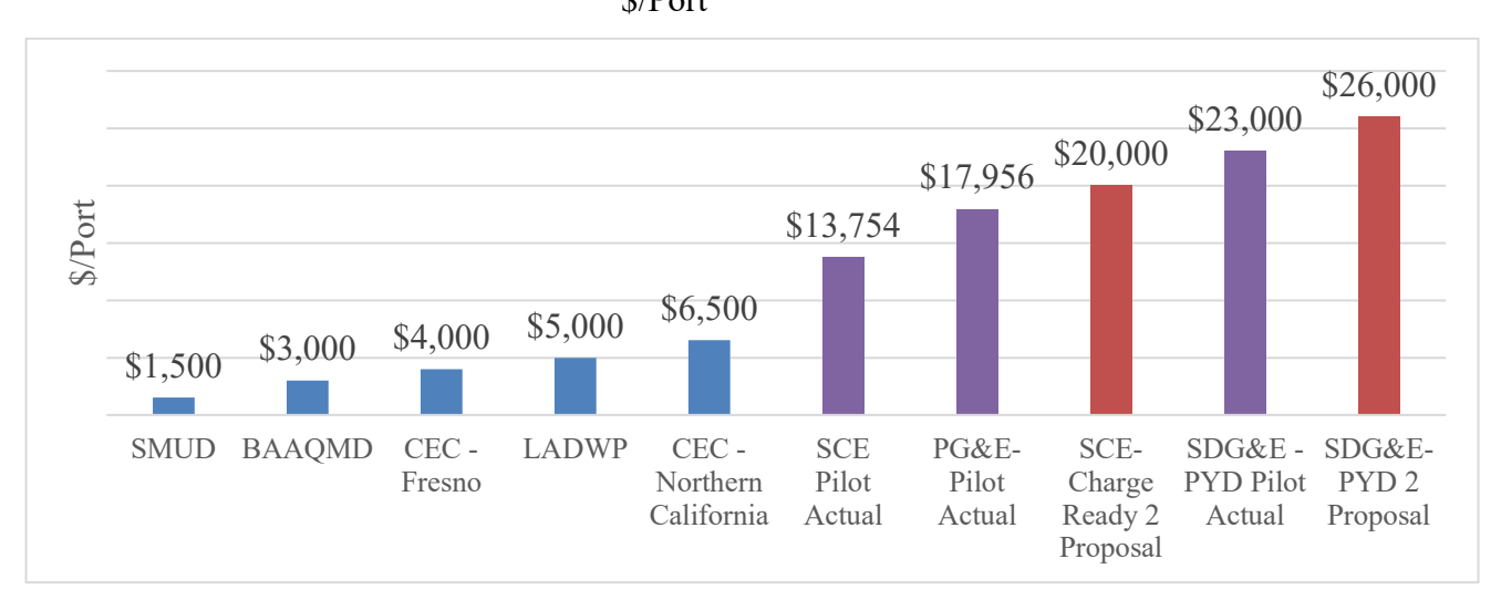
Figure 1. Utility Proposed and Pilot Costs vs. Other State and Utility Programs $/Port^2

Utilization from SDG&E's pilot light-duty charging infrastructure program is shown below for all sites, which consisted of workplaces and multi-unit dwellings. 32 sites had no utilization.