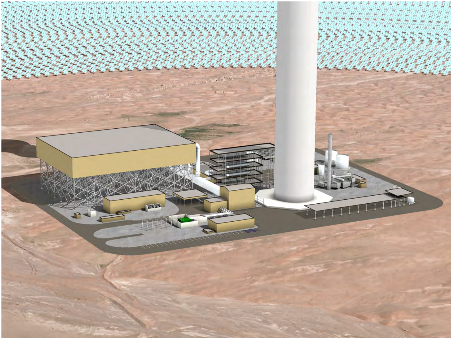
TYPICAL VIEW OF POWER BLOCK FROM THE NORTHWEST FACING SOUTHEAST RIO MESA SOLAR ELECTRIC GENERATING FACILITY