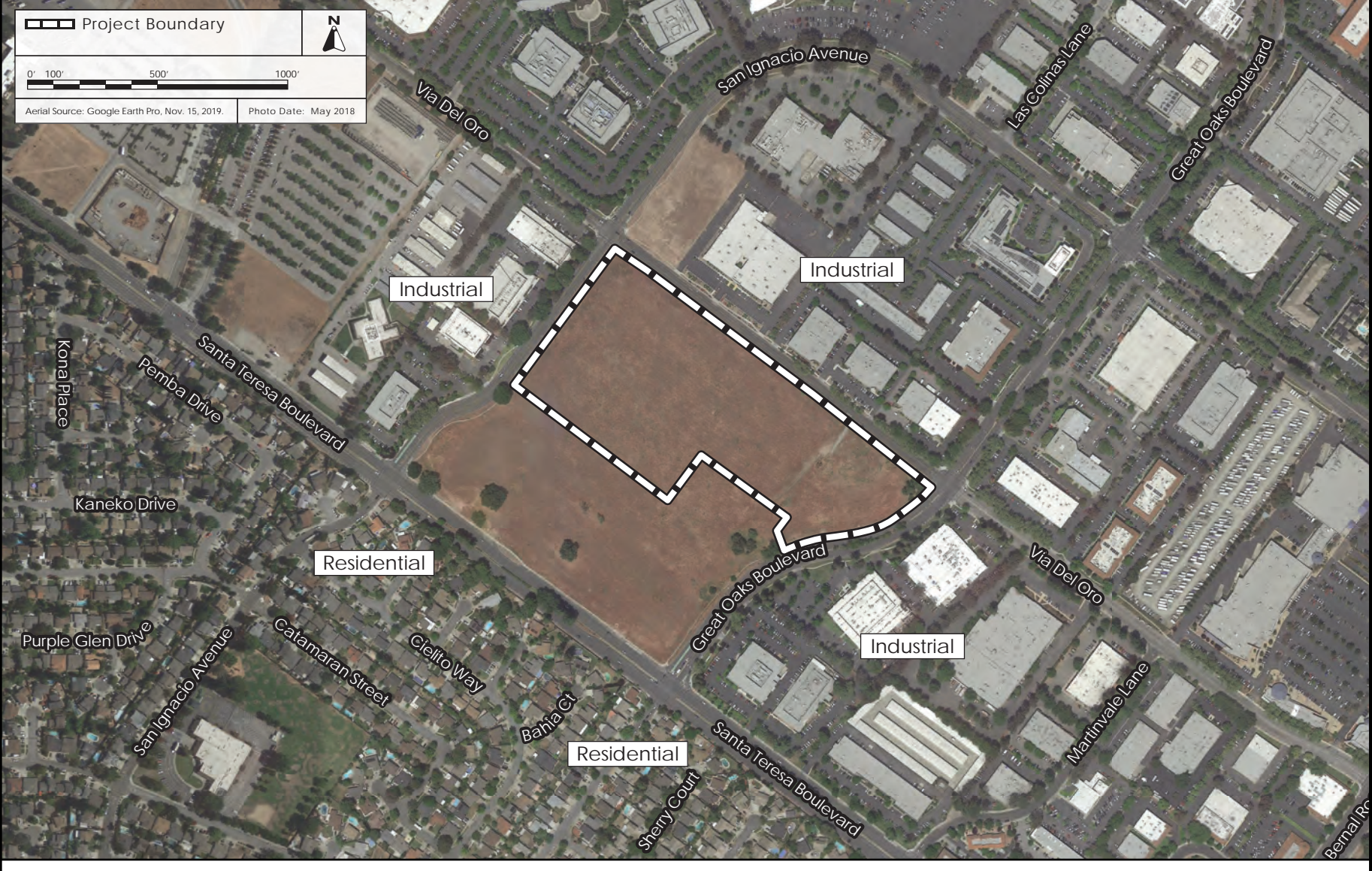
Figure 1.1-3 Aerial Photograph and Surrounding Land Uses