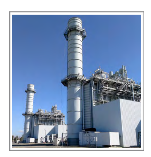
IEEC Units 1 and 2

Units 1 and 2 generated electricity through the use of GE MS7001(H) two-gas combustion turbines and one steam turbine configuration. Each combustion turbine is equipped with dry, low oxides of nitrogen (NOx) combustors, a heat recovery steam generator (HRSG), condenser, and a deaerating surface condenser. Each HRSG unit has a single 195-foot exhaust stack.