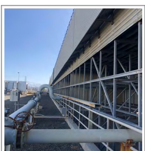
Cooling Tower Area

The cooling tower area includes the 16-bay cooling tower and basin, acoustic wall and foundation, fuel gas preconditioning skid, non-reclaim wastewater storage tank, ammonia storage tank and feed pump skid, cooling tower PDC, circulating water pumps, shutdown circulating water pump, cooling tower chemical feed area, oil/water separator, acid storage tanks and feed pump skid, and wastewater sump with pumps.