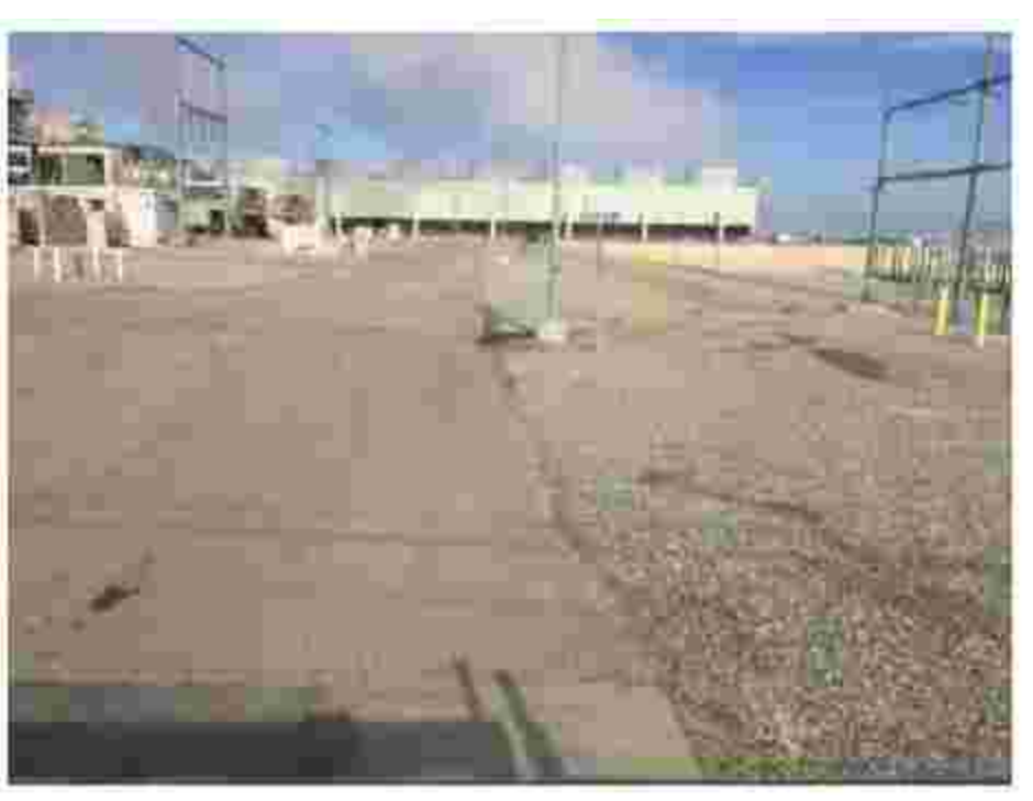
Figure 2: Plant site has been asphalted and graveled. No suitable undeveloped habitat is available on site.