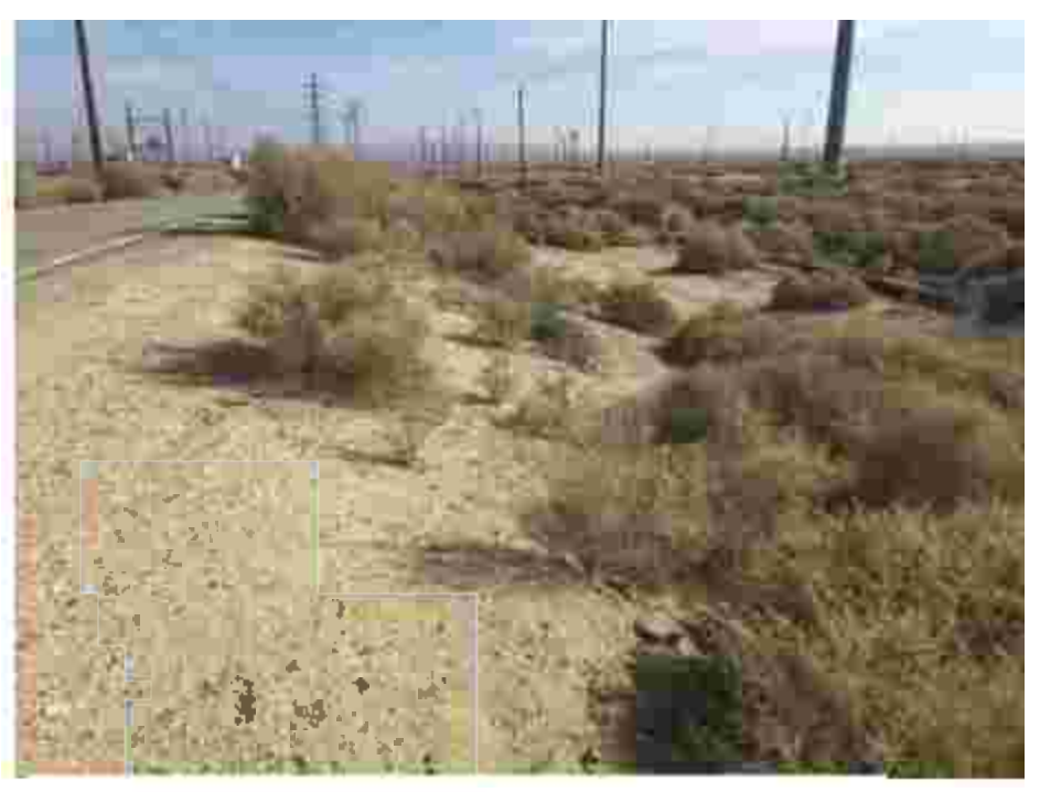
Figure 5: Vegetation community surrounding the outside perimeter of the facility is Valley Saltbush Scrub.