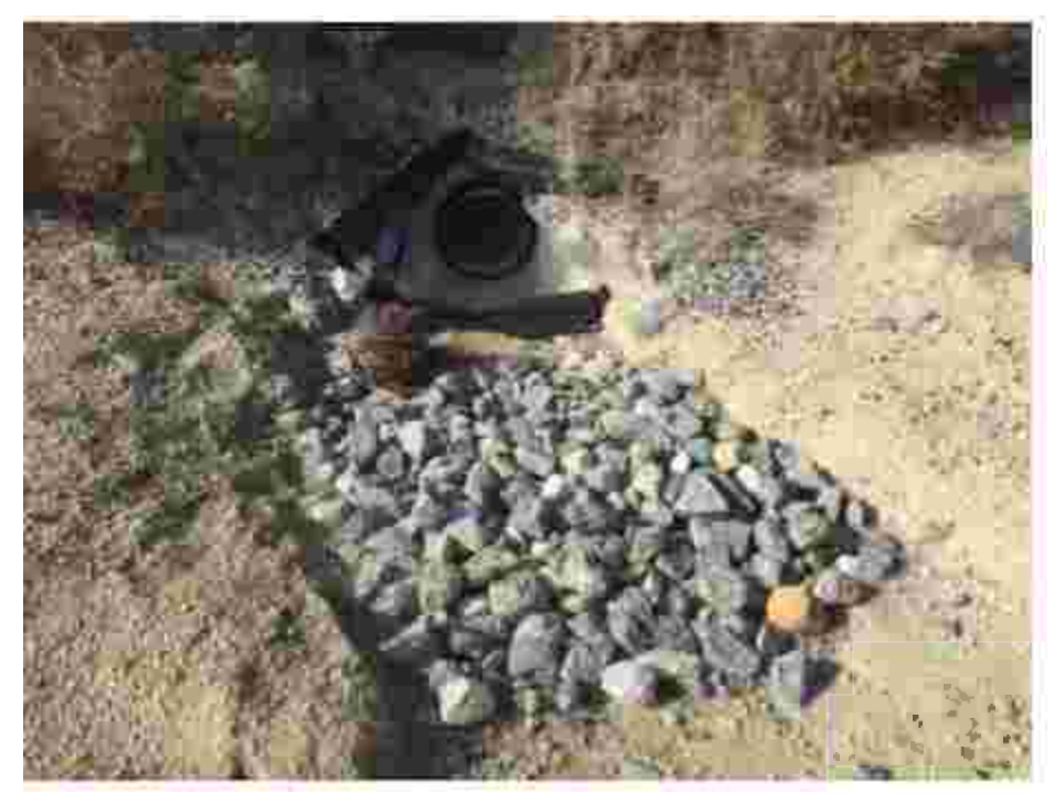
Figure 4: Another preventative measure, metal grates on storm drain culverts.