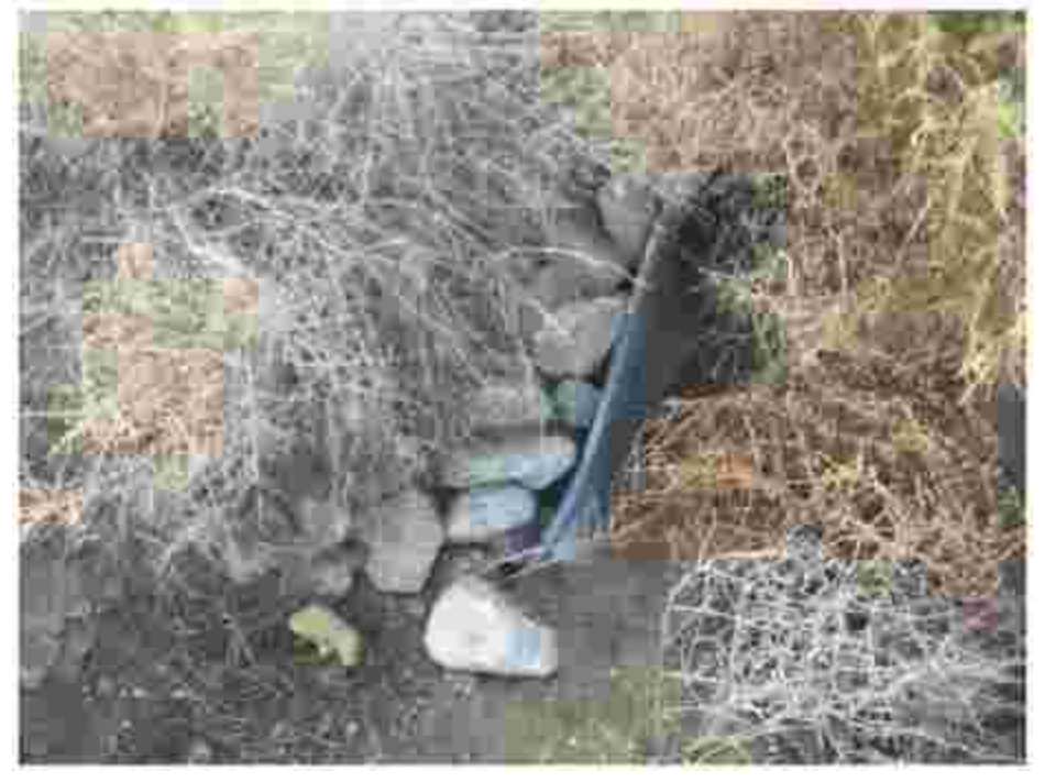
Figure 3: Rock exclusionary measures in storm drain culvert.