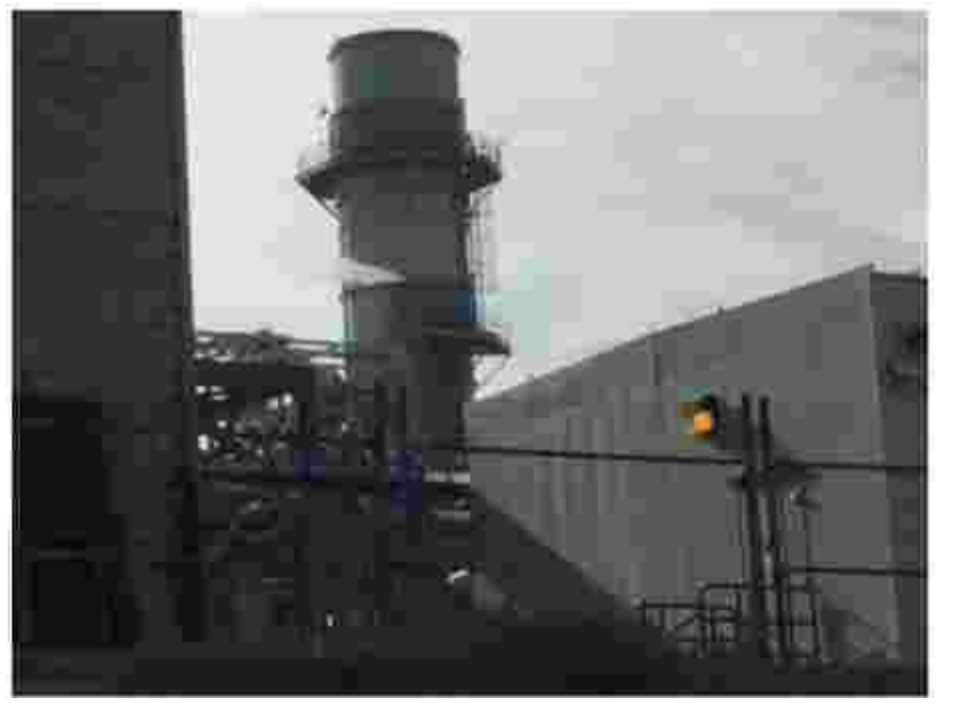
Figure 6: Facility was surveyed for nesting birds utilizing the plant. None were observed at the time of the survey.