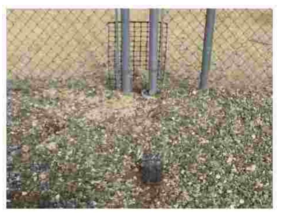
Figure 1: A typical example of a wildlife pass through. Plastic exclusionary mesh was chewed through.