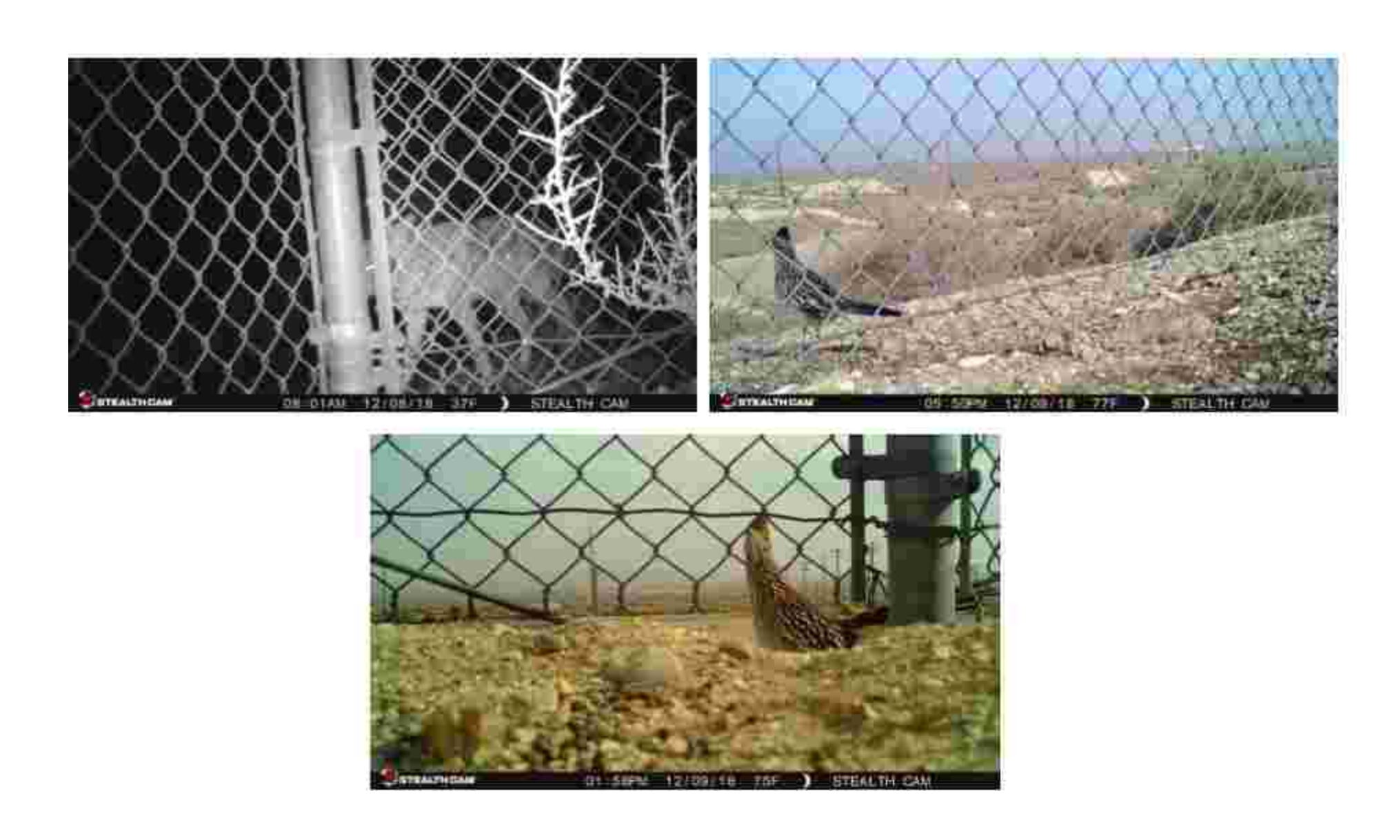
Attachment 2. Wildlife observed from remote sensing cameras.