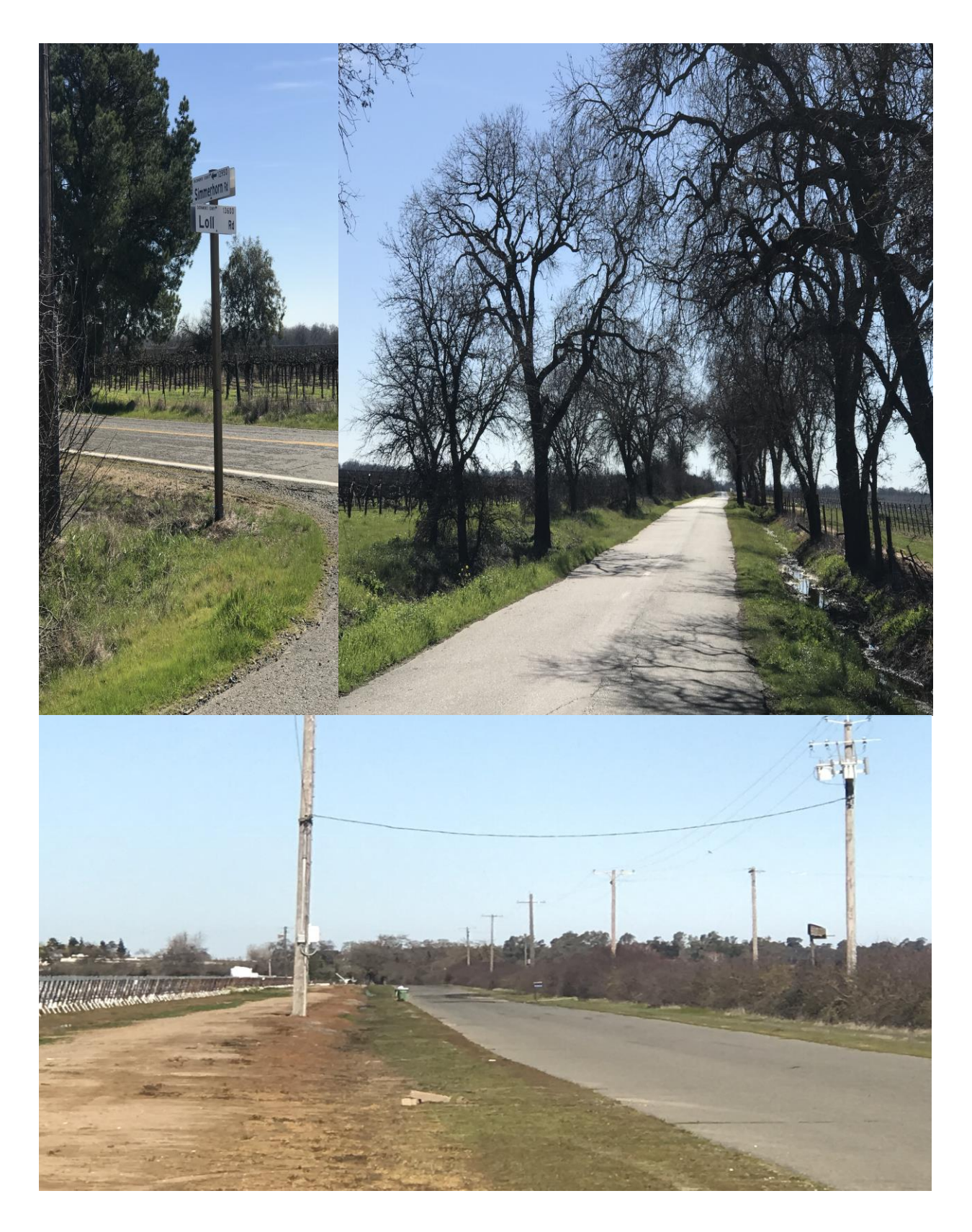
Page 10 of 42