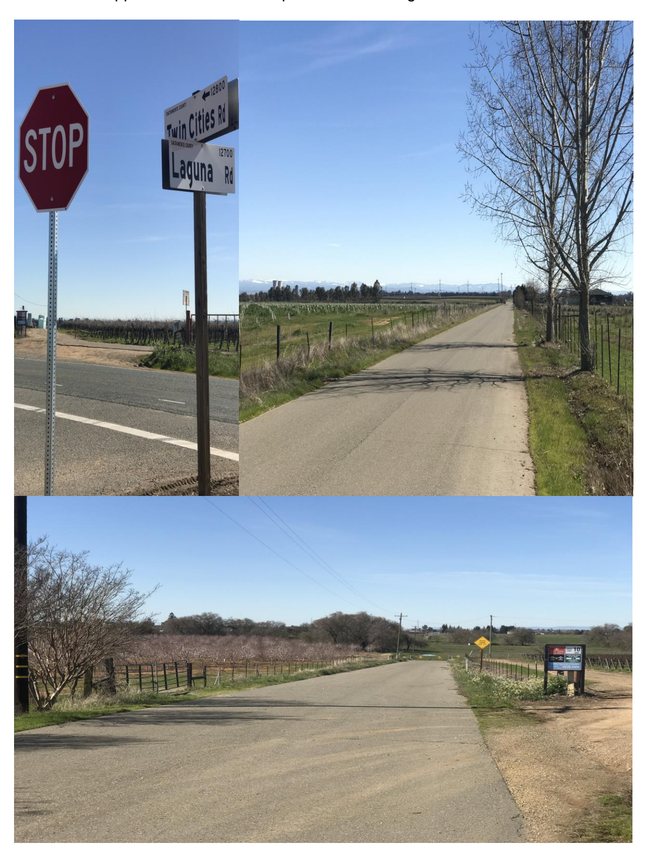
Page 9 of 42