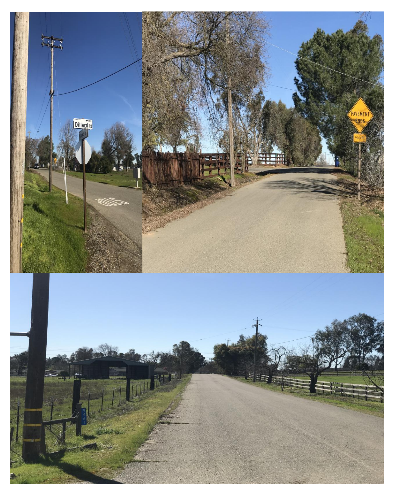
Page 11 of 42