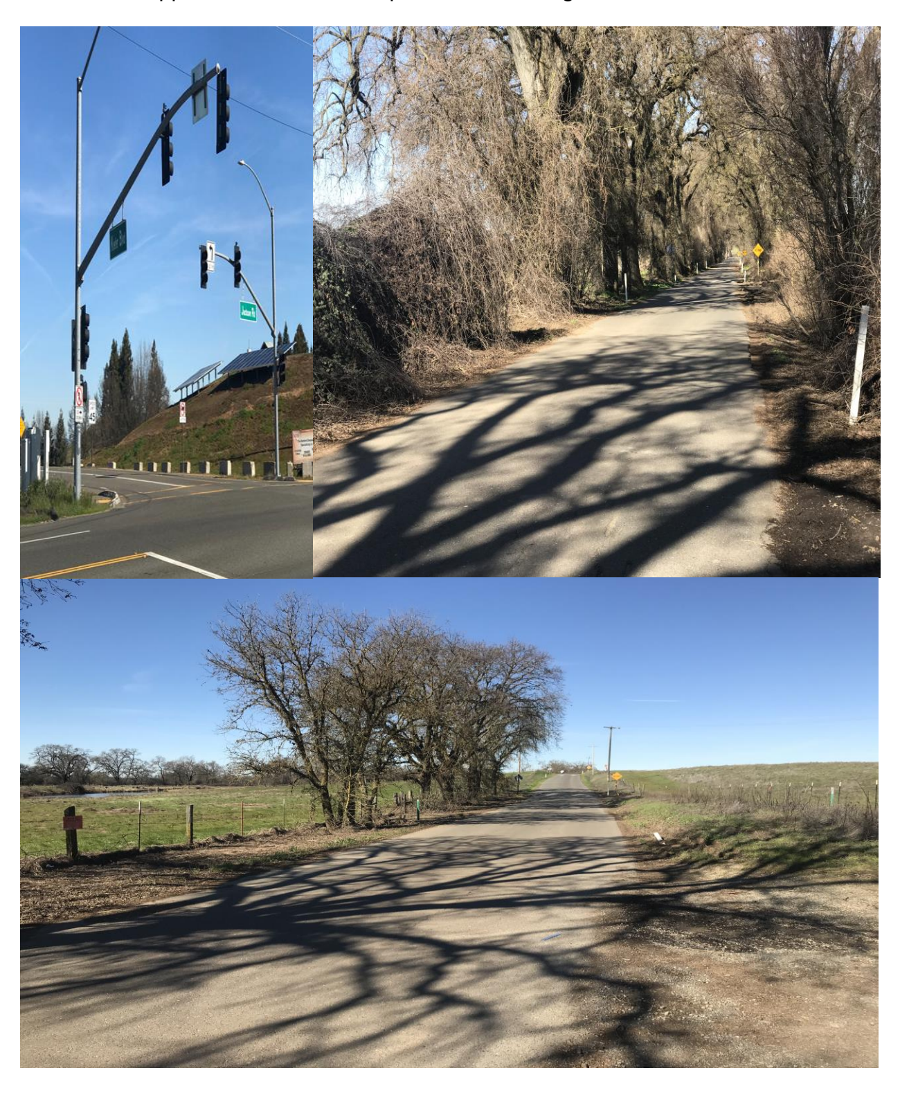
Page 8 of 42