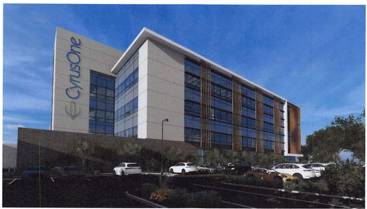
PERSPECTIVE - FROM EAST