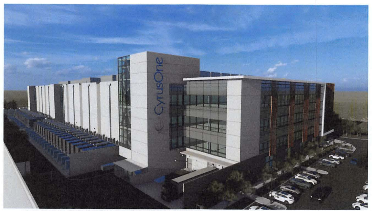
ELEVATED PERSPECTIVE - FROM SOUTH-EAST