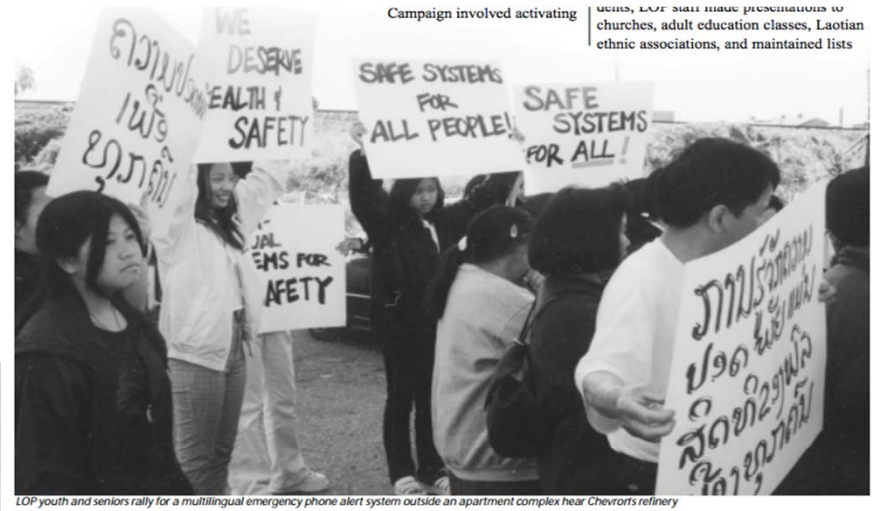
Campaign involved activating tents, LOP staff made presentations to churches, adult education classes, Laotian ethnic associations, and maintained lists