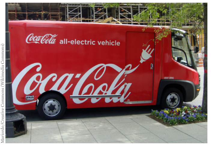
Electric delivery trucks, such as this Coca-Cola delivery truck in Washington, DC, not only have lower greenhouse gas emissions compared with conventional trucks, they also generate no tailpipe pollution—a major benefit to the communities in which these trucks operate.

In developing these recommendations, UCS found that electric utilities are well positioned to advance the deployment of electric trucks and buses and support "smart charging" practices through several types of programs. These include direct investments in the charging infrastructure, rebate incentives that encourage the hosts of charging sites to install infrastructure, and fair rate structures that remove undue barriers to electrification.