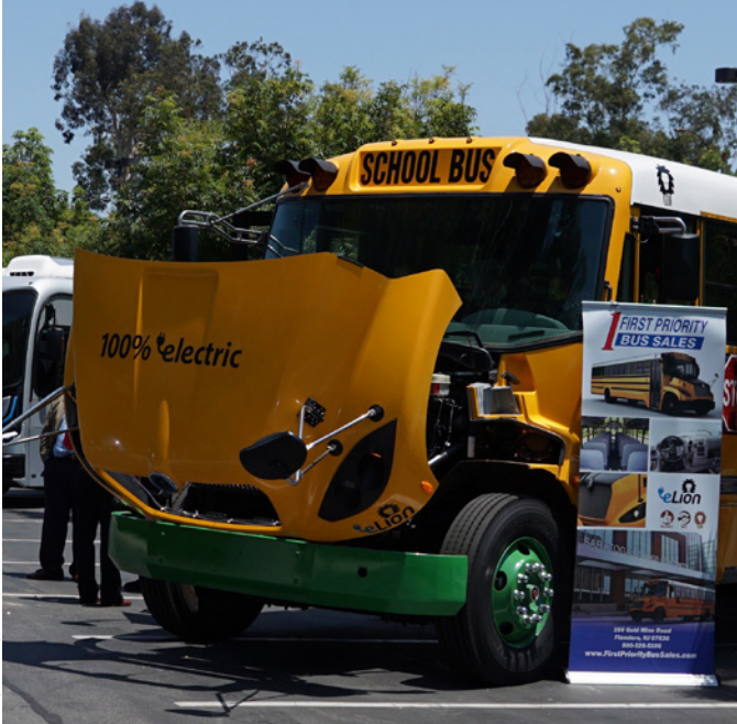
When not in use, electric school buses have the potential to store electricity when renewable energy is at its peak, and then discharge it back to the grid when demand is high.

school bus pilot programs can provide empirical evidence on the effects of charging and discharging cycles on the degradation of battery capacity. Further, electric school buses reduce the exposure of children to pollution, thus serving a demographic particularly vulnerable to suffering health impacts from air pollution. Finally, electric school bus programs can familiarize children, parents, and school employees with EV technology in general. PG&E and Consolidated Edison are among the utilities studying the potential for grid services from electric school buses through pilot programs. As more electric models become available, utilities should consider opportunities to advance electrification and assess the potential grid benefits of additional vehicle applications, such as regional and long-haul trucking.