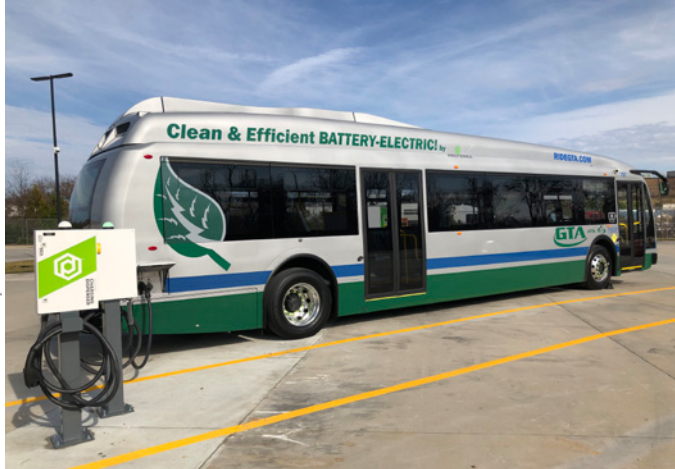
Greensboro, NC, is just one of many US cities committed to increasing the number of electric buses in its fleet. By partnering with fleet operators, utilities can help bring more electric trucks and buses onto our roads.

To manage charging most efficiently and effectively, truck and bus managers need chargers that communicate with network management systems. Beyond the immediate benefits, capabilities for smart charging and networking are forms of "future-proofing." They allow for later upgrades to provide more sophisticated grid services, such as vehicle-to-grid power supply, as those capabilities become available for some vehicle applications. For these reasons, utilities should include minimum capabilities for the charging system that enable managed charging as a requirement of truck and bus charging programs.