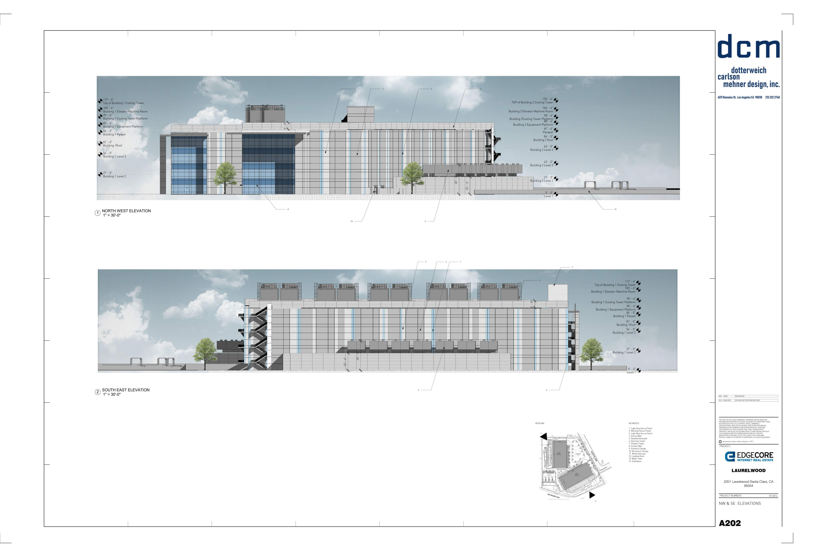
Figure 2-3aR Elevation Drawings Laurelwood Data Center Santa Clara, California