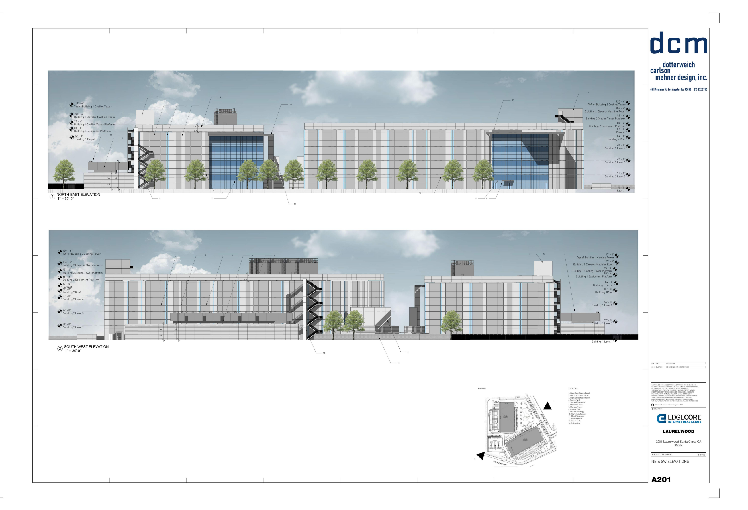
Figure 2-3bR Elevation Drawings Laurelwood Data Center Santa Clara, California