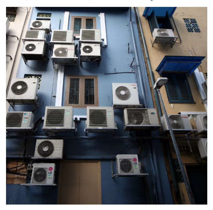
The global stock of room air conditioners is expected to grow from 900 in million in 2015 to 2.5 billion units in 2050. (Clean Energy Ministerial, 2016)