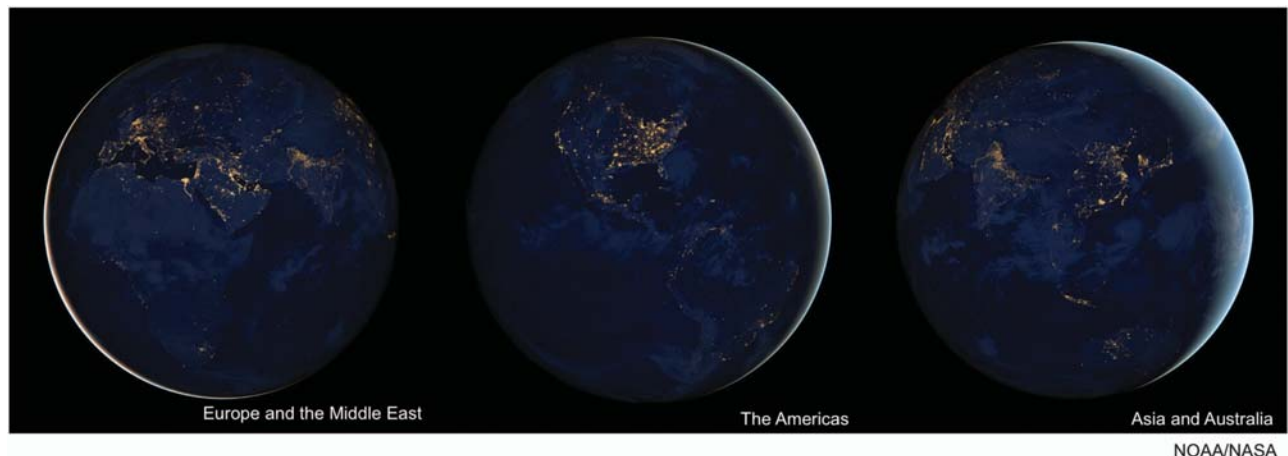
Figure 2. Satellite images of Earth at night. Images acquired by the Suomi National Polar-orbiting Partnership satellite in 2012 demonstrating urban light pollution ( http://earthobservatory.nasa.gov/ ).

Abbreviation: LED, light-emitting diode. a Blux is a weighted measure of light intensity based on circadian-responsive wavelengths.