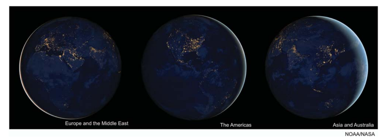
Figure 2. Satellite images of Earth at night. Images acquired by the Suomi National Polar-orbiting Partnership satellite in 2012 demonstrating urban light pollution (http://earthobservatory.nasa.gov/).