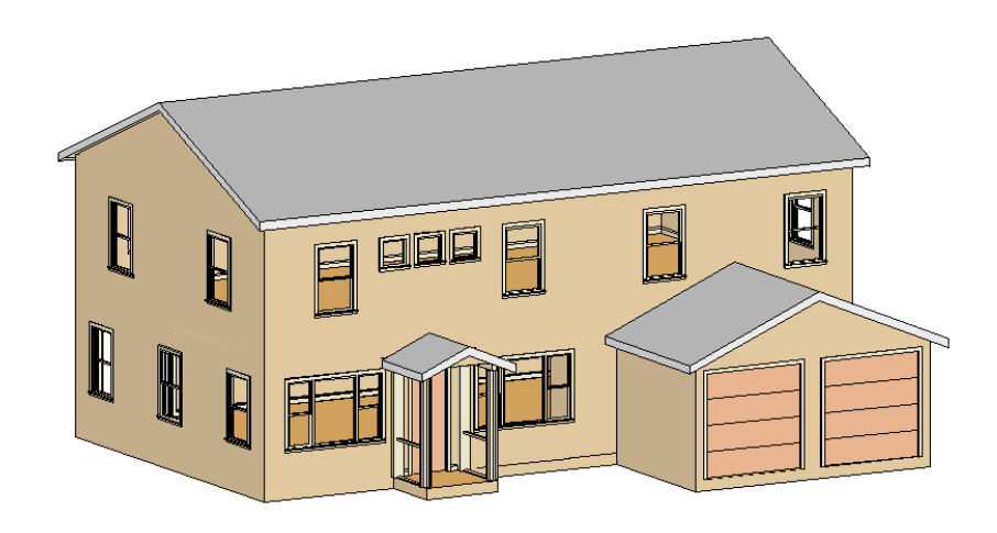
Figure 6: 2,700 ft<sup>2</sup> single family prototype configuration