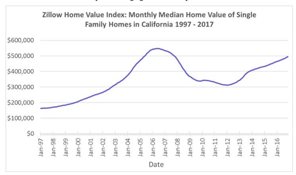
Figure 1: California median home values 1997 to 2017

It is expected that builders would not be impacted significantly by any one proposed code change or the collective effect of all of the proposed changes to Title 24, Part 6. Builders could be impacted for change in demand for new buildings and by construction costs. Demand for new buildings is driven more by factors such as the overall health of the economy and population growth than the cost of construction. The cost of complying with Title 24, Part 6 requirements represents a very small portion of the total building value. Increasing the building cost by a fraction of a percent is not expected to have a significant impact on demand for new buildings or the builders' profits. As shown in Figure 1, California home prices have increased by about $300,000 in the last 20 years. In the six years between the peak of the market bubble in 2006 and the bottom of the crashing in 2012, the median home price dropped by $250,000. The current median price is about $500,000 per single family home. The combination of all single family measures for the 2016 Title 24, Part 6 Standards was around $2,700 (California Energy Commission 2015). This is a cost impact of approximately half of one percent of the home value. The cost impact is negligible as compared to other variables that impact the home value.