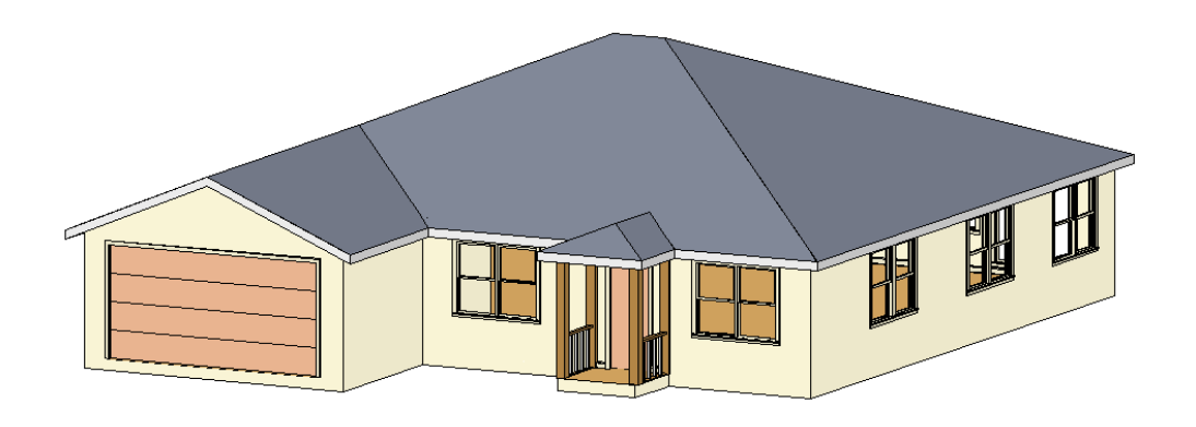
Figure 5: 2,100 ft<sup>2</sup> single family prototype configuration