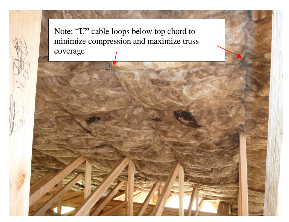
Figure 4: Example R-19 batt below-deck insulation appearance

Although the $0.08 per square foot cost represented the total incremental cost to the builder relative to the R-13 below-deck batt standard case installed in the subdivision, the Statewide CASE Team is