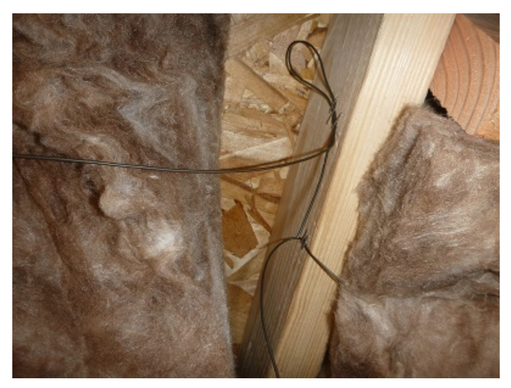
Figure 3: Example batt cabling securement method (note: insulation moved for photo).