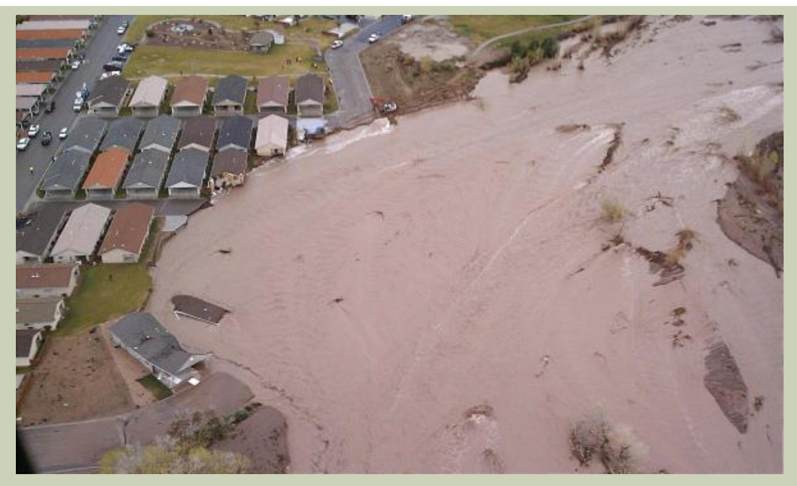
CURRENT DESIGN STANDARDS FAIL