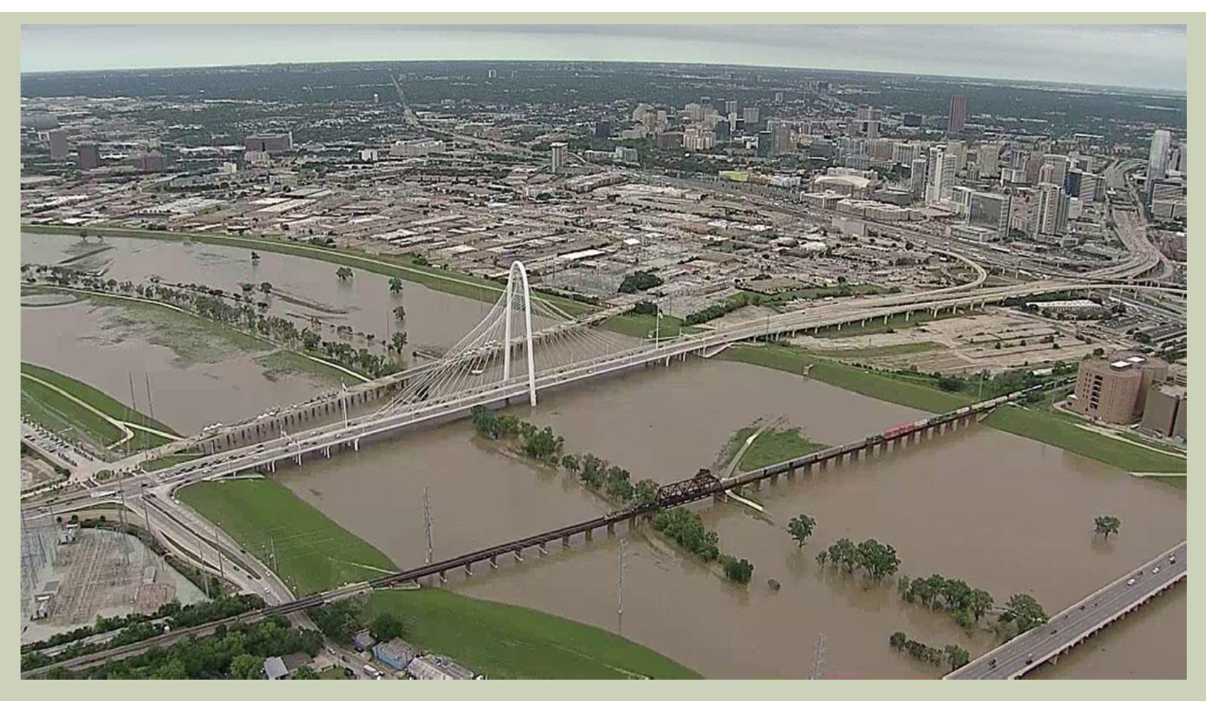
FLOODING IN NEW UNPREDICTED LOCATIONS