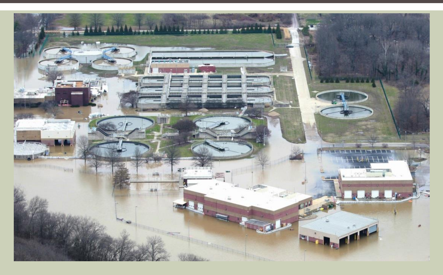
2015 St Louis Sewage Treatment Plant Failure