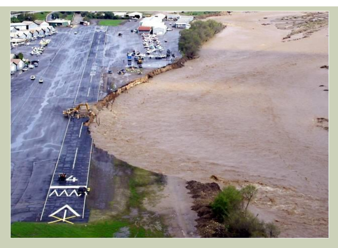
Airport Runway Failure - Built on Fill