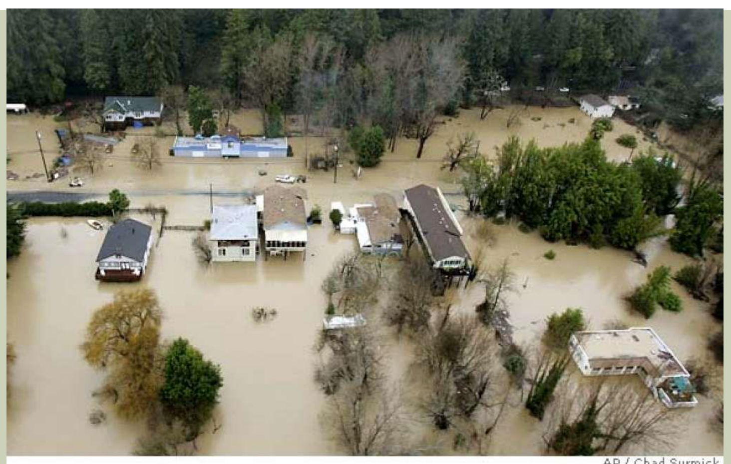
TO BUILD IN THE FLOODPLAIN WILL MEAN REPEATING HISTORY