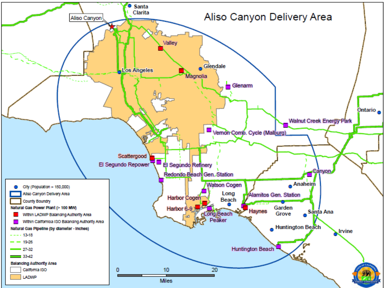
Figure 2: Electric Generation Plants Served by Aliso Canyon