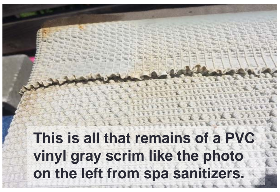
Extremely degraded by ozone, PVC scrim

Inhaling vapors or transdermal exposure are inevitable when EPS foam is mixed with sanitizers chlorine, bromine, hydrogen peroxide or ozone.