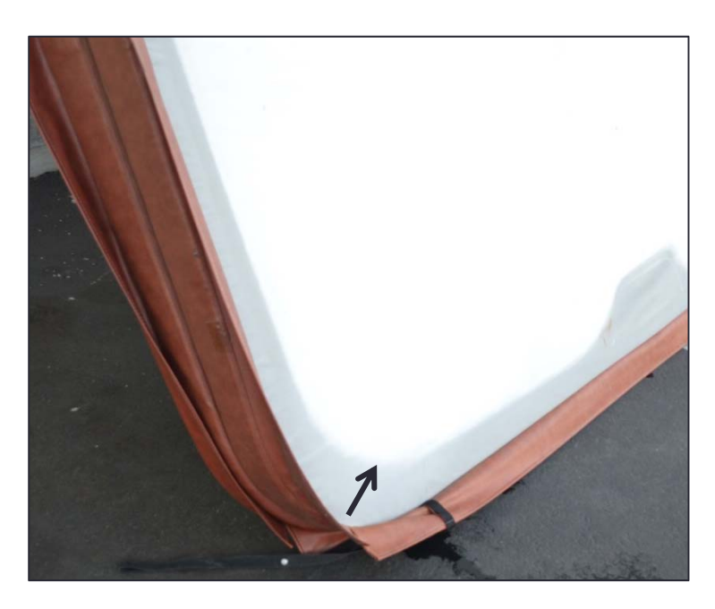
"Witness mark" from early damage from oxidizers to PVC scrim