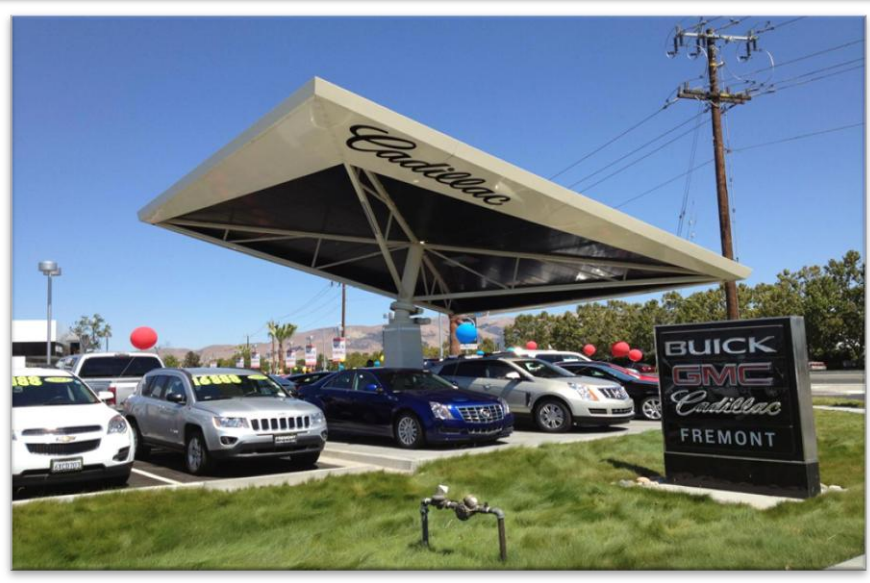
Driving on Sunshine