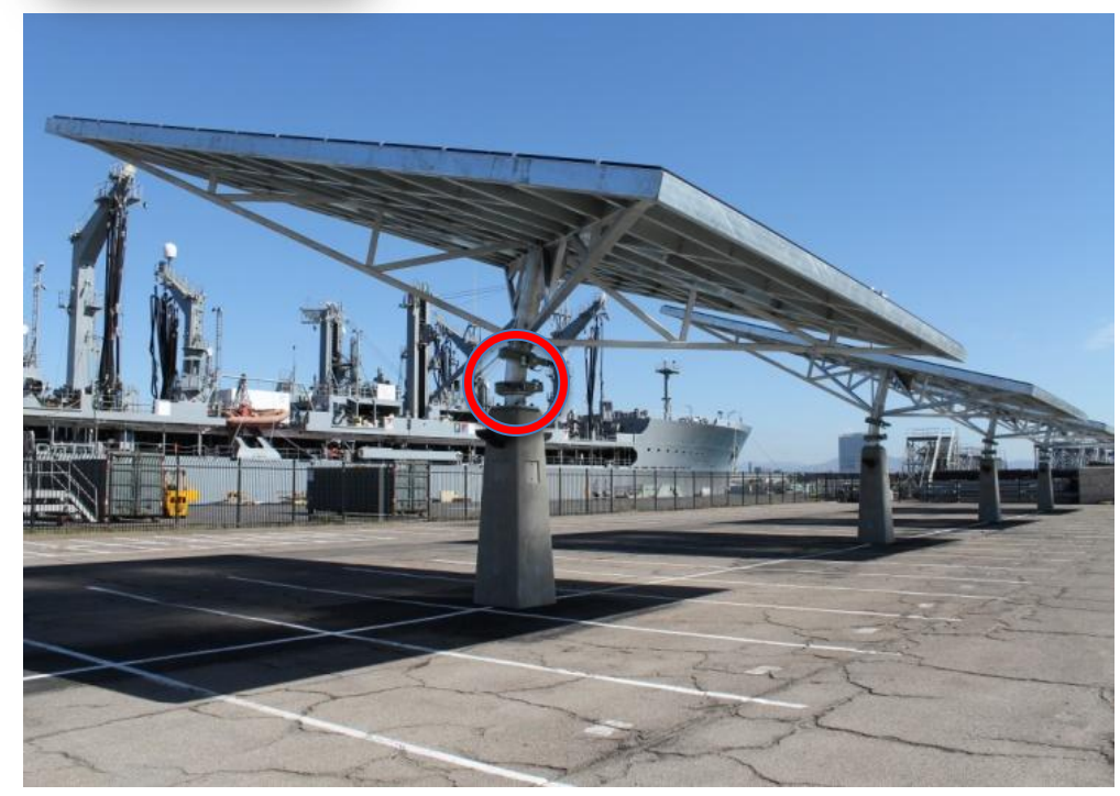
Naval Base Coronado, Berth Lima Coronado, CA