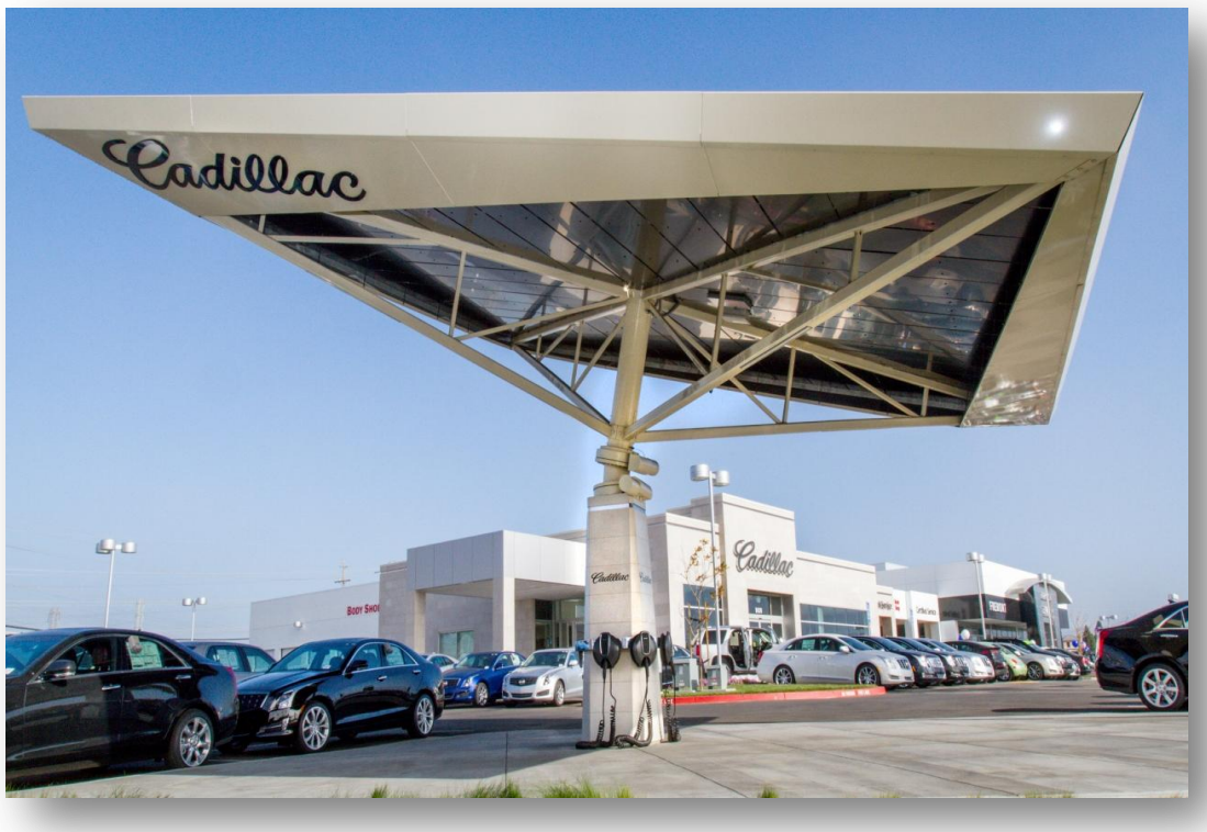
Fremont Cadillac Fremont, CA