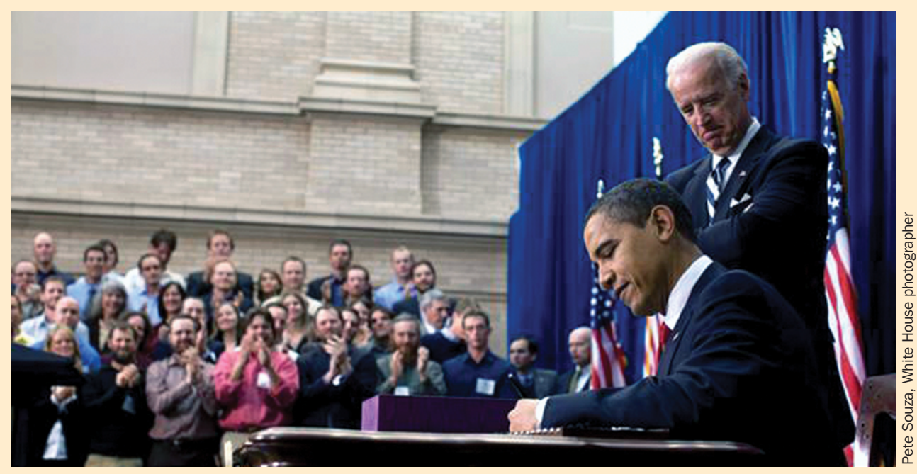
President Obama signs into law the American Recovery and Reinvestment Act of 2009 as Vice President Joe Biden looks on.

With a per-unit cap of $15,000 and an expected average of $10,000, HUD has funding for more than 20,000 units in about 250 properties. In addition to receiving a loan or grant toward the costs of the energy improvements, participating owners receive a pre-development incentive fee of 1% of the estimated costs for the project, capped at $10,000. On completion of the retrofit, owners will receive an additional incentive of 3% of costs, capped at $30,000. Retrofits completed within one year can receive an additional 3% "efficiency incentive," similarly capped, decreasing by 10% of that amount for each additional month required beyond one year. An additional GRP Incentive Performance Fee, payable from operating cash flow,