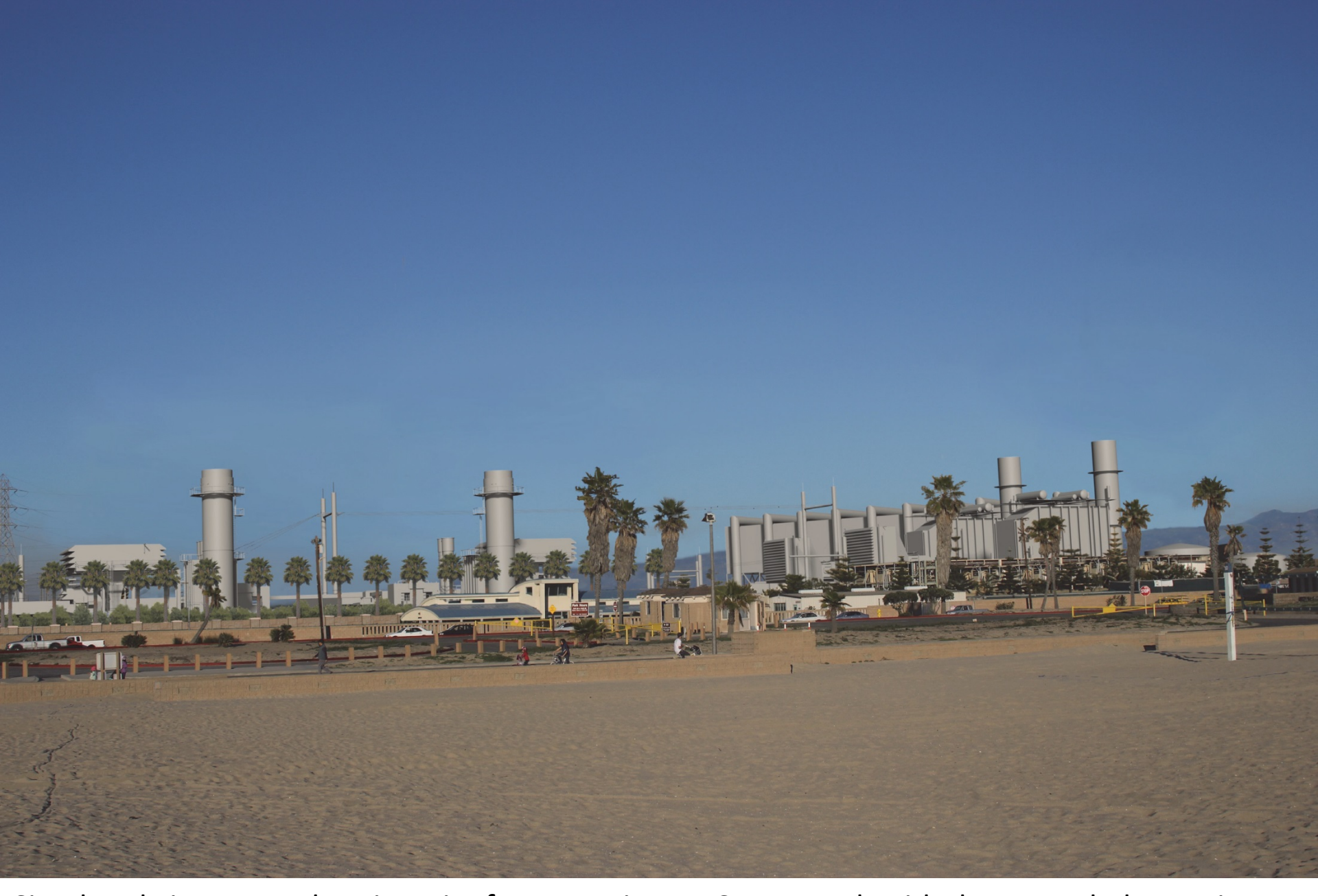
Simulated view toward project site from Huntington State Beach with the Amended HBEP in place.