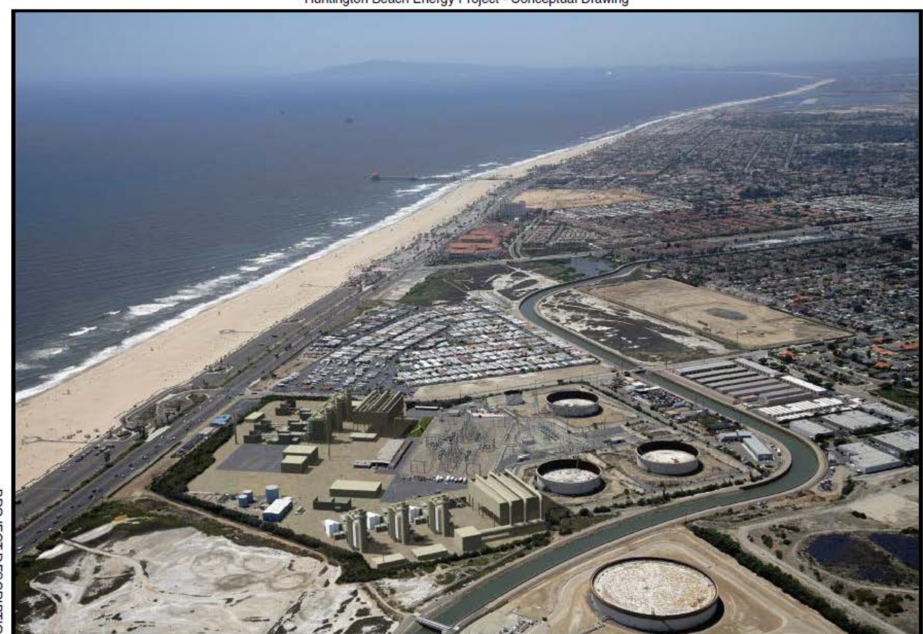
PROJECT DESCRIPTION - FIGURE 1A Huntington Beach Energy Project - Conceptual Drawing