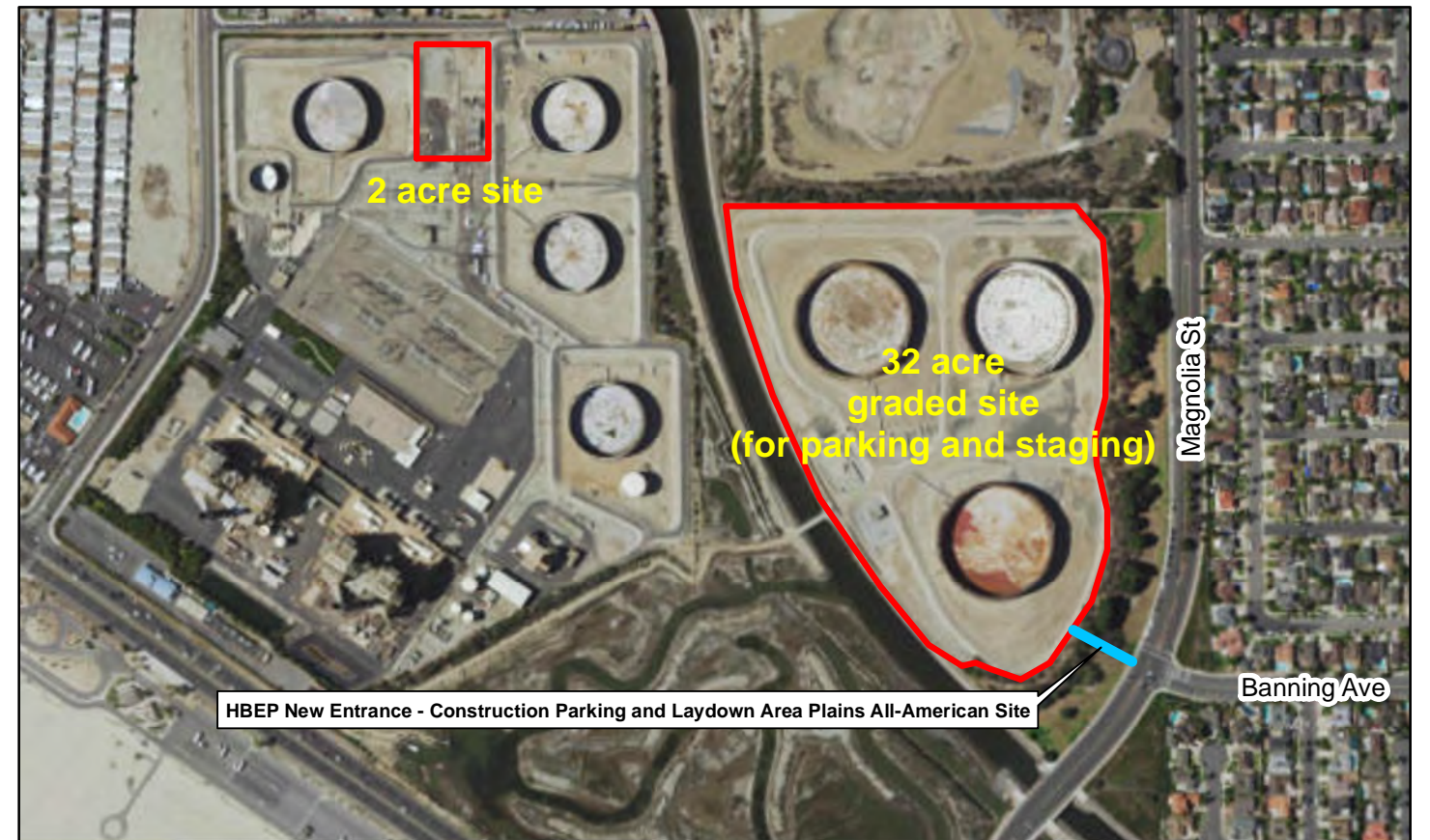
Potential Parking Areas During Construction