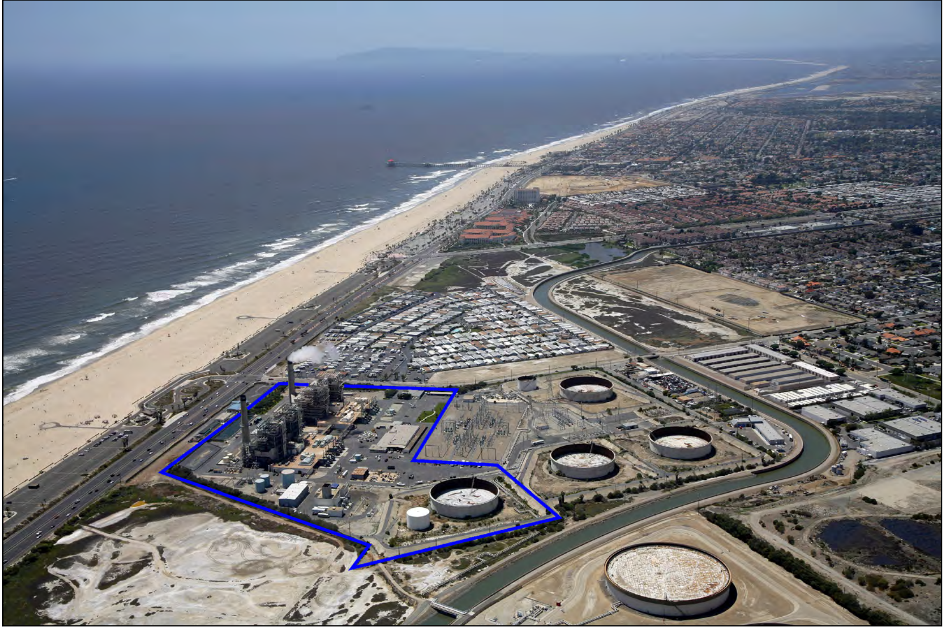
Existing Huntington Beach Generating Station Area available for development of power generation is outlined in blue.