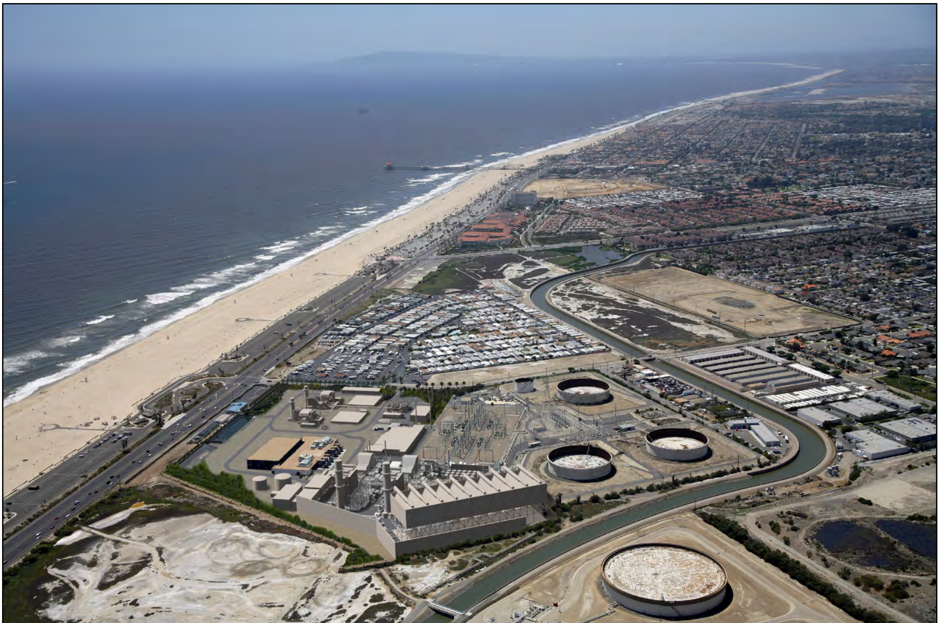
Huntington Beach Energy Project