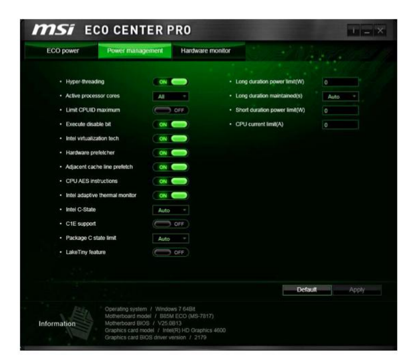
Figure 4 Power Management tab

Figure 4 shows the Power Management tab of the ECO Center Pro utility. We estimate the engineering effort to develop the underlying functionality to 8 man-weeks of a power software engineer if all required functionality is covered in provided documentation and 8-16 man-weeks if the information has to be extracted from distributed sources. The estimated effort for the GUI functionality is 1 week (for standard QT-style GUI) and 1-3 weeks for graphic design.