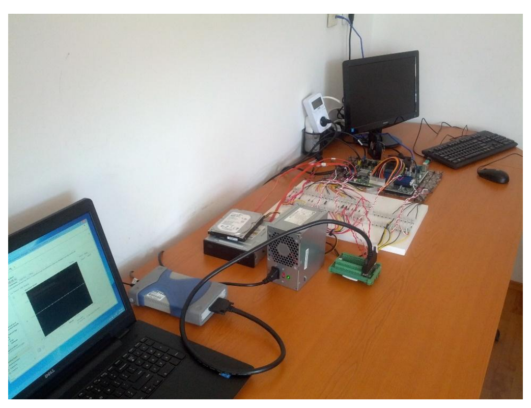
Figure 2. Complete setup for desktop power measurement

For measuring all the power supply rails used (motherboard, CPU, HDD and DVD) we would need a DAQ device with 18 channels. Since the available DAQ did not have that many channels, we assumed that the multiple power rails of the same voltage levels are used just for decreasing the overall currents, so the measurements were performed in a manner that the same voltage level rails were measured in the same group. This was achieved using all of the available DAQ channels at the sampling frequency of 1 kHz for each channel. The raw voltage measurements for each channel were converted to power data and then written to a file by the measurement software. We ran the acquisition for 5 minutes on each channel and calculated the average power consumption on each rail. The total DC power was calculated as the sum of the average rail power.