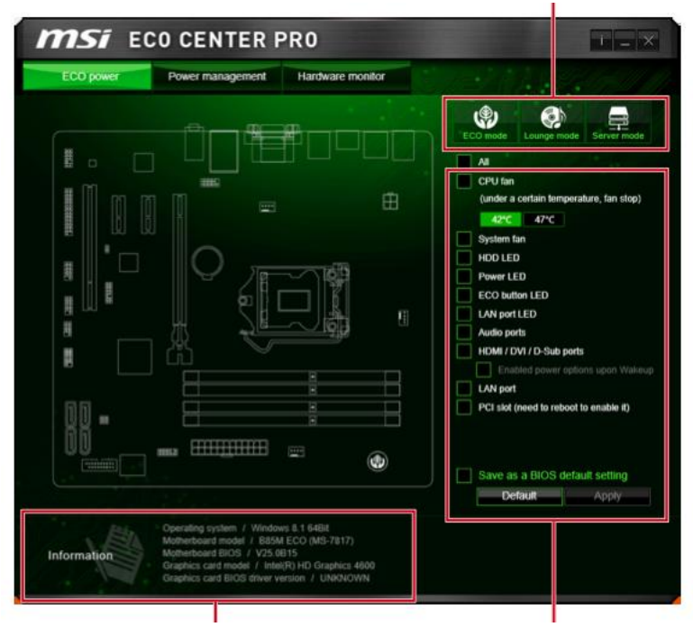
Figure 3 ECO power screen of ECO Center Pro

The MSI Board is shipped with the power configuration and monitoring utility ECO Center Pro. In the project this utility was used to conduct most of the experiments leading to better idle power. The researchers see such utilities as essential for tuning the power beyond the power option utilities integrated in the OS and therefore have conducted an analysis of the necessary engineering manpower for the design, implementation and distribution of such specialized utilities by the motherboard manufacturers.