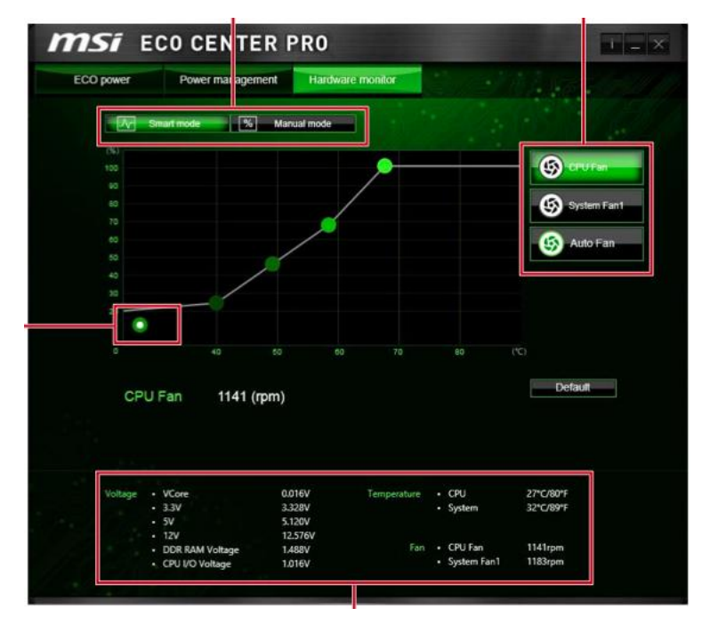
Figure 5 Hardware Monitor tab

provided all features are documented and 8-12 man-weeks otherwise. For the GUI development we estimate 3-4 man-weeks (for standard QT-style GUI) and 2-3 man-weeks for the GUI graphic design.