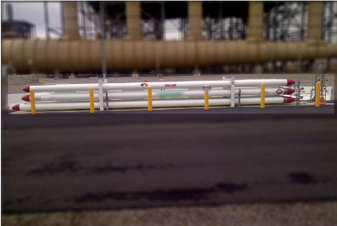
Photo of a typical tube bank installation from another facility.