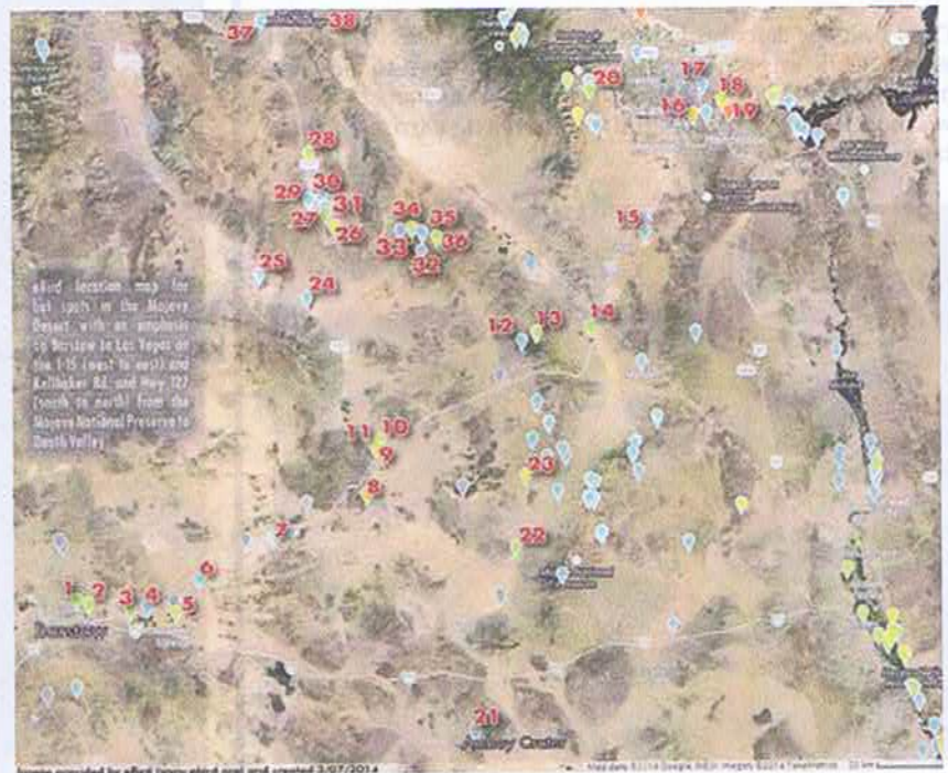
Figure 1: Desert Hotspots

A real-time, online checklist program, eBird has revolutionized the way that the birding community reports and accesses information about birds. eBird provides rich data sources for basic information on bird abundance and distribution at a variety of spatial and temporal scales. By maximizing the utility and accessibility of bird observations made each year by recreational and professional bird watchers, eBird is amassing one of the largest and fastest growing biodiversity data resources in existence. The observations of each participant join those of others in an international network of eBird users. eBird then shares these observations with a global community of educators, land managers, ornithologists, and