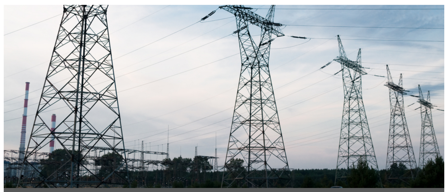
The cost of transmitting energy long distances is exorbitantly expensive. Up to $80 billion will be spent on transmission infrastructure in the U.S. between 2011 and 2015, with the entire cost paid by energy consumers through electricity rates.

decisions have focused solely on the contract price of energy at the point of interconnection to the grid. This misleading "sticker price" approach fails to account for factors that significantly impact electricity rates. For example, a comprehensive approach shows that avoiding long-distance transmission results in tremendous savings. Edison Electric Institute found that its members invested over $11 billion in electric transmission infrastructure in 2011 alone. Furthermore, the Galvin Electricity Institute estimates that the annual cost of power outages is more than double the cost of preventative intelligent grid investments.