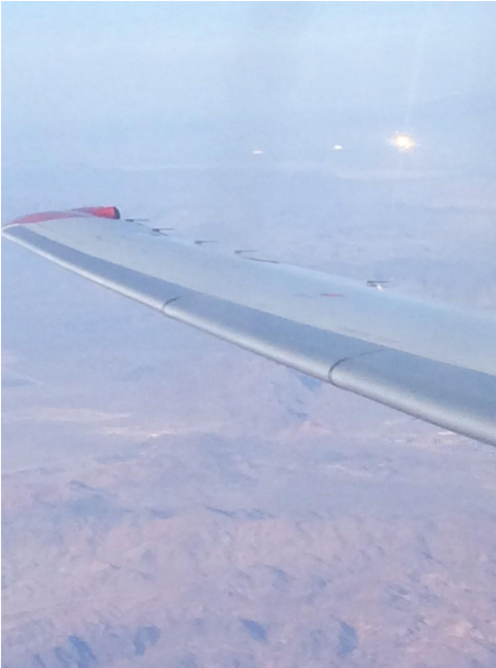
View of the flash from the Ivanpah Solar Electric Generating System heliostats from 20,000 feet. Taken with a digital iPhone camera.