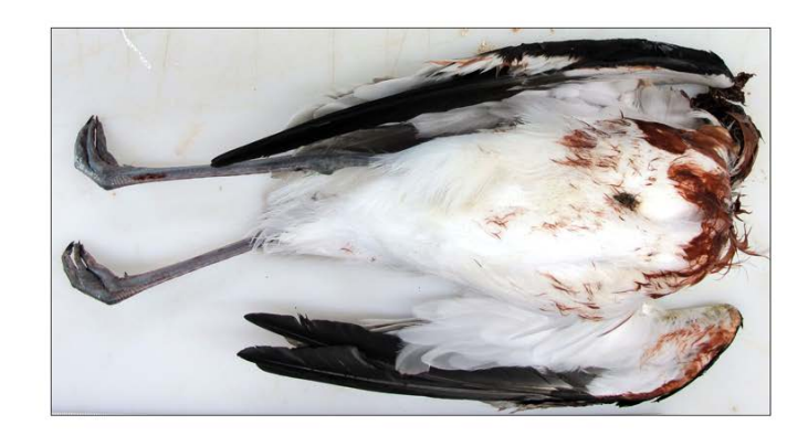
Figure 2: Predation trauma (top) resulting in traumatic amputation of the head and neck (American Avocet) and impact trauma (bottom) causing bruising of the keel ridge of the sternum (Brown Pelican).

Predation was the immediate cause of death for 15 birds. Lesions supporting the finding of predation included decapitation or missing parts of the body with associated hemorrhage (9/15), and lacerations of the skin and pectoral muscles. Eight of the predated birds from Desert Sunlight were