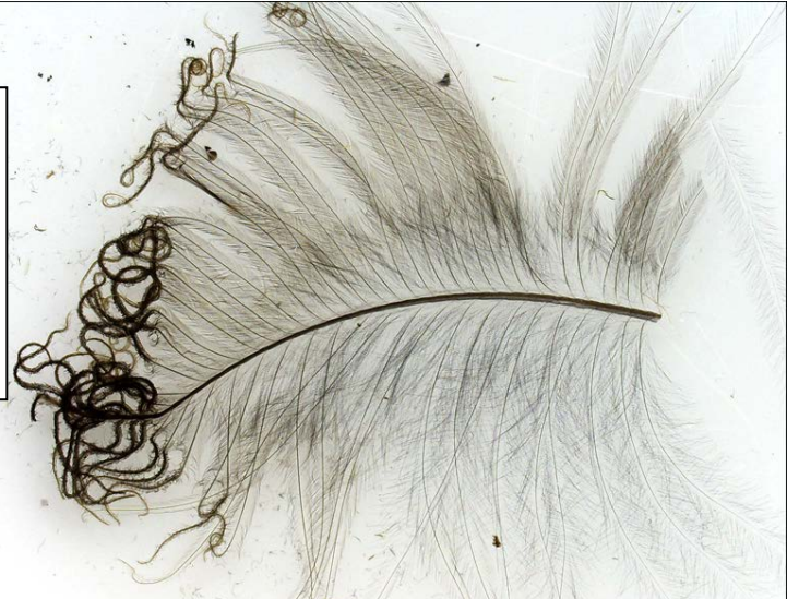
Figure 3: contour feather from the back of a House Finch with Grade 3 solar flux injury. The feather has curling and charring limited to the exposed tip.

Solar flux injury was identified as the cause of death in 47/141 birds. Solar flux burns manifested as feather curling, charring, melting and/or breakage and loss. Flight feathers of the tail and/or wings were invariably affected. Burns also tended to occur in one or more of the following areas; the sides of the body (axillae to pelvis), the dorsal coverts, the tops and/sides of the head and neck and the dorsal body wall (the back). Overlapping portions of feathers and light-colored feathers were often spared (Figures 3 and 4).