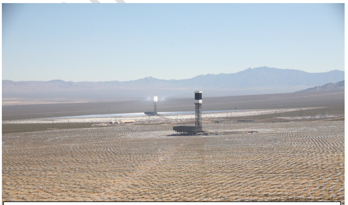
Figure 9: Tower 1 (bright white) is shown under power. Tower 2 (black) is not operating.

There is a phenomenon that occurs when the heliostats are focused on the tower and electricity is being generated. The phenomenon can be described as either a circle of clouds around the tower or, at times, a cloud formed on the side that is receiving the solar reflection. It appears as though the tower is creating clouds. Currently we propose two hypotheses of why this "cloud" is formed. The first hypothesis is simply the presumption that the high heat associated with towers is condensing the air, and forming the