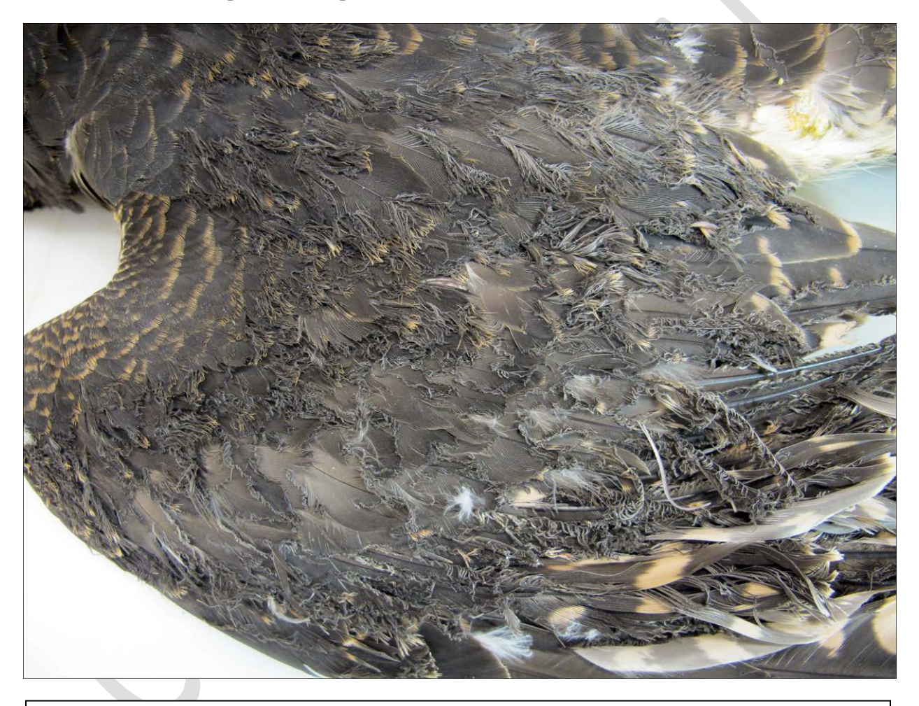
Figure 5: The dorsal aspect of the wing from a Peregrine Falcon (the same bird as shown in Figure 4) with Grade 2 lesions. Note extensive curling of feathers without visible charring. This bird was found alive, unable to fly, emaciated and died shortly thereafter. These findings demonstrate fatal loss of function due to solar flux exposure in the absence of skin or other soft tissue burns.

Twenty-nine birds with solar flux burns also had evidence of impact trauma. Trauma consisted of skull fractures or indentations (8), sternum fractures (4), one or more rib fractures (4), vertebral fractures (1), leg fracture (3), wing fracture (1) and/or mandible fracture (1). Other signs of trauma included acute macroscopic and/or microscopic internal hemorrhage. Location found was reported for 39 of these birds; most of the intact carcasses were found near or in a tower. One was found in the inner heliostat ring and one was found (alive) on a road between tower sites. The date of carcass collection was provided for 42/47. None were found prior to the reported first flux (2013).