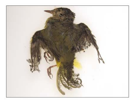
Figure 1: Three grades of flux injury based on extent and severity of burning. Grade 1 (top); Yellowrumped Warbler with less than 50% of the flight feathers affected (note sparing of the yellow rump feathers). Grade 2 (middle); Northern Rough-winged Swallow initially found alive but unable to fly, with greater than 50% of the flight feathers affected. Grade 3 (bottom); MacGillivray's Warbler with charring of feathers around the head, neck, wings and tail.