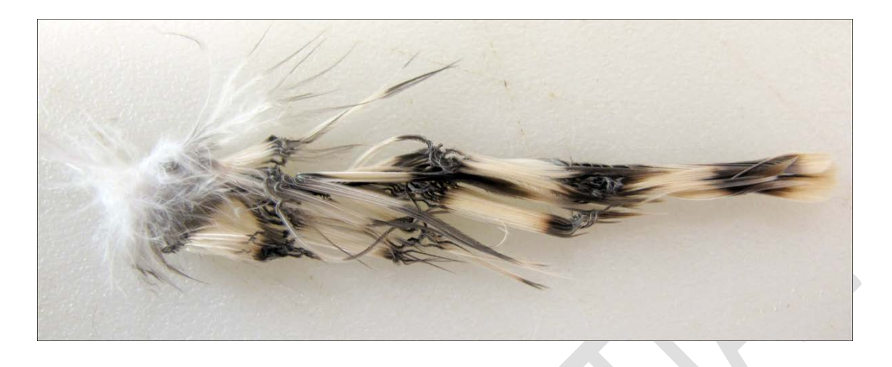
Figure 4: Feather from a Peregrine Falcon with Grade 2 solar flux injury. Note burning of dark feather bands with relative sparing of light bands.

The yellow and red rumps of Yellow-rumped Warblers and House Finches respectively remained strikingly unaffected (See Figure 1). Charring of head feathers, in contrast, was generally diffuse across all color patterns. A pattern of spiraling bands of curled feathers across or around the body and wings was often apparent.