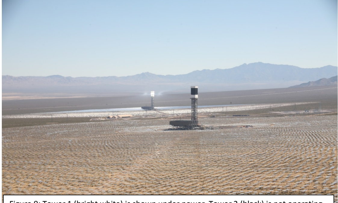
Figure 9: Tower 1 (bright white) is shown under power. Tower 2 (black) is not operating.

There is a phenomenon that occurs when the heliostats are focused on the tower and electricity is being generated. The phenomenon can be described as either a circle of clouds around the tower or, at times, a cloud formed on the side that is receiving the solar reflection. It appears as though the tower is creating clouds. Currently we propose two hypotheses of why this "cloud" is formed. The first hypothesis is simply the presumption that the high heat associated with towers is condensing the air, and forming the