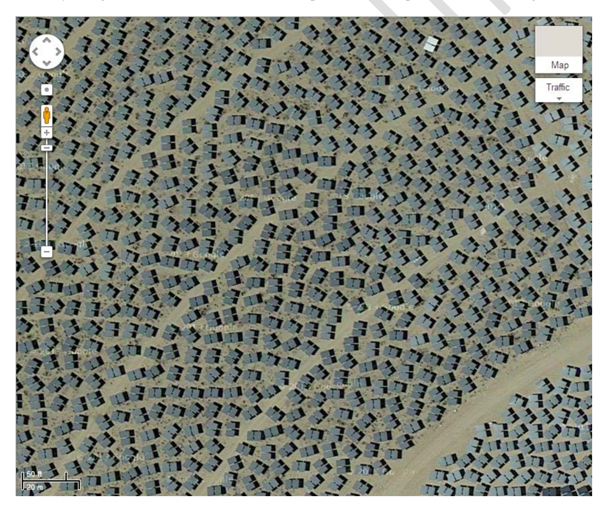
Figure 6: The Ivanpah Solar Electric Generating System as seen via satellite. The mirrored panels are 5 x 8 feet.

A desert environment punctuated by a large expanse of reflective, blue panels may be reminiscent of a large body of water. Birds for which the primary habitat is water, including coots, grebes, and cormorants, were over-represented in mortalities at the Desert Sunlight facility (44%) compared to Genesis (19%) and Ivanpah (10%). Several factors may inform these observations. First, the size and continuity of the panels differs between facilities. Mirrors at Ivanpah are individual, 4 x 8' panels that appear from above as stippling in a desert background (Figure 6). Photovoltaic panels at Desert Sunlight are long banks of adjacent 27.72 x 47.25" panels (70 x 120 cm), providing a more continuous, sky/water appearance. Similarly, troughs at Genesis are banks of 5 x 5.5' panels that are up to 49-65 meters long.