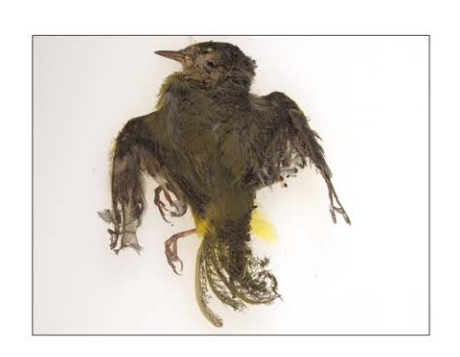
Figure 1: Three grades of flux injury based on extent and severity of burning. Grade 1 (top); Yellow-rumped Warbler with less than 50% of the flight feathers affected (note sparing of the yellow rump feathers). Grade 2 (middle); Northern Rough-winged Swallow initially found alive but unable to fly, with greater than 50% of the flight feathers affected. Grade 3 (bottom); MacGillivray's Warbler with charring of feathers around the head, neck, wings and tail.