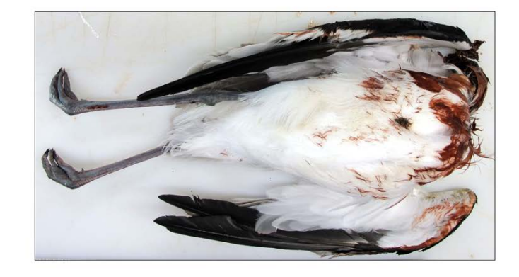
Figure 2: Predation trauma (top) resulting in traumatic amputation of the head and neck (American Avocet) and impact trauma (bottom) causing bruising of the keel ridge of the sternum (Brown Pelican).

Predation was the immediate cause of death for 15 birds. Lesions supporting the finding of predation included decapitation or missing parts of the body with associated hemorrhage (9/15), and lacerations of the skin and pectoral muscles. Eight of the predated birds from Desert Sunlight were