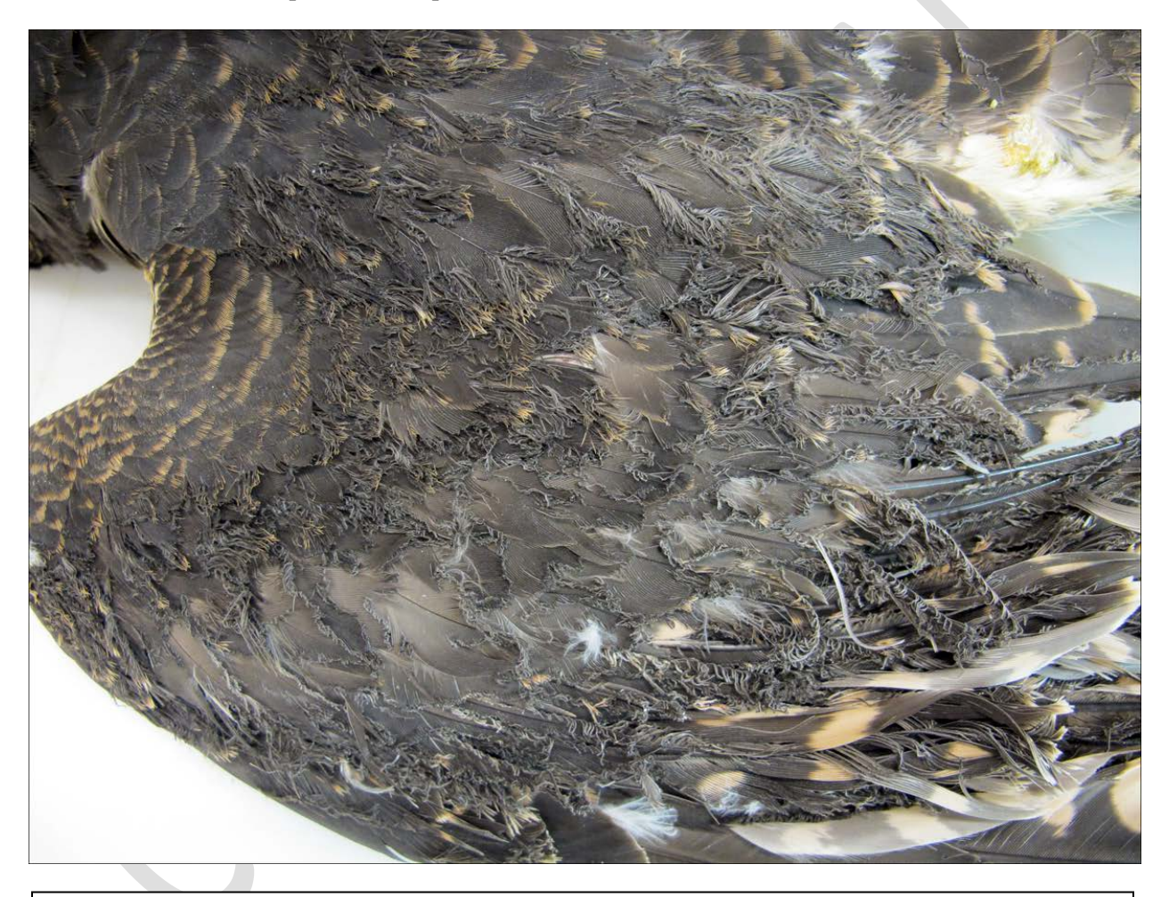
Figure 5: The dorsal aspect of the wing from a Peregrine Falcon (the same bird as shown in Figure 4) with Grade 2 lesions. Note extensive curling of feathers without visible charring. This bird was found alive, unable to fly, emaciated and died shortly thereafter. These findings demonstrate fatal loss of function due to solar flux exposure in the absence of skin or other soft tissue burns.

Twenty-nine birds with solar flux burns also had evidence of impact trauma. Trauma consisted of skull fractures or indentations (8), sternum fractures (4), one or more rib fractures (4), vertebral fractures (1), leg fracture (3), wing fracture (1) and/or mandible fracture (1). Other signs of trauma included acute macroscopic and/or microscopic internal hemorrhage. Location found was reported for 39 of these birds; most of the intact carcasses were found near or in a tower. One was found in the inner heliostat ring and one was found (alive) on a road between tower sites. The date of carcass collection was provided for 42/47. None were found prior to the reported first flux (2013).