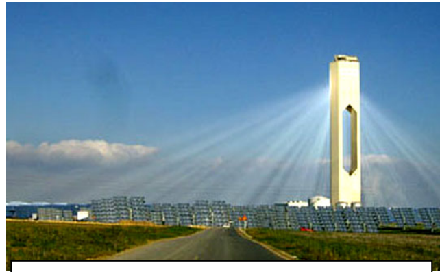
Figure 8: Seville solar power facility (http://inhabitat.com/sevilles-solar-power-tower)

If all the solar heliostats are focused on the solar tower the beams multiply the strength of sunlight by 5000 times, and this generates temperatures at the solar tower in excess of 3600° Fahrenheit (> 1982° Celsius). Since steel melts at 2750° Fahrenheit (1510° Celsius), only a percentage of heliostats are focused on the solar receiver so that) the optimal temperature at the tower is approximately 900° Fahrenheit (~482° Celsius) ("How do they do it" Wag TV for Discovery Channel, Season 3, Episode 15, "Design Airplane Parachutes, Create Solar Power, Make Sunglasses" Aired August 25, 2009).