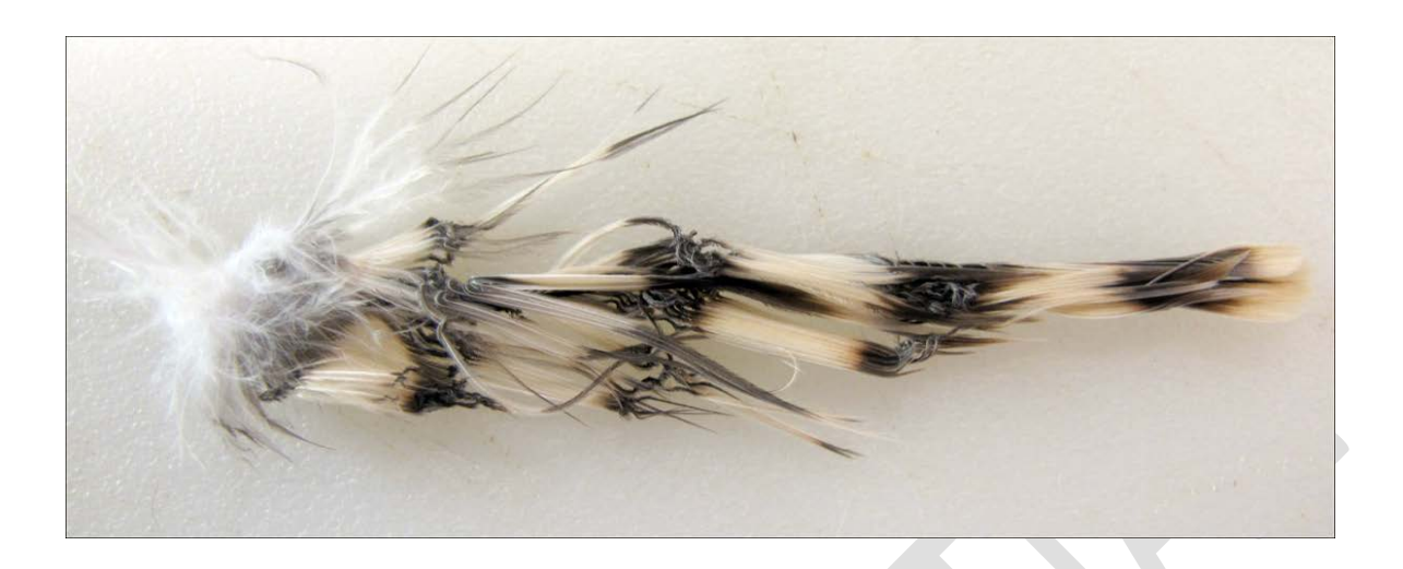
Figure 4: Feather from a Peregrine Falcon with Grade 2 solar flux injury. Note burning of dark feather bands with relative sparing of light bands.

The yellow and red rumps of Yellow-rumped Warblers and House Finches respectively remained strikingly unaffected (See Figure 1). Charring of head feathers, in contrast, was generally diffuse across all color patterns. A pattern of spiraling bands of curled feathers across or around the body and wings was often apparent.