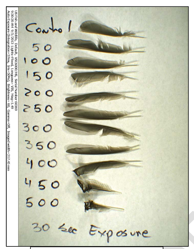
Figure 11: Results of exposing feathers to different temperatures (in degrees Celsius)

500° Celsius (842° and 932° Fahrenheit respectively) the feathers singed as soon as they made contact with the superheated air (Figure 11). Therefore, when singed birds are found, it can be inferred that the temperatures in the solar flux at the time a bird flew through it was at least 400° Celsius (752° Fahrenheit). This inference is consistent with the desired operating temperature of a power tower solar boiler (482° Celsius).