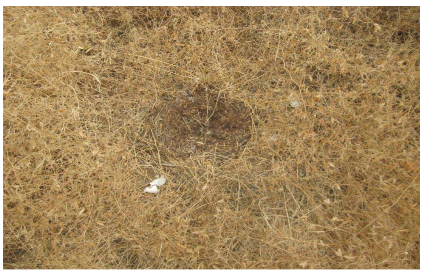
Photo 13, of abandoned mallard duck nest as observed by Designated Biologist during pre-mowing survey, 5/28/13.