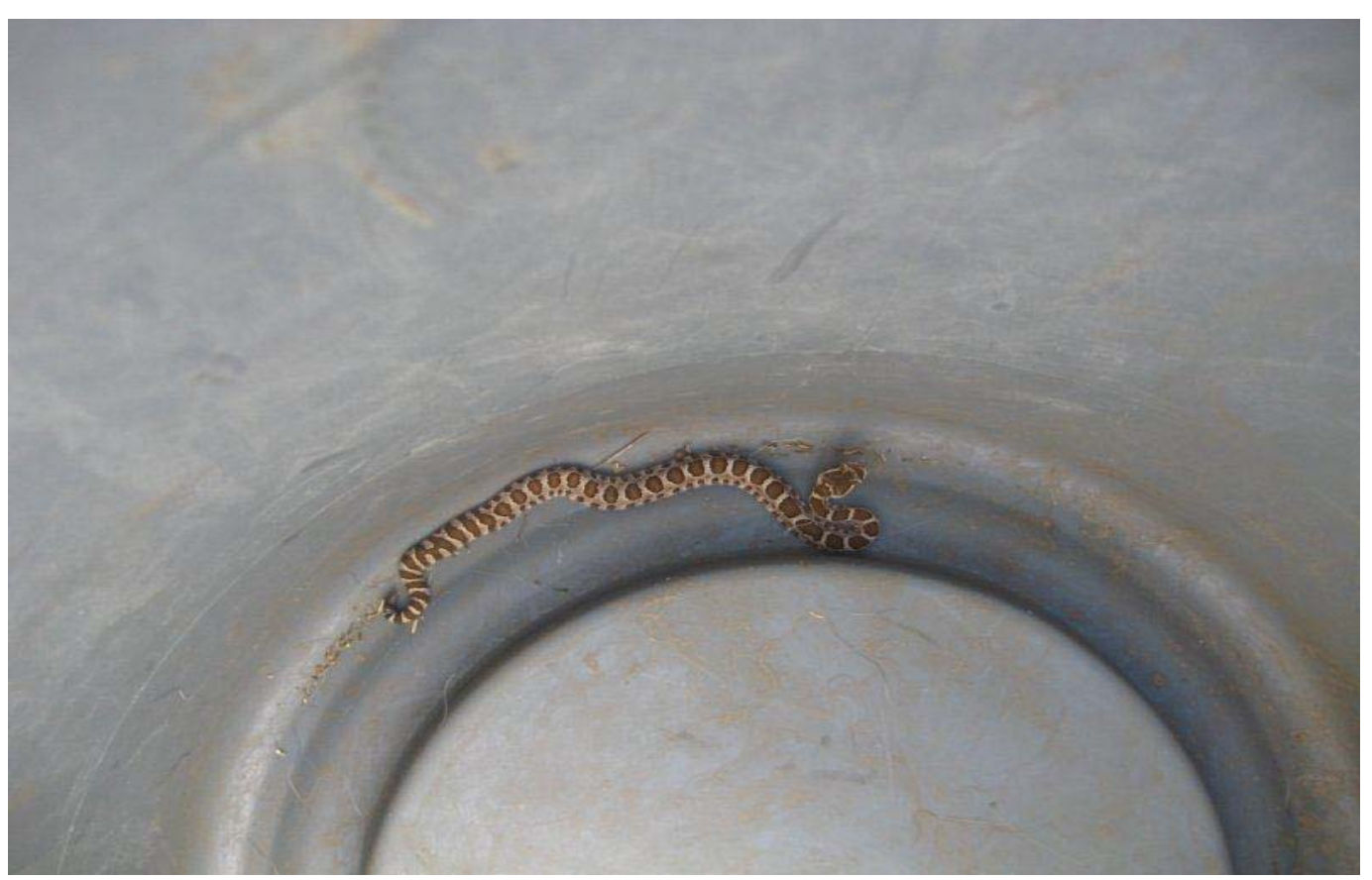
Photo 25, of juvenile western diamond back rattlesnake prior to safe release off site, 8/30/13.