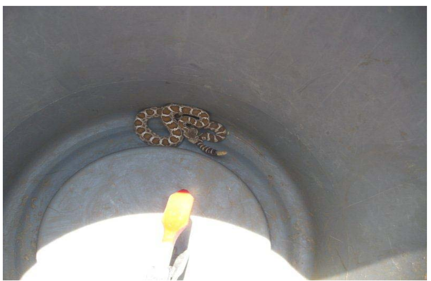
Photo 23, of western diamond back rattlesnake after capture and prior to relocation off site, 7/22/13.