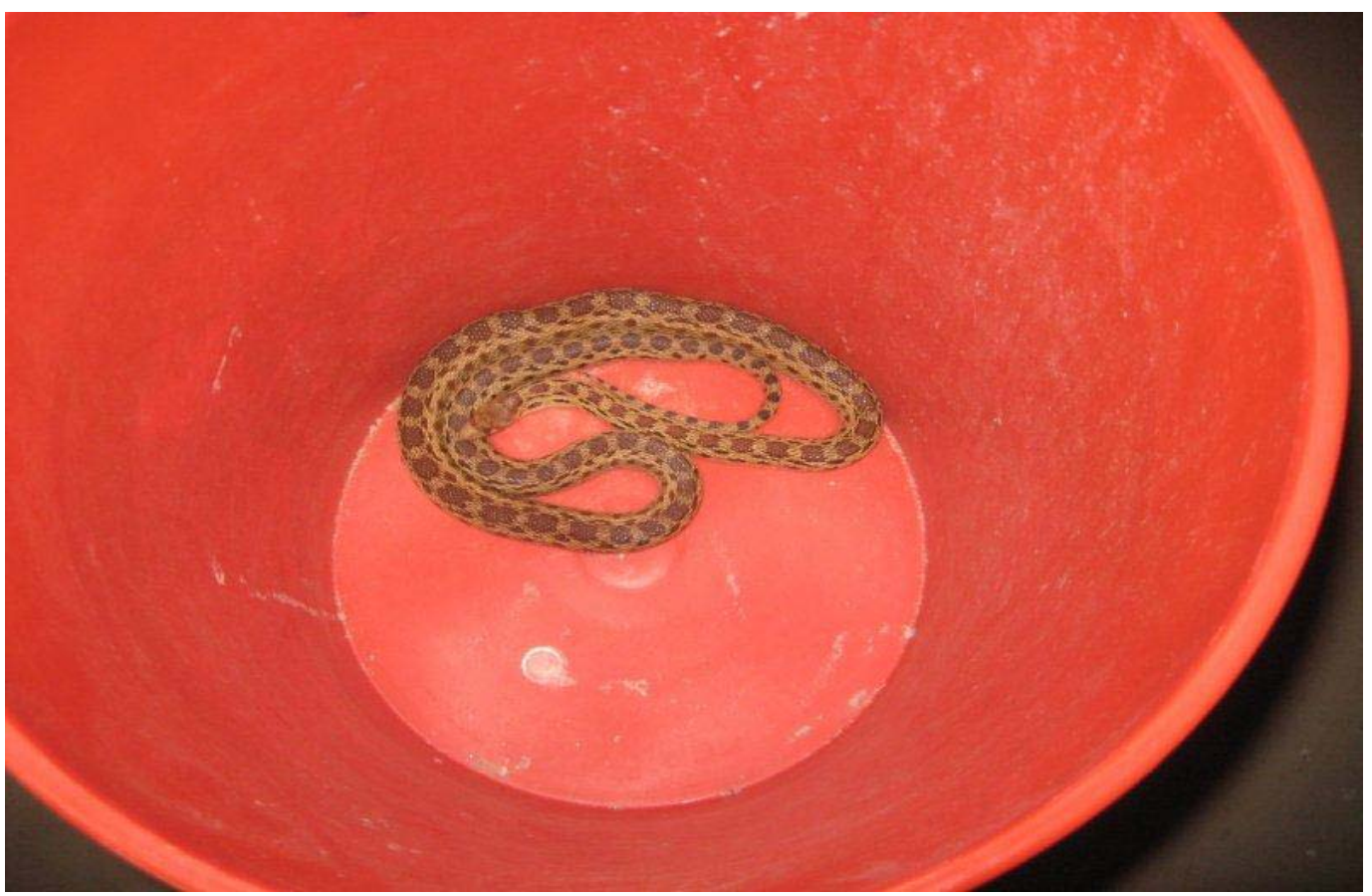
Photo 7, close-up of gopher snake prior to safe release off site, 4/29/13.