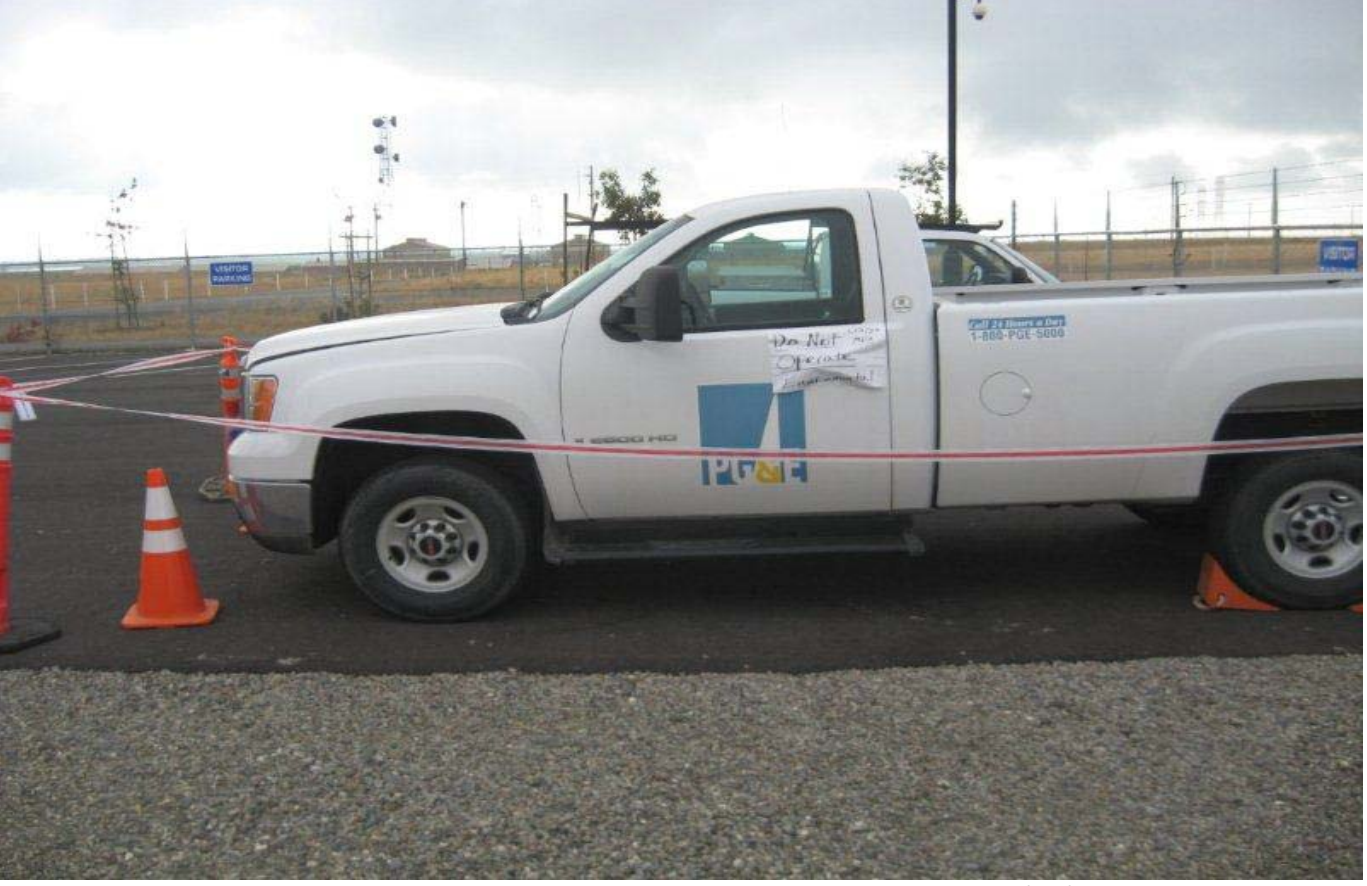
Photo 12, of vehicle exclusion due to nesting birds under hood, 5/28/13.