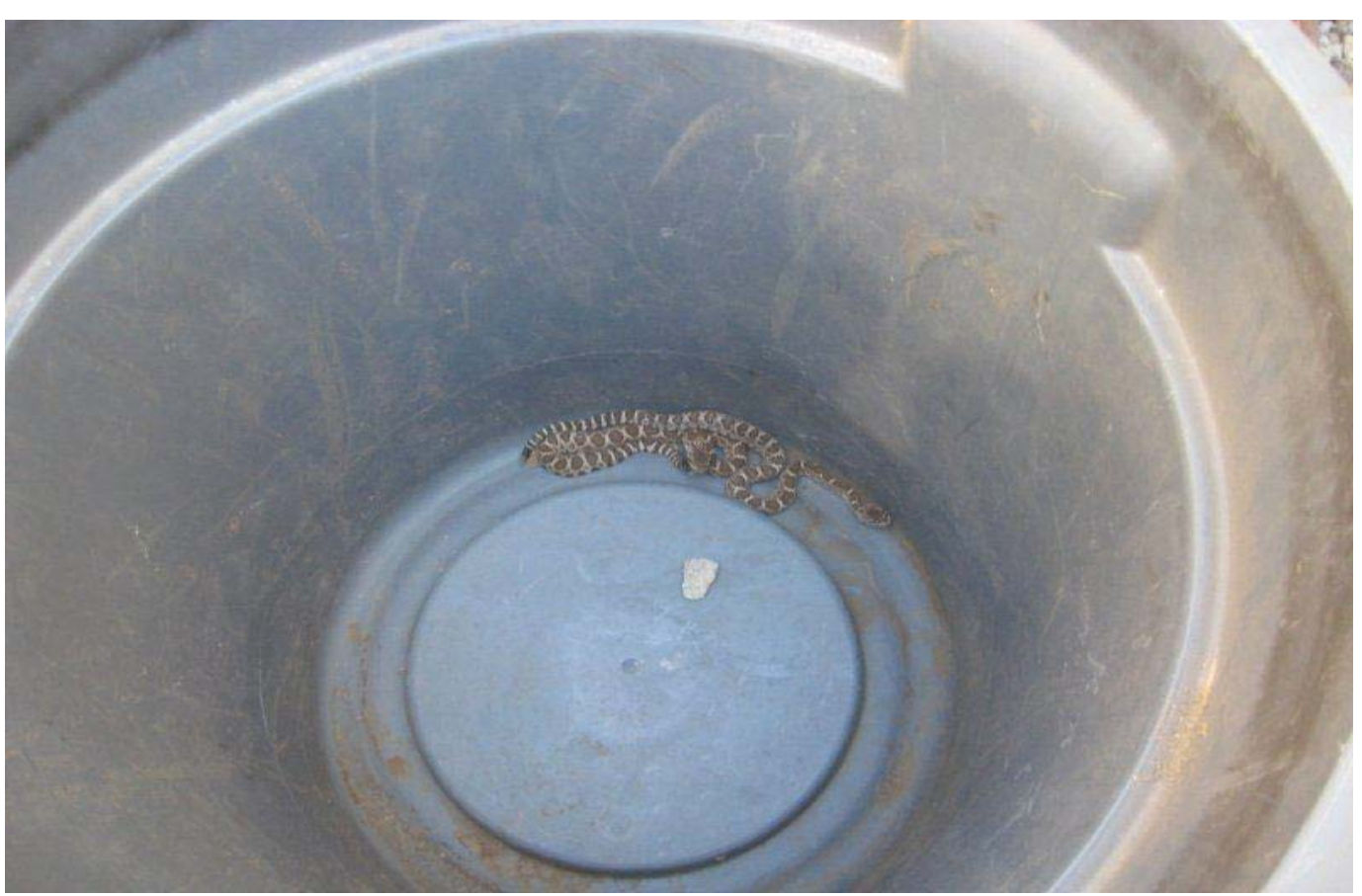
Photo 9, of two western diamond back rattlesnake after capture on CGS site , 5/2/13.