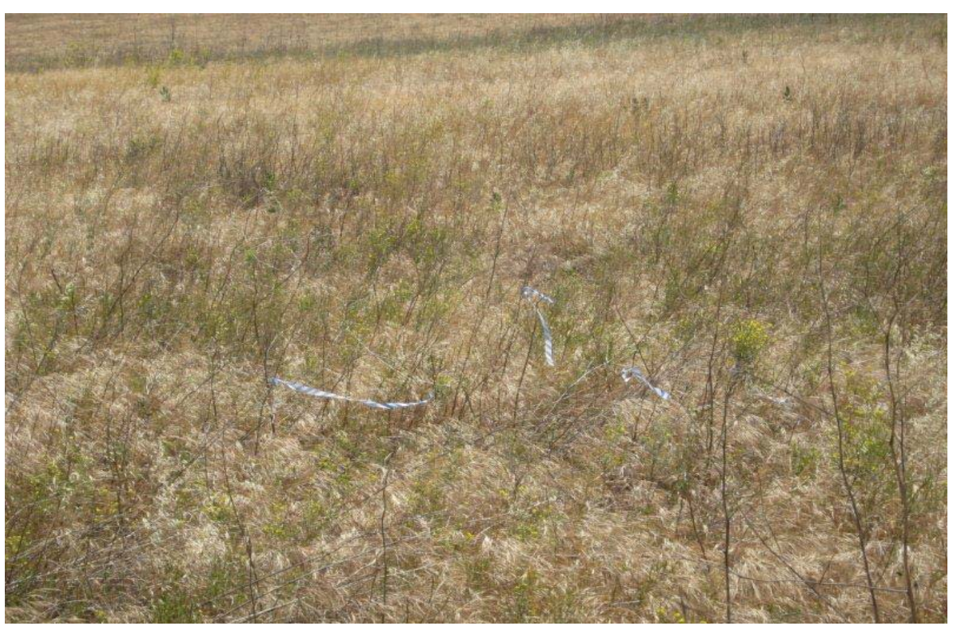
Photo 17, of active mallard nest with flagging to prevent mowing in nest area, 5/28/13.