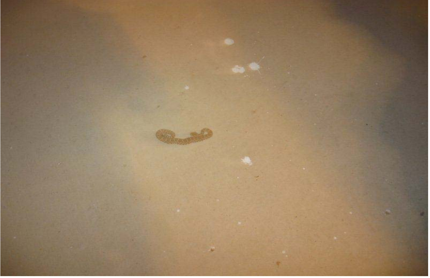
Photo 8, of western diamond back rattlesnake after capture on CGS site, 4/29/13.