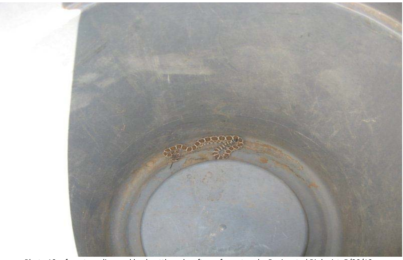
Photo 19, of western diamond back rattlesnake after safe capture by Designated Biologist, 5/30/13.