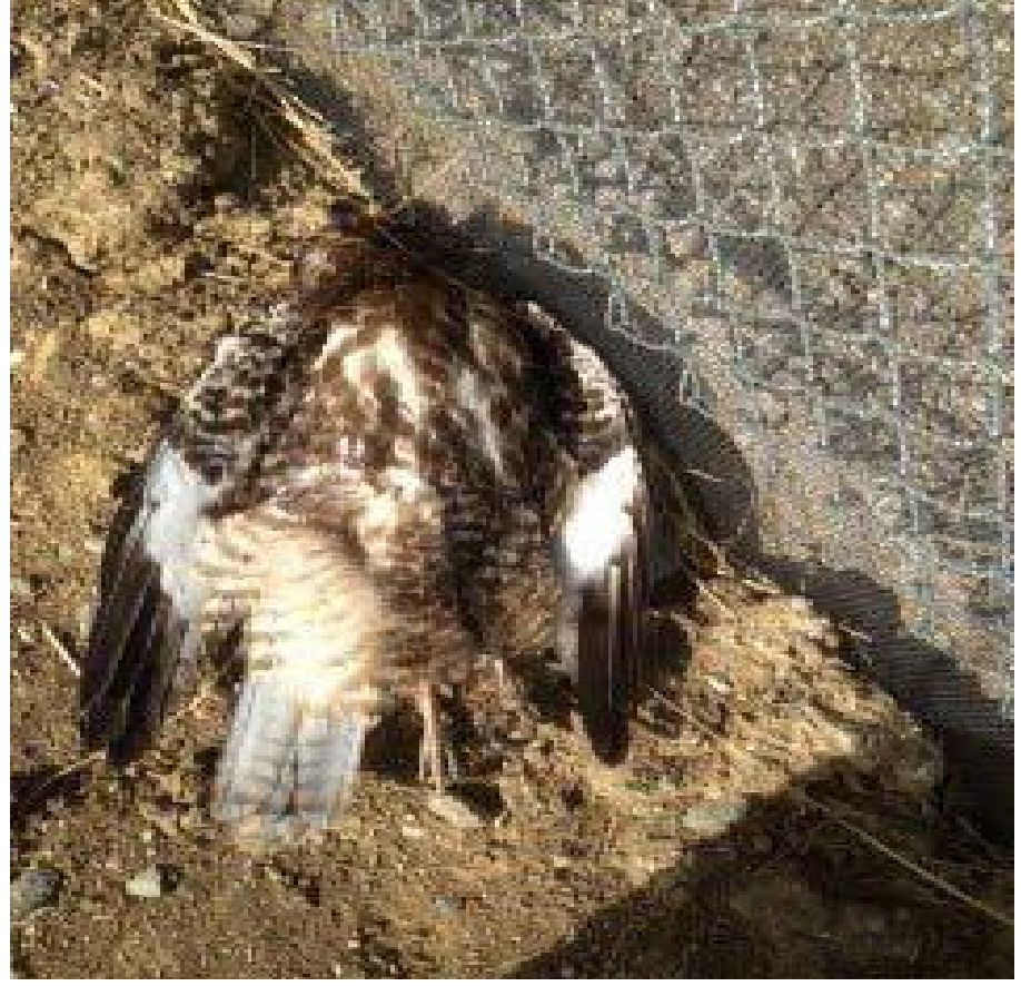
Photo 24, of dead immature red-tailed hawk as observed on ground in northern portion of site 8/12/13.