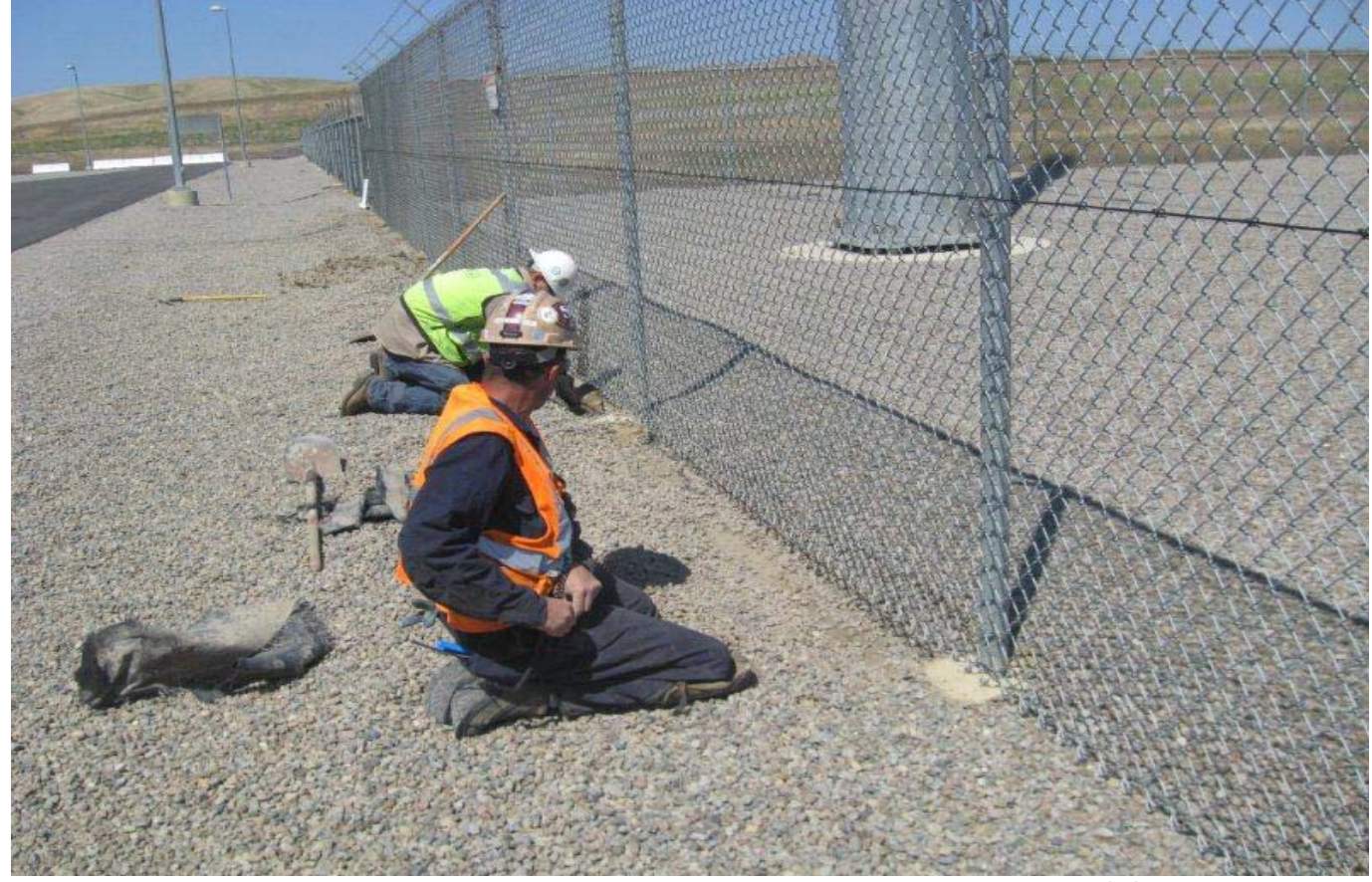
Photo 10, of CGS employees repairing snake fencing near CGS switch yard, 5/2/13.