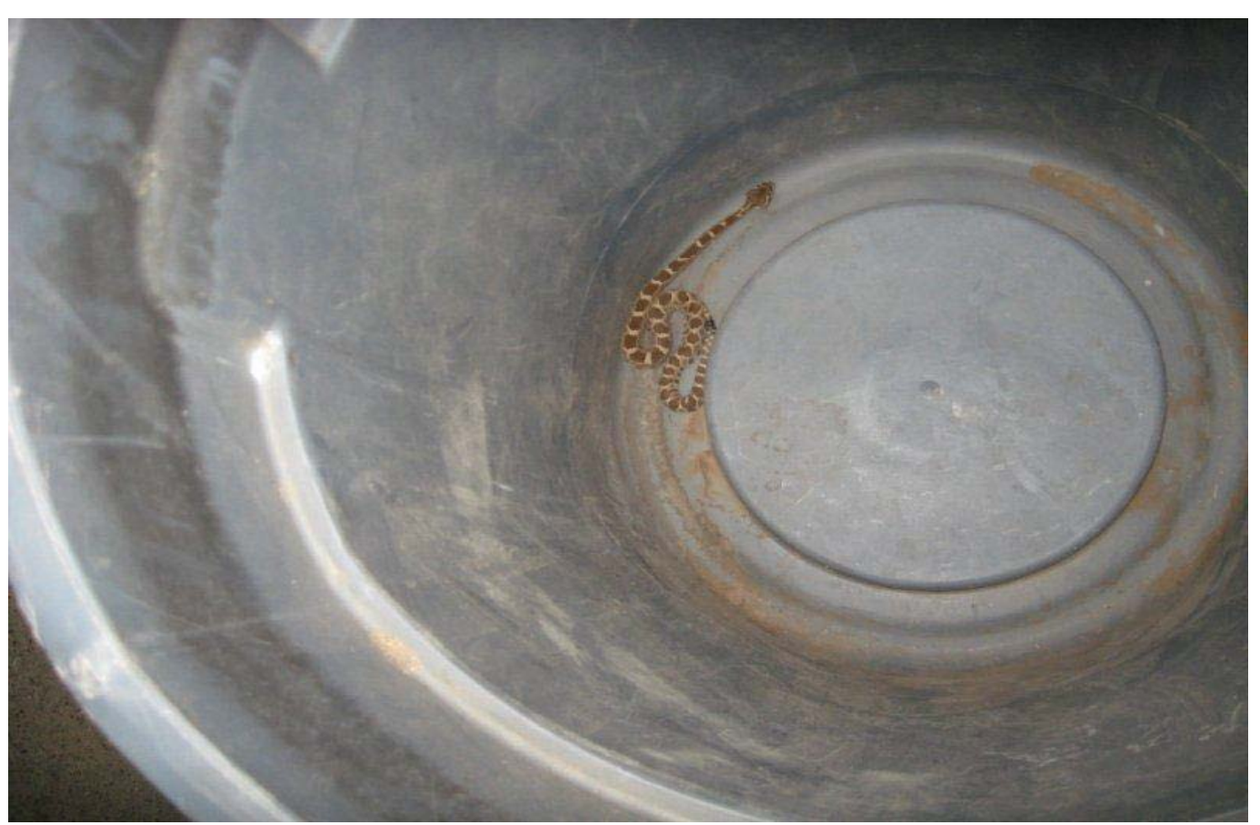
Photo 21, of western diamond back rattlesnake prior to safe release off site by Designated Biologist, 6/13/13.