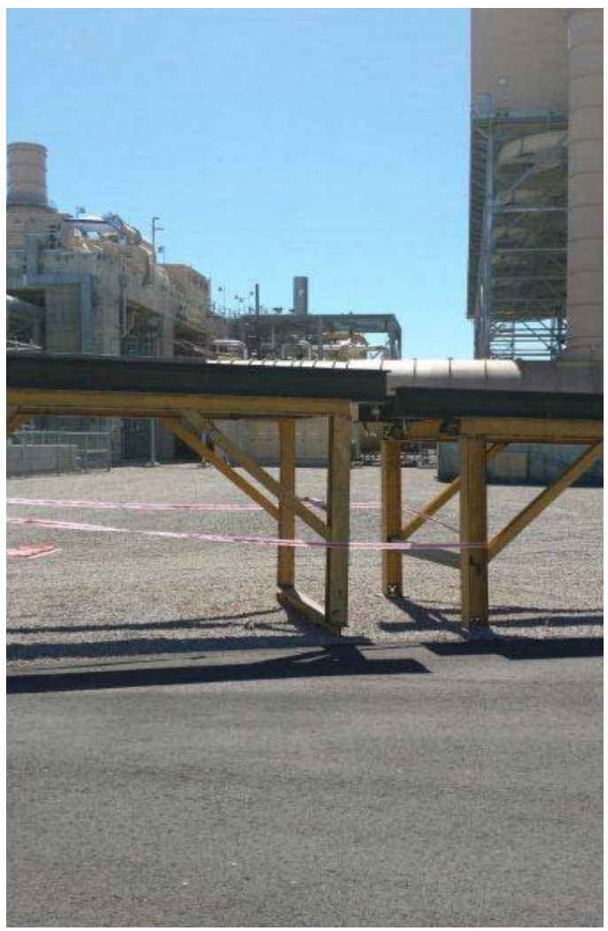
Photo 27, exclusion area delineated by PG&E Compliance Manager, 9/4/13.