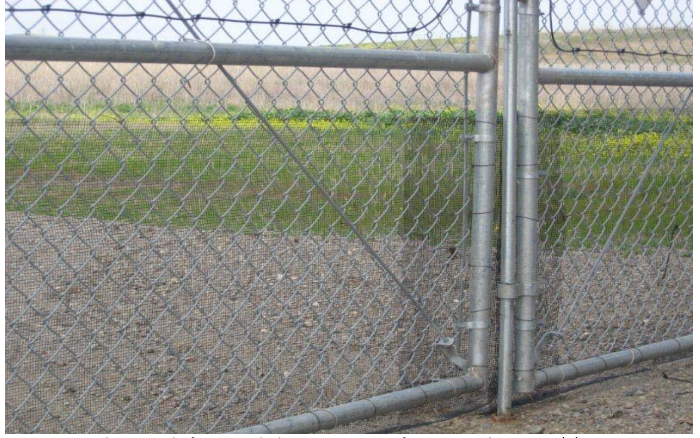
Photo 2, snake fencing applied to outer perimeter fencing around CGS site, 3/4/13.