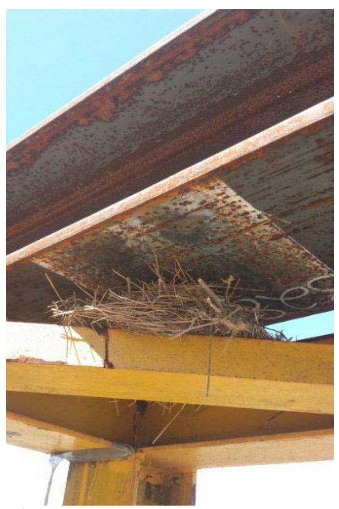
Photo 26, of stick nest as observed by PG&E Compliance Manager, 9/4/13.