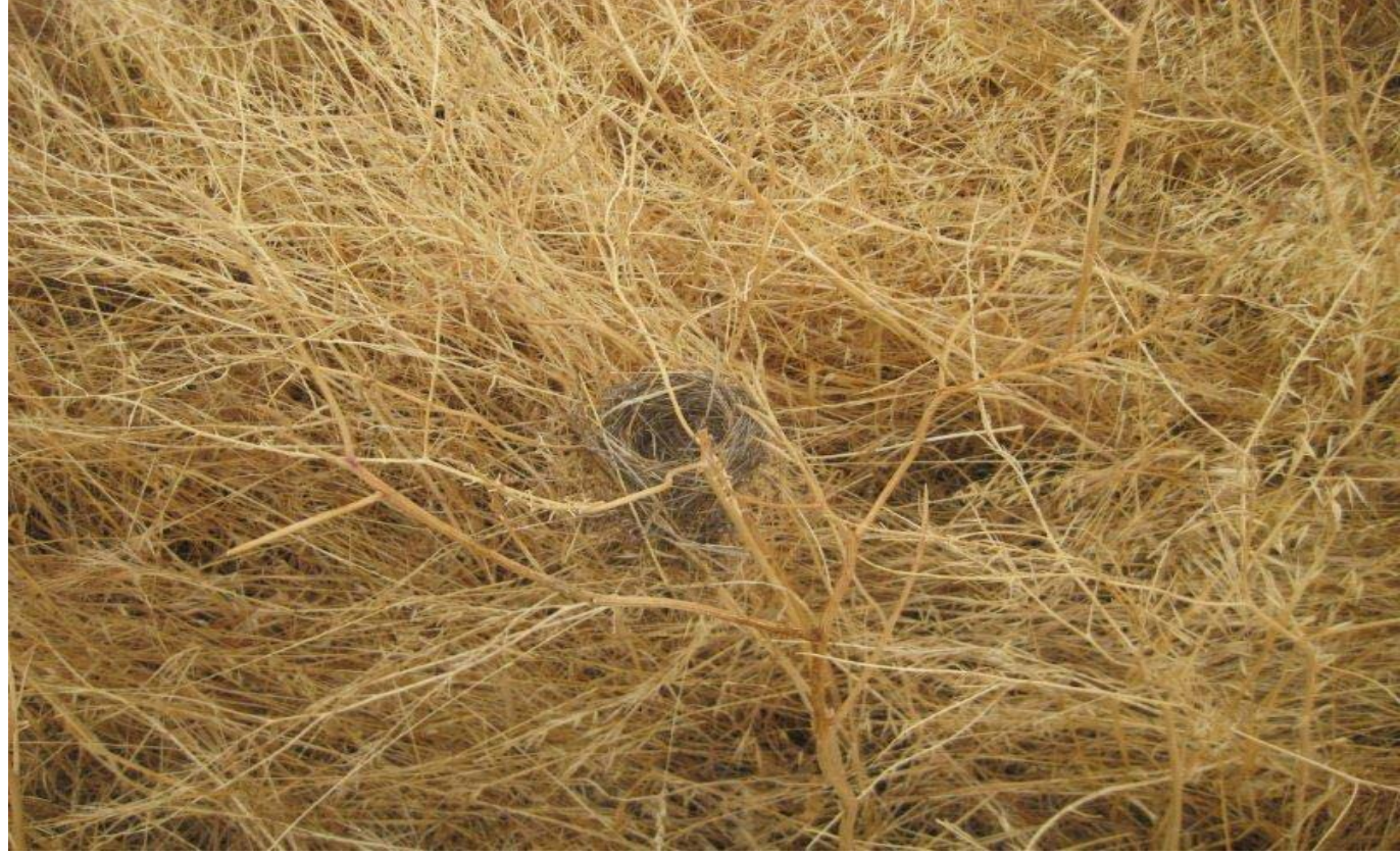
Photo 14, of abandoned red-winged blackbird nest as observed by Designated Biologist during pre-mowing survey, 5/28/13.