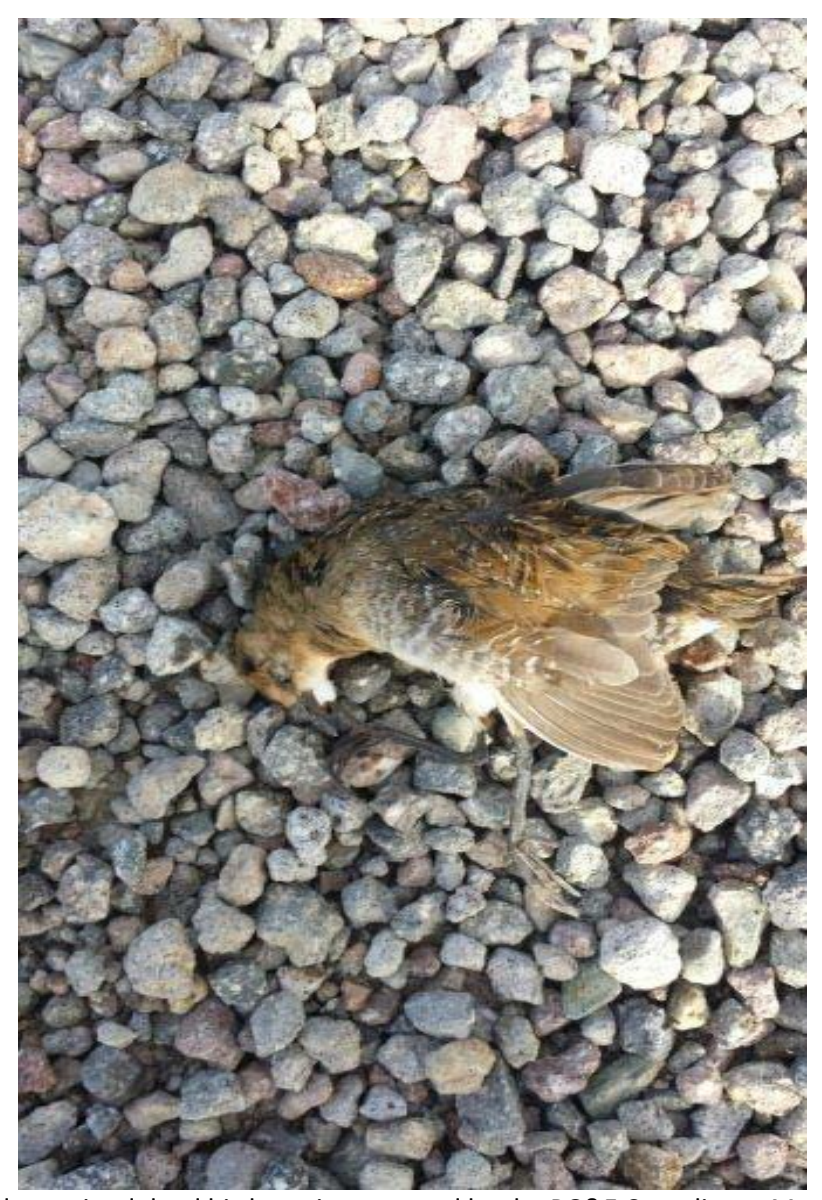
Photo 28, of undetermined dead bird species reported by the PG&E Compliance Manager, 11/11/13.