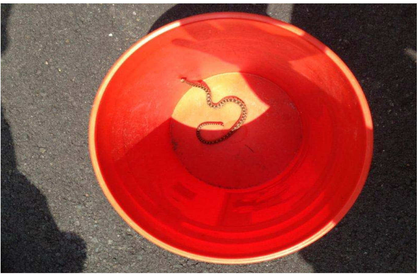
Photo 11, of juvenile gopher snake prior to safe release off site, 5/8/13.