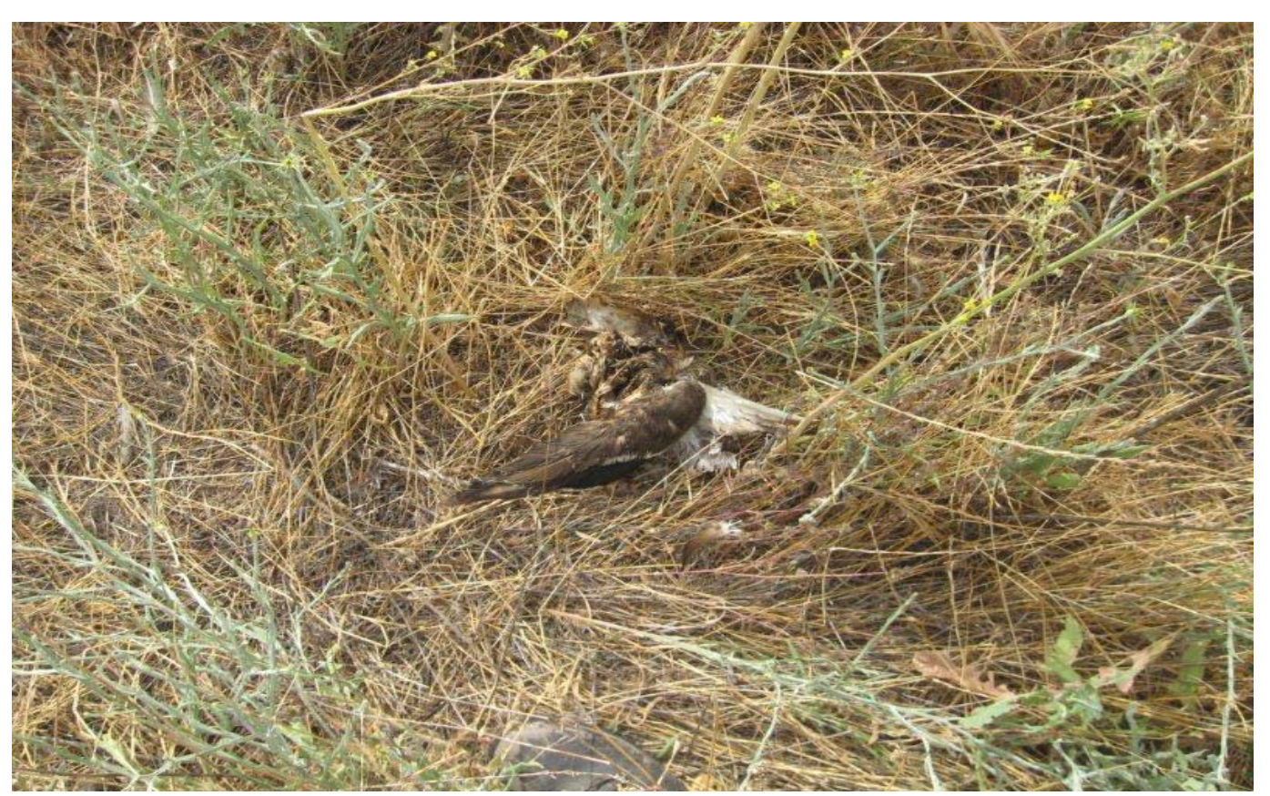
Photo 15, of carcass of female mallard duck as observed by Designated Biologist during pre-mowing survey, 5/28/13.