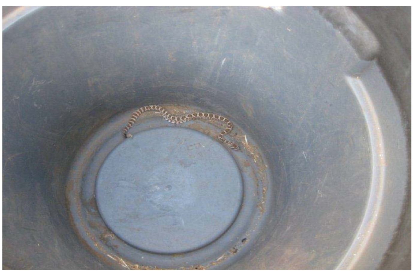
Photo 5, juvenile western diamond back rattlesnake prior to safe release, 4/27/13.