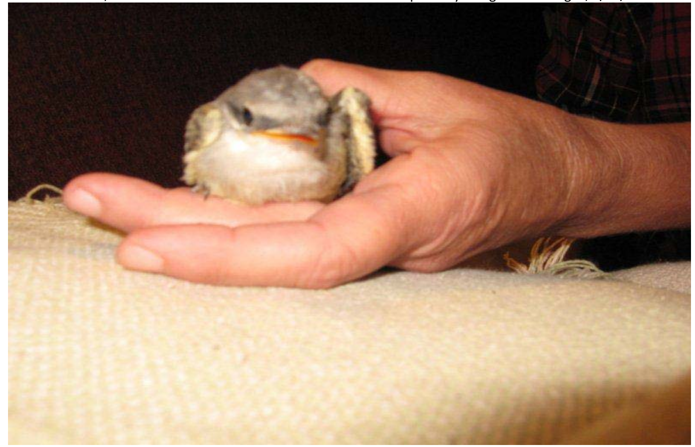
Photo 20, of juvenile western kingbird prior to drop off at Wildlife Care Facility, 6/5/13.