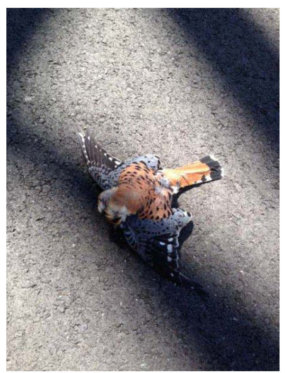
Photo 22, of dead American kestrel as observed by PG&E Compliance Manager, 6/19/13.