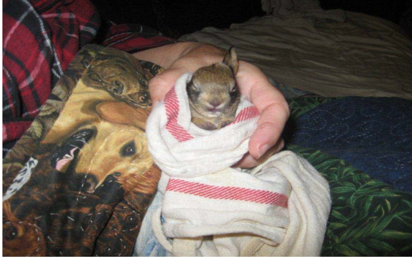
Photo 18, of juvenile black-tailed hare prior to dropping off at Wildlife Care Facility, 5/29/13.