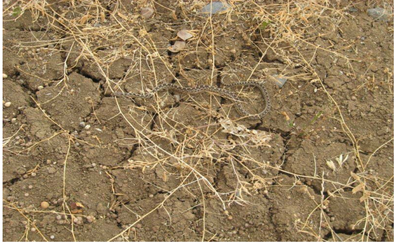
Photo 16, of gopher snake prior to capture and safe release off site, snake observed during pre-mowing survey by Designated Biologist, 5/28/13.