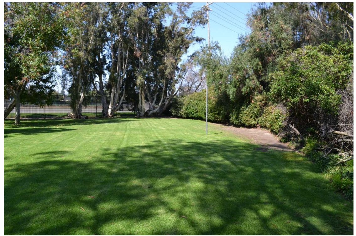
Alamitos Energy Center. Photo of existing break area, view facing northwest.