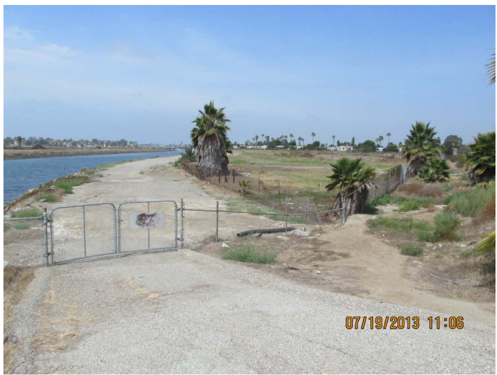
Alamitos Energy Center. Photo from the southwest corner of the existing bridge over Loynes Drive, view facing southwest.