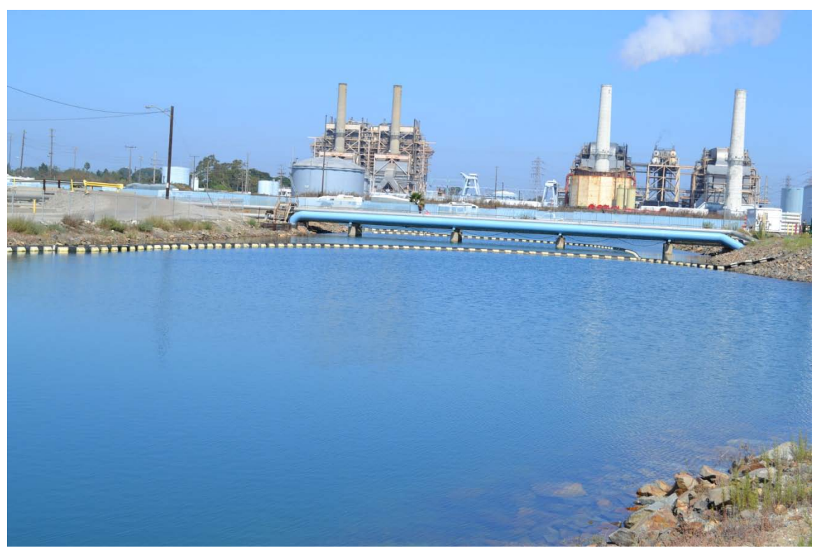
Alamitos Energy Center. Photo of existing channel and facilities, view facing north.