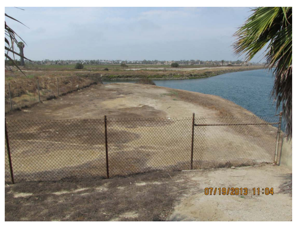
Alamitos Energy Center. Photo from southeast corner of the existing bridge over Loynes Drive, view facing southwest.