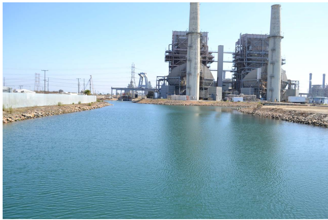
Alamitos Energy Center. Photo of existing facilities, view facing east.