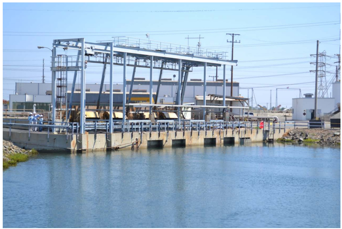
Alamitos Energy Center. Photo of existing facilities, view facing east.