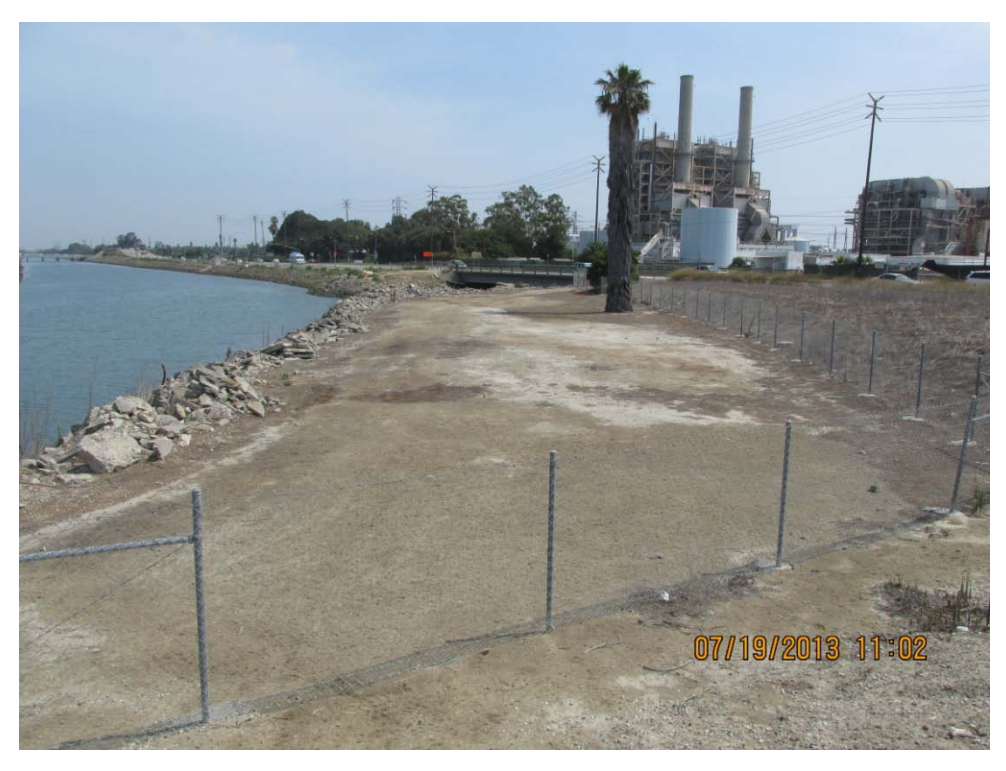
Alamitos Energy Center. Photo from the northeast corner of the existing bridge over Loynes Drive, view facing northeast.