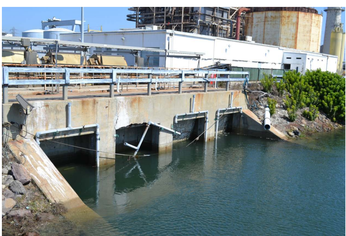
Alamitos Energy Center. Photo of existing facilities, view facing northeast.