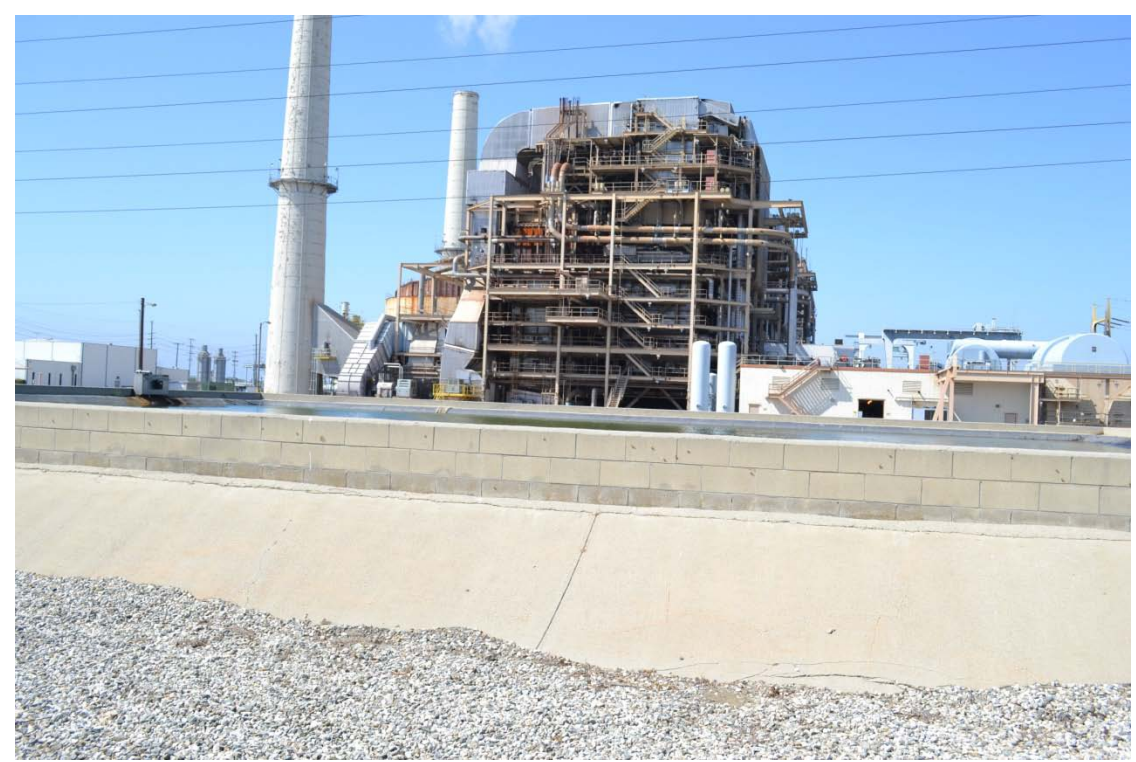
Alamitos Energy Center. Photo of existing facilities, view facing west southwest.