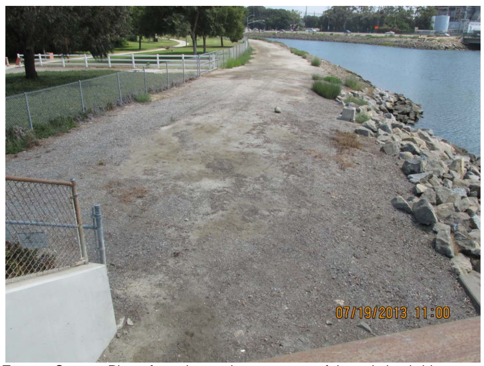
Alamitos Energy Center. Photo from the northwest corner of the existing bridge over Loynes Drive, view facing northeast.