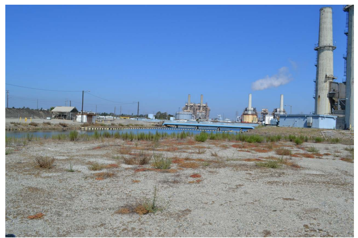
Alamitos Energy Center. Photo of existing channel and facilities, view facing north northwest.