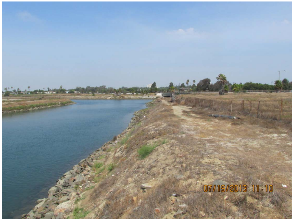
Alamitos Energy Center. Photo from the channel from the AES site and south of Loynes Drive, view facing northwest.