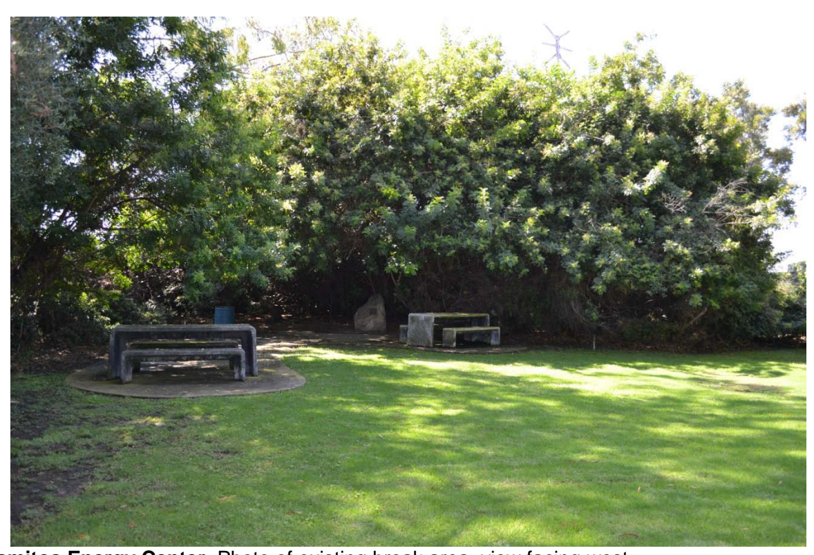
Alamitos Energy Center. Photo of existing break area, view facing west.