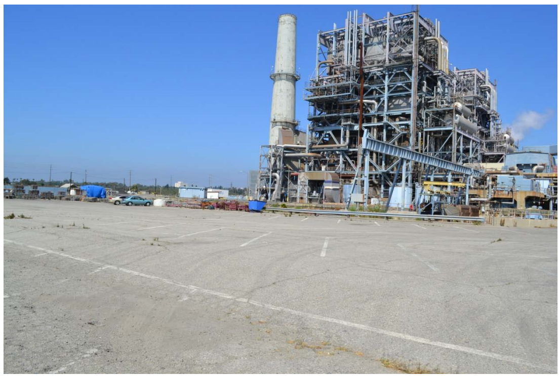
Alamitos Energy Center. Photo of existing facilities, view facing northwest.