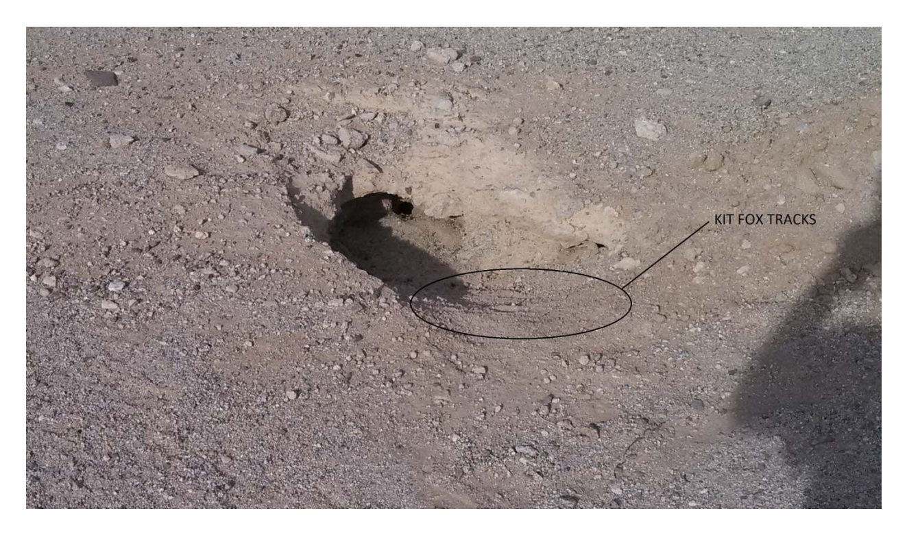
Figure 2 - RSEP Project Site Third Set of Tracks Found Along Southern Perimeter of DT Fence