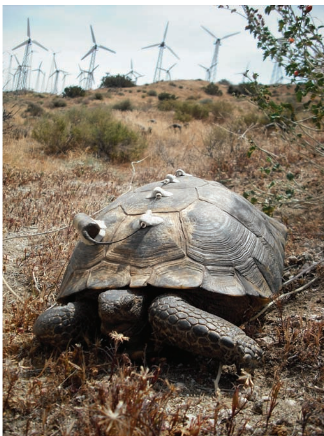
Figure 1. Agassiz's desert tortoise ( Gopherus agassizii ). Large areas of desert tortoise habitat are developed or being evaluated for renewable energy development, including for wind and solar energy.

tortoise ( Gopherus agassizii ; figure 1). Distributed north and west of the Colorado River, the species was listed as threatened under the US Endangered Species Act in 1990. Because of its protected status, Agassiz's desert tortoise acts as an "umbrella species," extending protection to other plants and animals within its range (Tracy and Brussard, 1994). The newly described Morafka's desert tortoise ( Gopherus morafkai ; Murphy et al. 2011) is another species of significant conservation concern in the desert Southwest, found east of the Colorado River. Both tortoises are important as ecological engineers who construct burrows that provide shelter to many other animal species, which allows them to escape the temperature extremes of the desert (Ernst and Lovich 2009). The importance of these tortoises is thus greatly disproportionate to their intrinsic value as species. By virtue of their protected status, Agassiz's desert tortoises have a significant impact on regulatory issues in the listed portion of their range, yet little is known about the effects of USSEDO on the species, even a quarter century after the recognition of that deficiency (Pearson 1986). Large areas of habitat occupied by Agassiz's desert tortoise in particular have potential for development of USSED (figure 2).