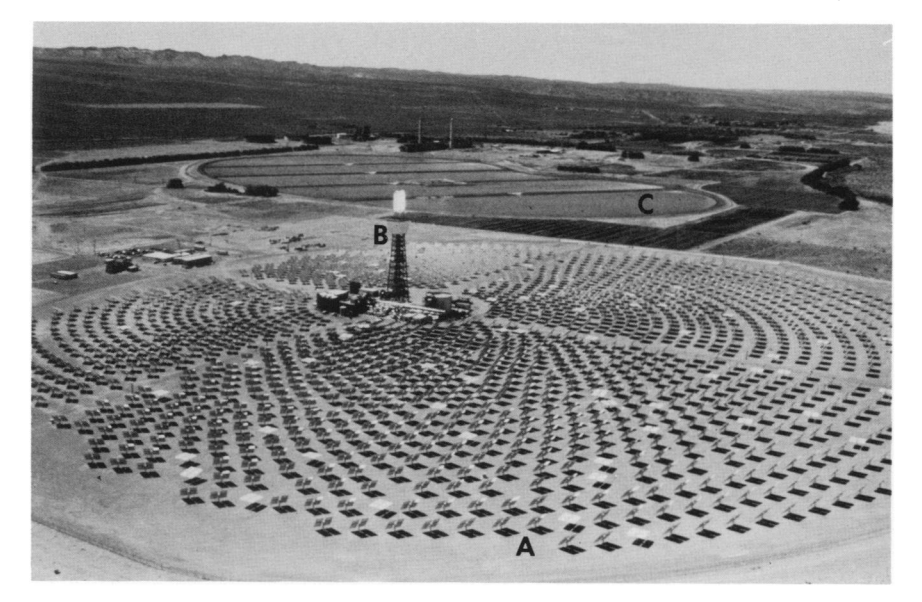
FIGURE 1. Aerial view of Solar One: (A) heliostat field, (B) central receiver tower, (C) evaporation ponds. Tower height = 86 m, diameter of field = 765 m.

To determine the impact of bird mortality on local populations, 1-2 observers conducted surveys of relative avian abundance within an area of approximately 150 ha surrounding Solar One, concentrating on the facility grounds (32 ha), evaporation ponds, and agricultural fields. These surveys were conducted on at least 2 d per visit for 3-4 h/d.