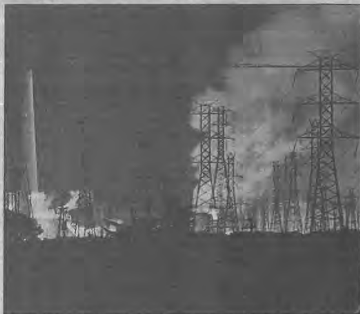
A fire blazes at the Vistra power plant's battery storage facility in Moss Landing in Monterey County.

You might ask why Battery Storage Energy System facilities