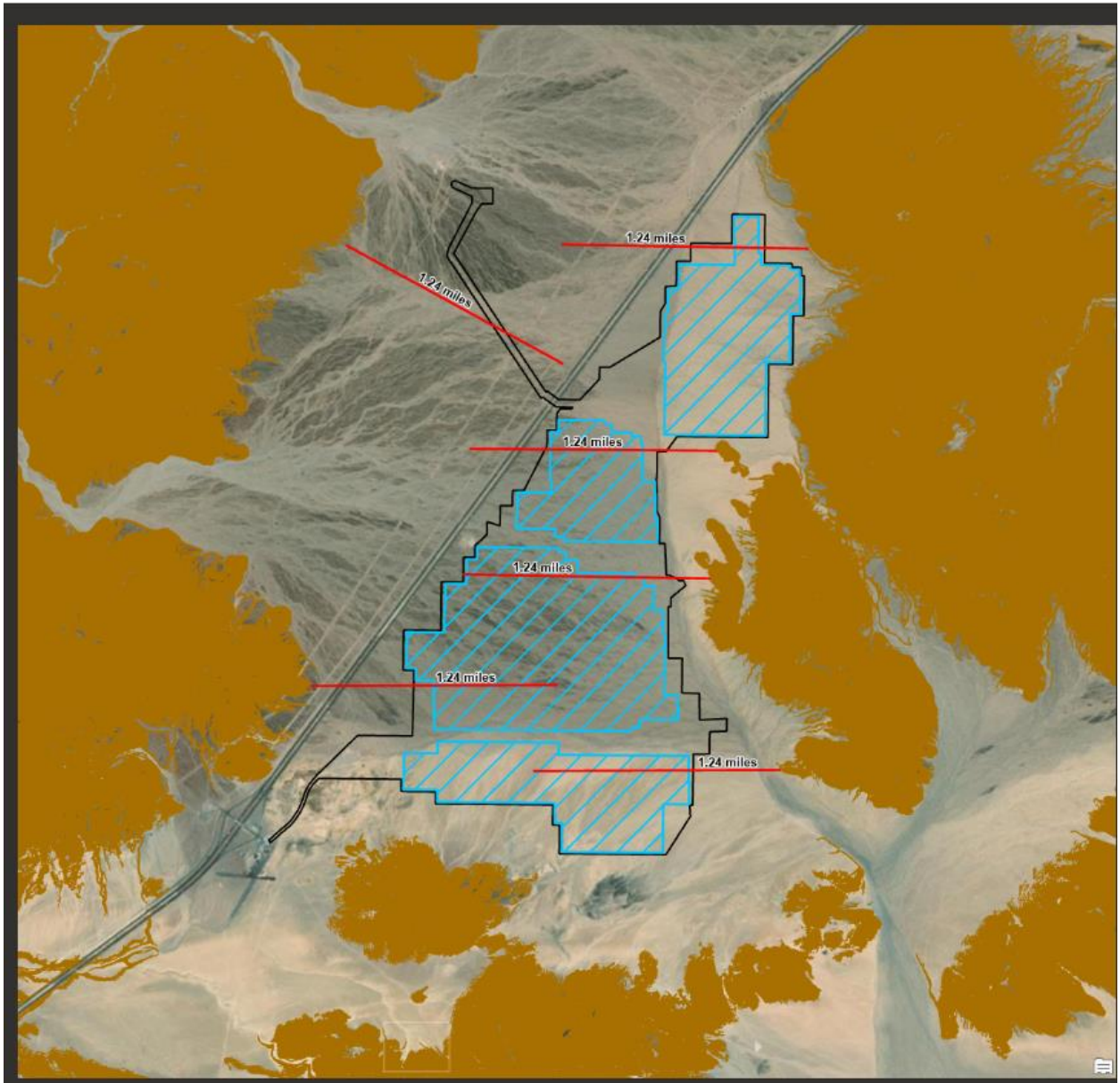
Figure 2. 1.24 buffer from 10% slope