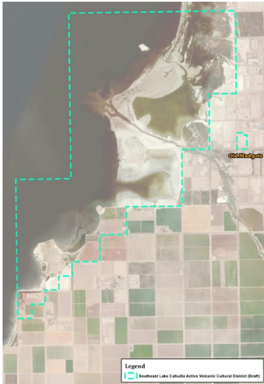
Figure 5.4-2 Boundaries of the Southeast Lake Cahuilla Active Volcanic Cultural District