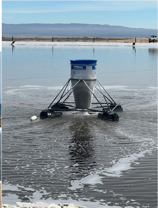
Photos 3&4: Location and close-up of PittBoss Sprayer-less Evaporators installed in the Alpha East Pond.

The CEC instructed MSP to monitor the effects that the evaporators have on birds. To date, birds have not been observed interacting with them and since the completion of netting over the ponds, this is no longer a concern.