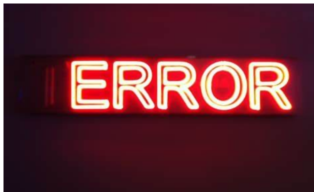
Fixing charger failures