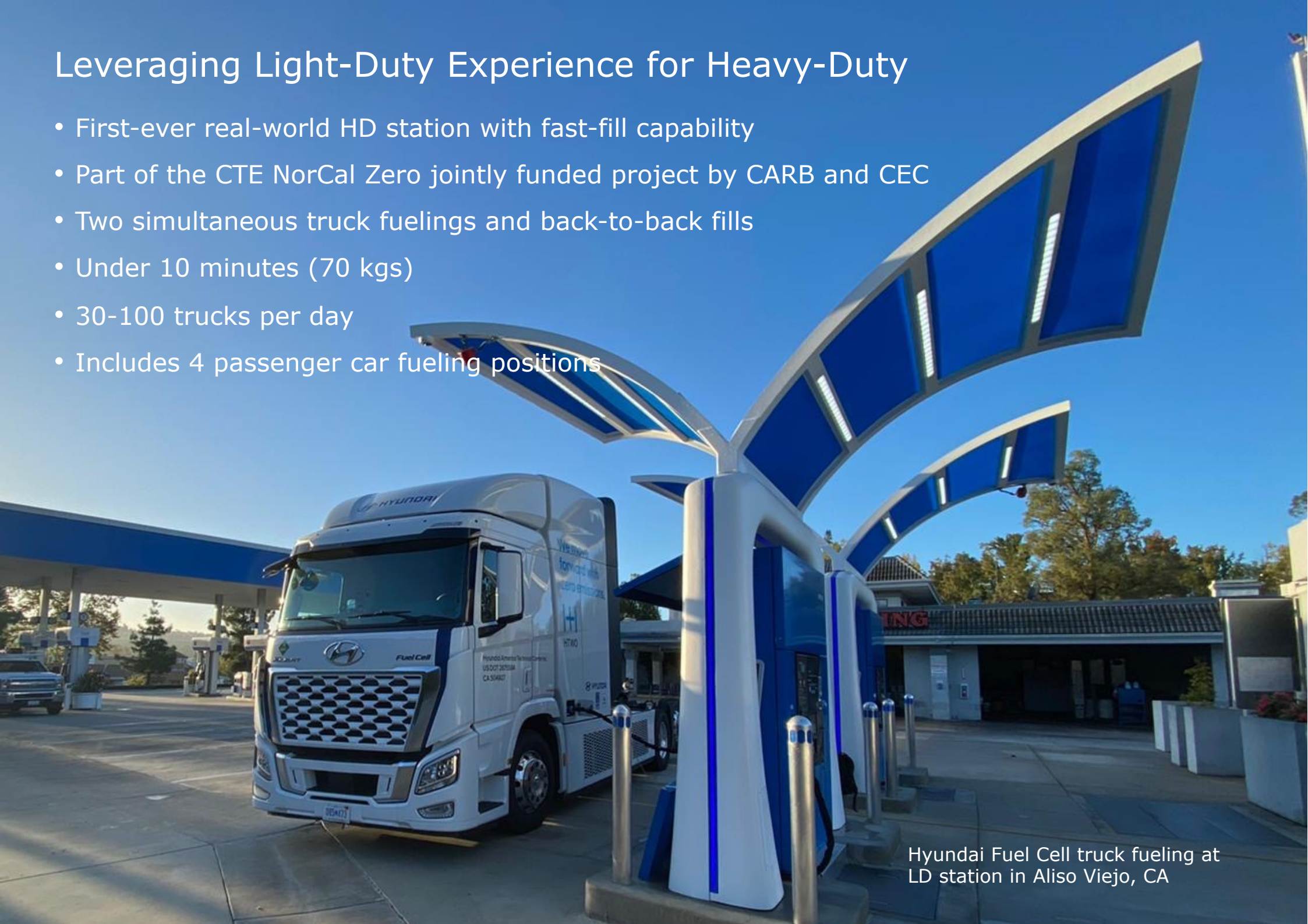
Hyundai Fuel Cell truck fueling at LD station in Aliso Viejo, CA