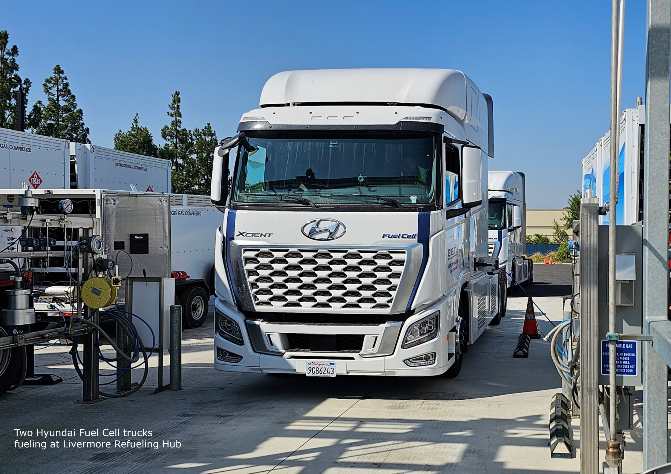
Two Hyundai Fuel Cell trucks fueling at Livermore Refueling Hub